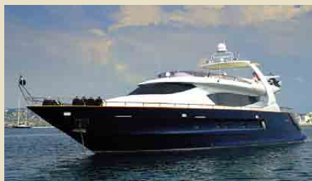
MABRUK II 27.00 m 8-12/4 West Mediterranean 34,800 €/week