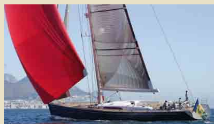
Mrs SEVEN 30.20 m 8/5 West Mediterranean 52,000 €/week