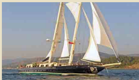
OFELIA 36.00 m 12/6 East Mediterranean 32,000 €/week