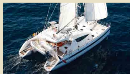
Catamaran ELYSIUM 18.90 m 8/2 Mediterranean-Caribbean 20,000 -24,000 €/week