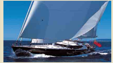
DRUMBEAT 53.00 m 11/10 West Mediterranean 170,000 €/week