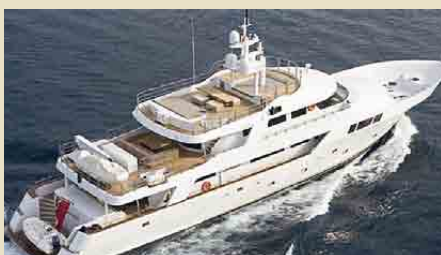
SENSEI 39.98 m 10/7 West Mediterranean 98,000 €/week