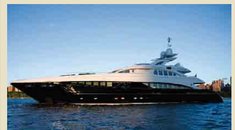
BLISS 44.17 m 10/9 West Mediterranean 160,000 €/week