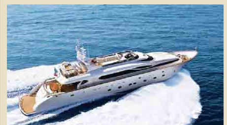
PARIS 35.00 m 12/6 East Mediterranean 90,000 €/week