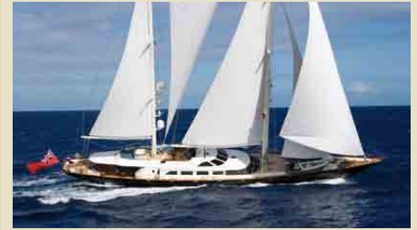
ANTARA 46.00 m 12/8 West Mediterranean 150,000 €/week