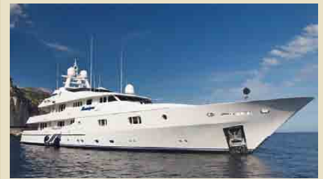
MOSAIQUE 50.01 m 12/12 West/East Mediterranean 200,000 €/week