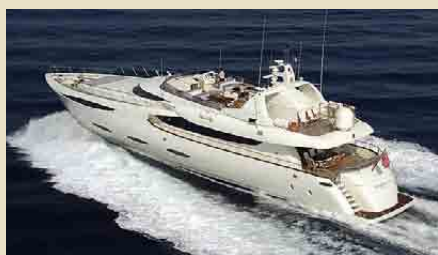
MABRUK III 35.00 m 10/5-7 West Mediterranean 70,000 €/week