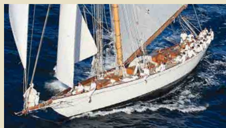
MOONBEAM IV 27.40 m 7/6 West Mediterranean 45,000 €/week