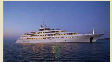
O'MEGA 82 m 30 West/East Mediterranean 450,000 €/week