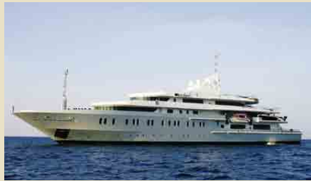
MOONLIGHT II (Ex Alysia) 85.30 m 36/32 West Medit/Indian Ocean 695,000 €/week