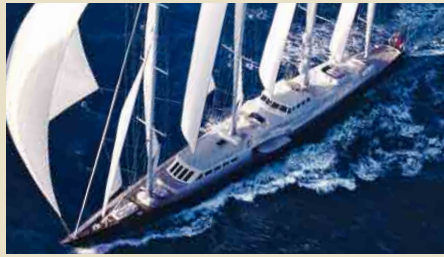
Name: PHOCEA Length: 78.15 m Guest/Crew: 12/15 Area: Mediterranean-Caribbean Rate: 160,000-180,000 €/week