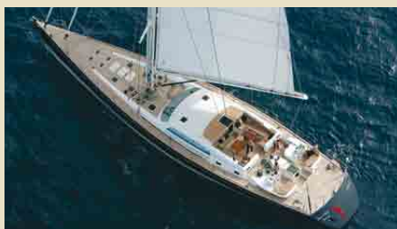
GRAND BLEU VINTAGE 29.00 m 8/4 West Mediterranean 45,000 €/week