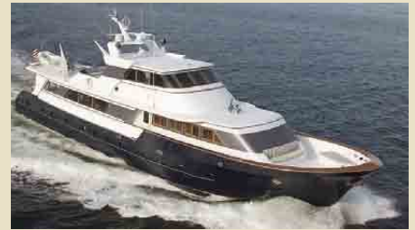
NYMPHAEA 33.00 m 6/3 Other destinations 30,000 €/week