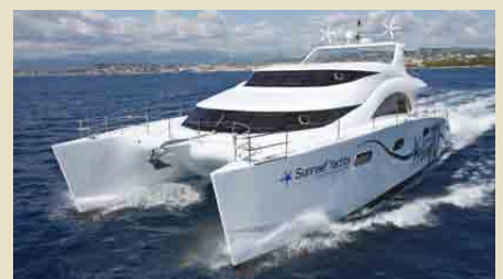
JAMBO 24.00 m 8/2 Pacific Ocean 32,000 €/week