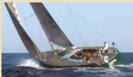
GENIE 24.00 m 6/3 West Mediterranean 30,000 €/week