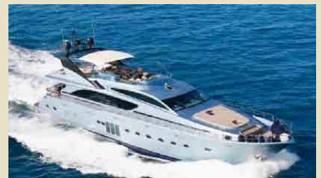
MAKARENA 30.00 m 10/5 Other destinations 48,000 €/week