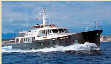
LEPANTE 33.00 m 10/4 West Mediterranean 35,000 €/week