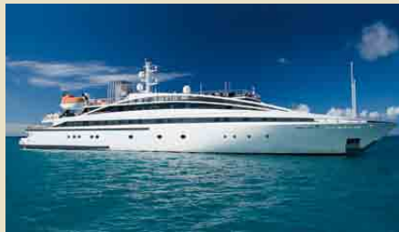
RM ELEGANT 72.48 m 30/31 Caribbean - West Mediterranean 455,000 €/week