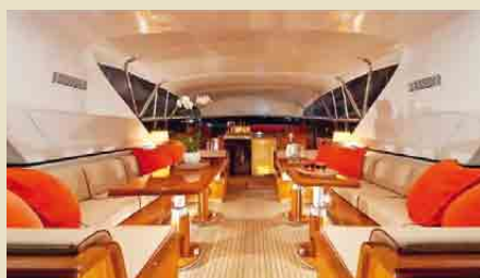
SILAOs 25.10 m 7-12/2 West Mediterranean 39,500 €/week