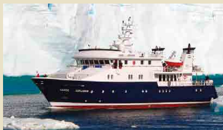
HANSE EXPLORER 47.76 m 12/14 Other destinations 100,000 €/week