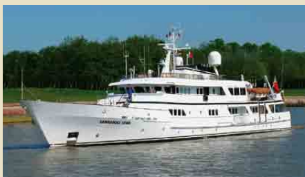
SANSSOUCI STAR 53.50 m 12/8 Mediterranean 65,000 €/week