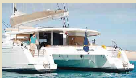
Catamaran WORLD'S END 19.67 m 10-12/3 West Mediterranean 25,000 €/week