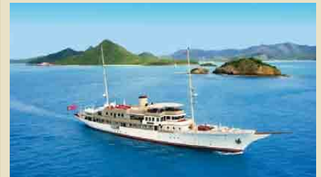
HAIDA G 71.10 m 12/16 Other dest. - West Mediterranean 189,000 €/week