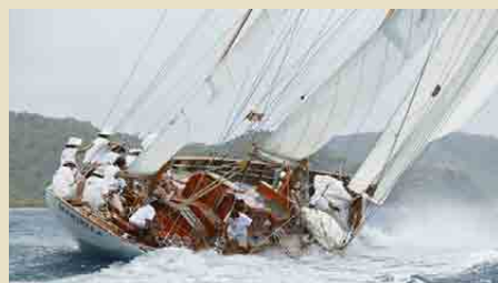
MARIELLA 24.08 m 6-12/3 Caribbean 24,000 €/week