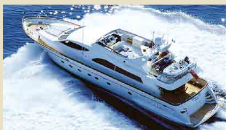
LAMPQUICK 26.00 m 9/4 West Mediterranean 35,000 €/week