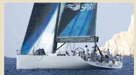
MED SPRIT (ex BOLS) 29.70 m 12-16/8 West Mediterranean 42,000 €/week