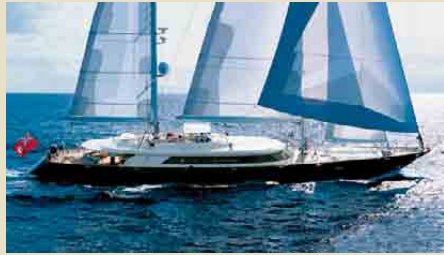
PERSEUS 49.80 m 12 Pacific Ocean 130,000 €/week