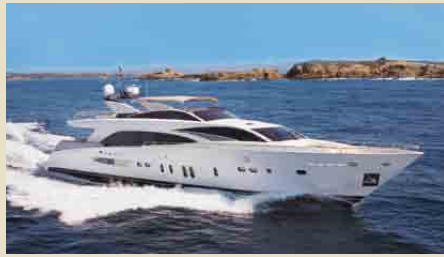
LADY EMMA 34.00m 8/4 West Mediterranean 79,000 €/week