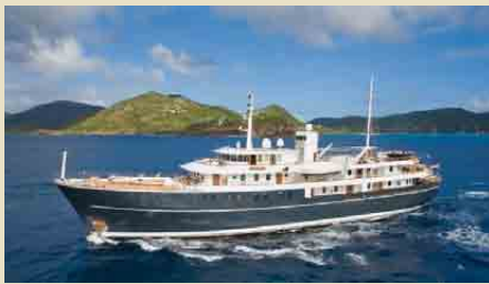
SHERAKAN 69.95 m 26-36/19 West Mediterranean - Caribbean 395,000 €/week