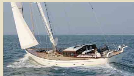
ATAO 24.90 m 6-10/3 West Mediterranean 30,000 €/week