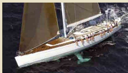
LUPA OF LONDON 23.95 m 6/3 West Mediterranean 27,000 €/week