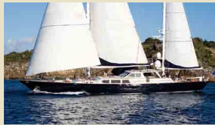
AXIA 38.00 m 8/6 Other destinations 48,000 €/week