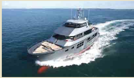
Vvs1 34.00 m 12/6 Pacific Ocean 35,000 €/week