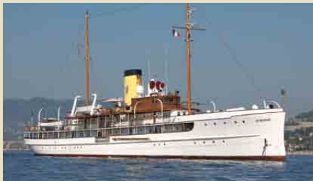
SS DELPHINE 78.65 m 26-28/24-27 East Mediterranean 350,000 €/week