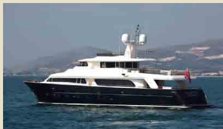
MARIA II OF LONDON 30.95 m 10/6 East Mediterranean 65,000 €/week