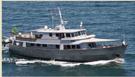
LA FENICE 33.00 m 8/5 West Mediterranean 30,000 €/week