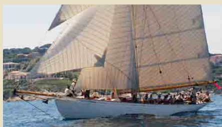
MOONBEAM III 31.00 m 6-12/2 West Mediterranean 35,000 €/week