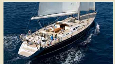
OCEAN'S SEVEN 2 (ex KALIKOBASS II) 31.70 m 8/4 West Mediterranean 50,000 €/week