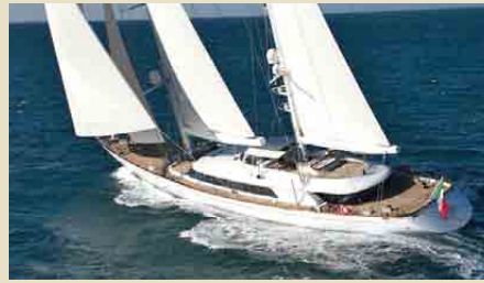
ROSEHEARTY 56.00 m 12/9 West Mediterranean-Caribbean 147,000 €/week