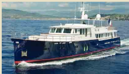
PAOLYRE 32.70 m 10 West Mediterranean 52,000 €/week