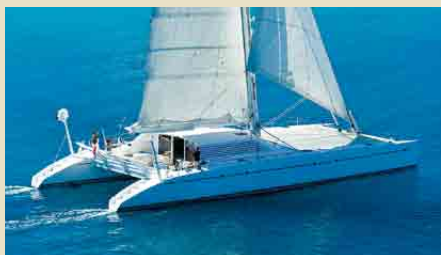
Catamaran MAGIC CAT 25.00 m 8/4 East Mediterranean 35,000 €/week