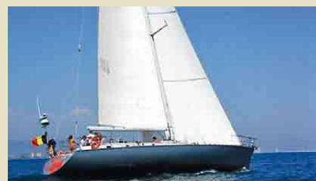
BUCANEER 23.00 m 10 West Mediterranean 12,000 €/week