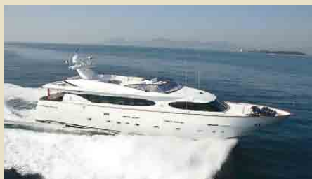
TALILA 29.00 m 8-12/4 West Mediterranean 46,000 €/week