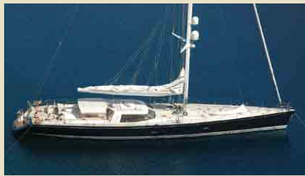
VAIMITI 39.20 m 10/5 East Mediterranean 52,500 €/week