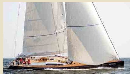
SOLLEONE 27.40 m 8/4 West Mediterranean 42,000 €/week