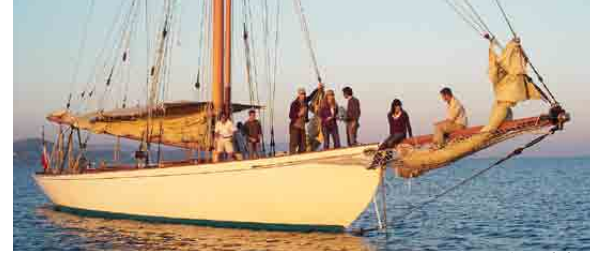
Moonbeam of Fife III