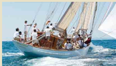
ORIANDA 26.00 m 8-12/3 West Mediterranean 21,000 €/week