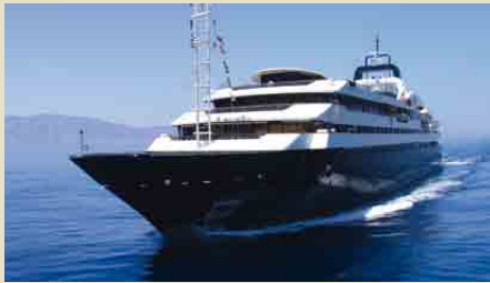
Name: TURAMA Length: 117.35 m Guest/Crew: 70/60 Area: West Mediterranean Rate: 90,000 €/day