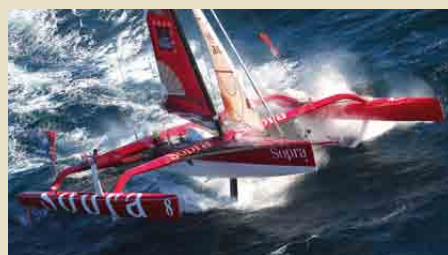
EMOTION (ex SOPRA) 21.00 m 9/3 West Mediterranean 48,000 €/week