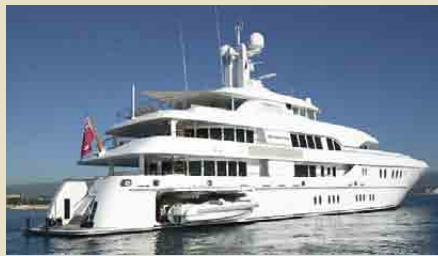
SOLEMATES 60.00 m 12/15 West Mediterranean - Caribbean 395,000 €/week