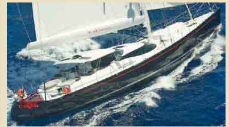
BLISS 37.00 m 10/4 Pacific Ocean 65,000 €/week