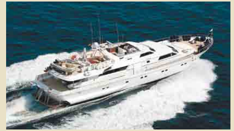
ANTISAN 33.00 m 11-40/5 West Mediterranean 63,000 €/week