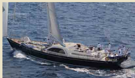
HIGHLAND BREEZE 34.34 m 8/5 West Mediterranean 52,000 €/week