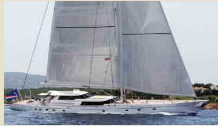
HYPERION 47.40 m 6/8 West Mediterranean 97,000 €/week