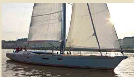
SWALLOW & AMAZONE 23.70 m 8/2 Mediterranean-Caribbean 23,000-25,000 €/week