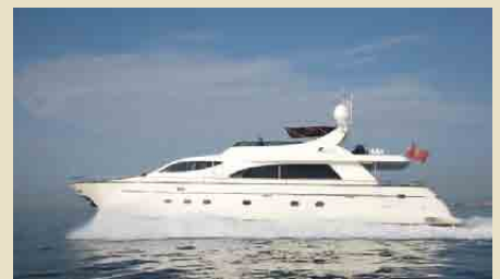
ANTALEX 26.00 m 8/4 West Mediterranean 40,000 €/week