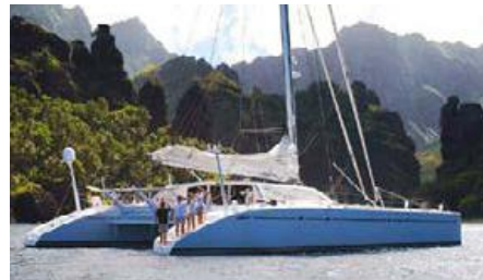
MAGIC CAT Fast Cruising Catamaran 25.00 m 1996, Refit 2020 Location: Sète, South of France P.O.A.