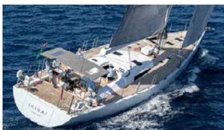
IKIGAI JFA 82 Sloop 25.13 m 2001, Refit 2018 Location: Palma, Spain EUR 2 800 000