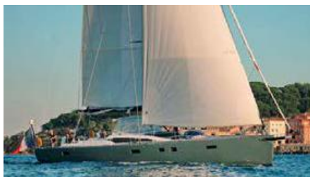
ICTHUS Futuna 70 21.75 m 2010 Location: Marseille, South of France EUR 1 215 000