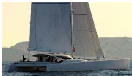
LORD DICKIE Velum 72 22.00 m 2009, Refit 2018 Location: Canet en Roussillon, South of France EUR 490 000