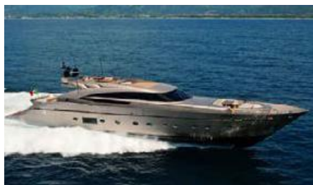
MUSA Length: 36.25 m Guest/Crew: 9/5 Area: West Mediterranean Rate: From EUR 75 000/week