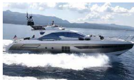
MAKANI Length: 23.60 m Guest/Crew: 9/4 Area: Greece Rate: From EUR 36 000/week