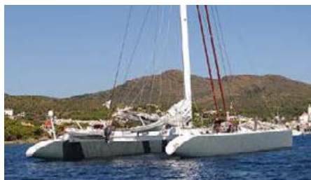
OCEAN PEARL Maxi Catamaran 33.50 m 2000 Location: Barcelona, Spain EUR 1 600 000