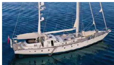
ACDA 92' Ed Dubois Ketch 28.00 m 1985 Location: Propriano, Corsica EUR 995 000