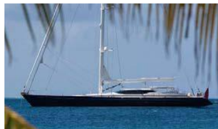
THANDEKA Length: 37.00 m Guest/Crew: 8/6 Area: Caribbean Rate: From EUR 85 000/week