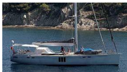
DYNASTY Hanse 630 19.80 m 2007 Loc: Port St Louis du Rhône, South of France EUR 430 000