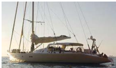
AIZU Length: 30.00 m Guest/Crew: 8/3 Area: East Mediterranean Rate: From EUR 31 000/week