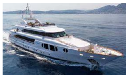
BINA Length: 43.25 m Guest/Crew: 12/9 Area: West Mediterranean Rate: From EUR 150 000/week