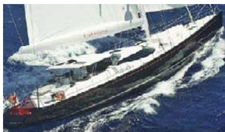
BLISS Length: 36.70 m Guest/Crew: 10/5 Area: West Mediterranean Rate: From EUR 72 500/week