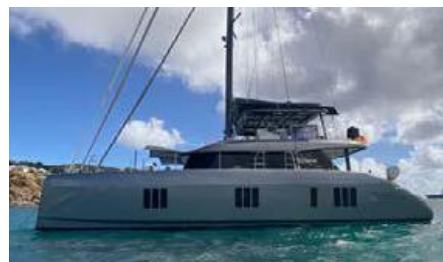
CALMA Length: 18.40 m Guest/Crew: 10/3 Area: TBC Rate: TBC