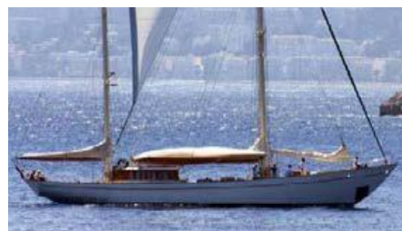
TAMORY Classic Wishbone Ketch 26.58 m 1952, Refit 1974 Location: Italy, Ventimiglia EUR 790 000