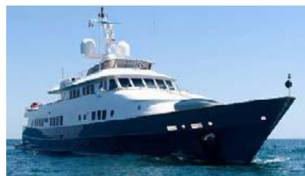
BERZINC Camper & Nicholson's Design 44.68 m 1977, Refit 2012 Location: West Mediterranean EUR 3 600 000