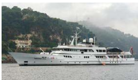
SANSSOUCI STAR Steel/Aluminium Large Motor Yacht 53.53 m 1982 Location: Copenhagen, Denmark EUR 2 250 000