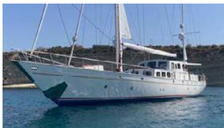
PROVENANCE Cold Moulded Ketch 29.65 m 1968, Refit 2019 Location: Palma EUR 1 000 000