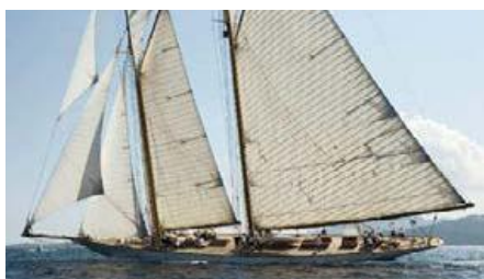
ELEONORA Classic Gaff Schooner 49.50 m 2000, Refit 2020 Location: Tarragona, Spain EUR 6 900 000