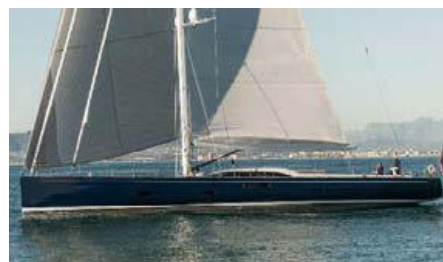
FARFALLA Length: 31.78 m Guest/Crew: 8/5 Area: Bergen, Norway Rate: From EUR 70 000/week