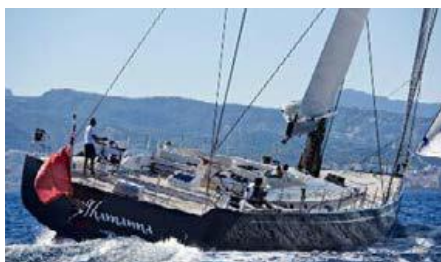
SHAMANNA Length: 35.20 m Guest/Crew: 8/6 Area: West Mediterranean Rate: From EUR 105 000/week