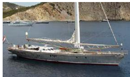
DWINGER Length: 48.50 m Guest/Crew: 11/7 Area: Northern Europe Rate: From EUR 70 000/week