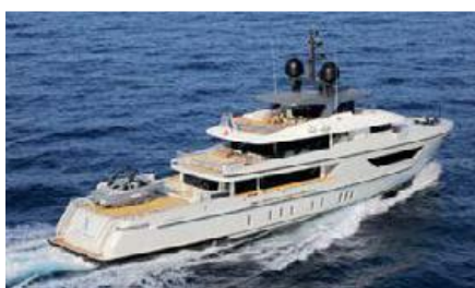
X Length: 42.78 m Guest/Crew: 12/8 Area: West Mediterranean Rate: From EUR 175 000/week