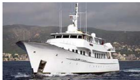
KRISS Abeking & Rasmussen Built 45.00 m 1974, Refit 2017 Location: Malta P.O.A.