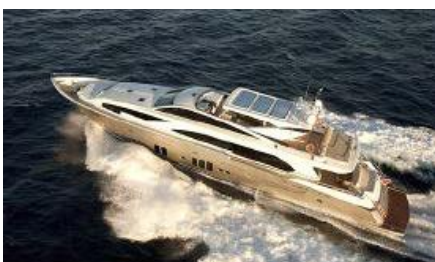
ASCENSION Length: 37.00 m Guest/Crew: 10/5 Area: West Mediterranean Rate: From EUR 100 000/week