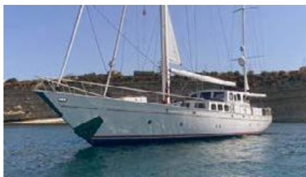
PROVENANCE Cold Moulded Ketch 29.65 m 1968, Refit 2019 Location: Palma EUR 1000 000