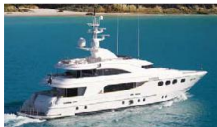
DE LISLE III Length: 42.00 m Guest/Crew: 9/7 Area: Australia - New Zealand Rate: From AUD 165 000/week