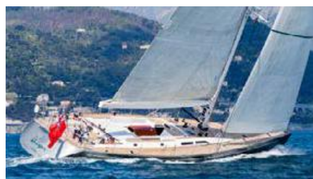
ELISE WHISPER SW 78 23.99 m 2001 Location: Italy EUR 1 550 000