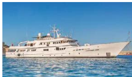
SANSSOUCI STAR Length: 53.50 m Guest/Crew: 12/8 Area: Northern Europe Rate: From EUR 100 000/week