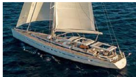
SAVARONA Aluminium Lifting Keel Sloop 28.60 m 2001, Refit 2021 Location: St Marteen Caribbean EUR 2 500 000