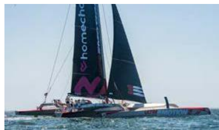
ULTIM EMOTION 2 Length: 24.38 m Guest/Crew: 8/3 Area: West Mediterranean Rate: From EUR 42 000/week