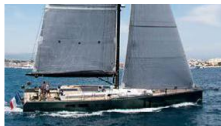
SHAMLOR Nacira 67 20.42 m 2012 Location: Olbia Sardinia Italy EUR 1 500 000