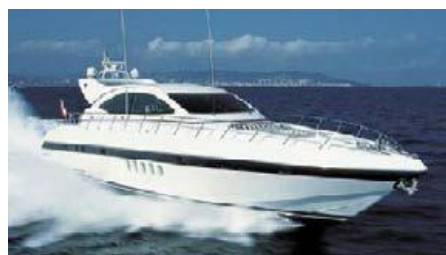
HALKIN Mangusta 72 21.56 m 1999 Location: Alassio, Italy EUR 430 000