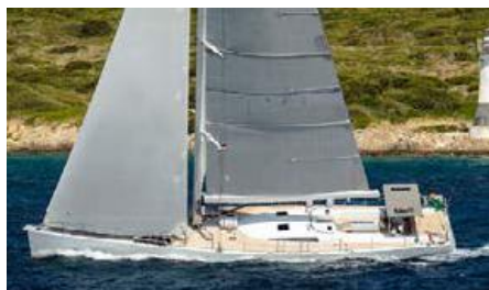
IKIGAI Length: 25.13 m Guest/Crew: 8/2 Area: West Mediterranean Rate: From EUR 28 000/week