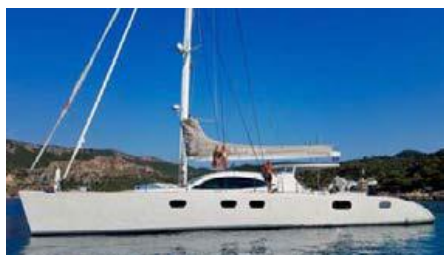
LAYSAN Prout 72 22.00 m 2017 Location: Caribbean EUR 1 990 000