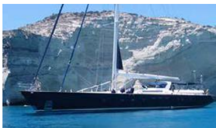
AMADEUS Length: 33.50 m Guest/Crew: 12/6 Area: Greece Rate: From EUR 35 000/week