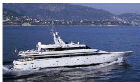
COSTA MAGNA Length: 44.50 m Guest/Crew: 10/8 Area: West Mediterranean Rate: From EUR 90 000/week