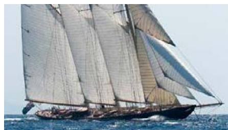
ATLANTIC New Classic Schooner Replica 64.50 m 2010 Location: Italy P.O.A.