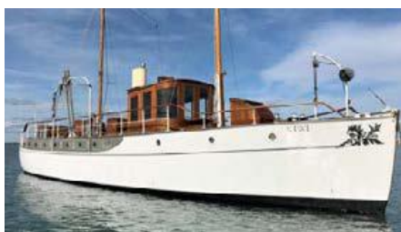
KIWI Motor Gentleman's Yacht 18.30 m 1914 Location: France, Sète EUR 135 000