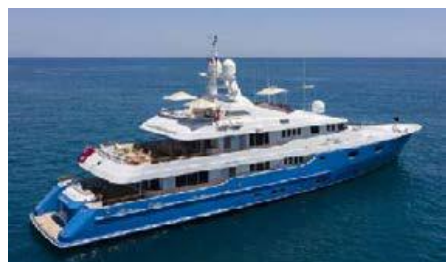
MOSAÏQUE Length: 49.90 m Guest/Crew: 12/12 Area: West Mediterranean Rate: From EUR 160 000/week