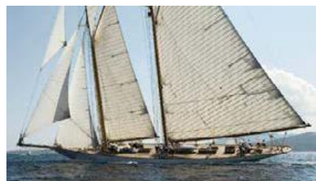
ELEONORA Classic Gaff Schooner 49.50 m 2000, Refit 2020 Location: Tarragona, Spain EUR 6 900 000