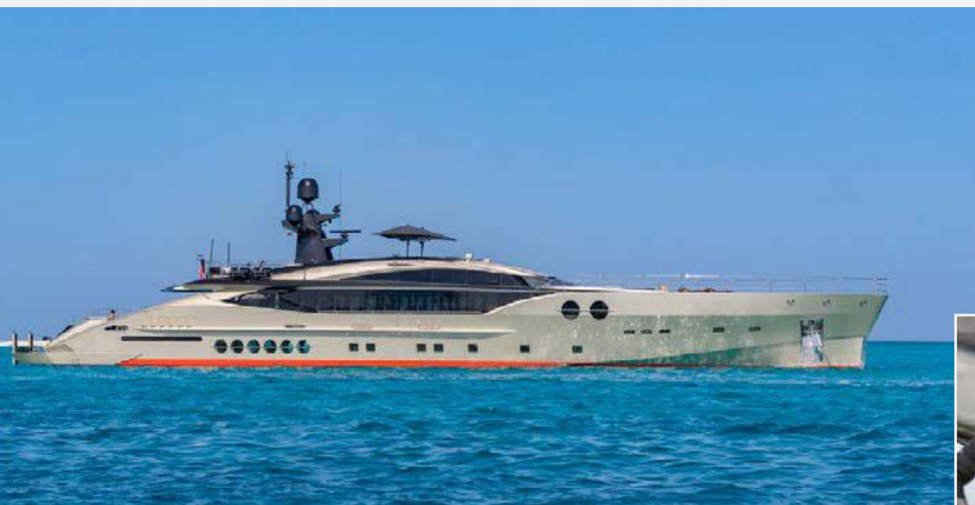
Charter DB9 Superyacht in Western Mediterranean