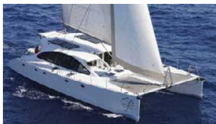
FRIENDS FOREVER DH 550 16.75 m 2016 Location: Portimao, Portugal EUR 665 000