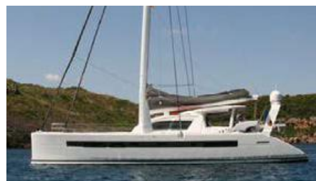
TRAMONTANE Catana 65 19.70 m 2008, Refit 2021 Location: Gruissan, South of France EUR 1 350 000