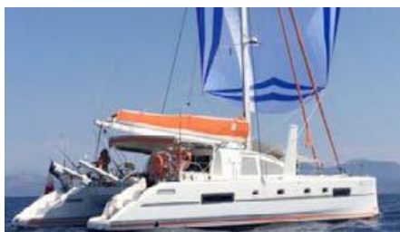
KALI Catana 50 15.23 m 2007 Location: France, Marseille EUR 595 000