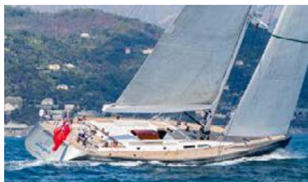
ELISE WHISPER Length: 23.99 m Guest/Crew: 8/3 Area: West Mediterranean Rate: From EUR 28 000/week