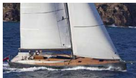
AEGIR Carbon Ocean 82 25.00 m 2011 Location: Palma, Spain EUR 2 900 000