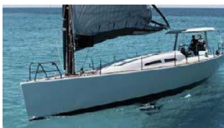
WATER MAIDEN Cat-Rigged Sailing Yacht 13.90 m 2008 Location: St Carlos de la Rapita Spain EUR 145 000