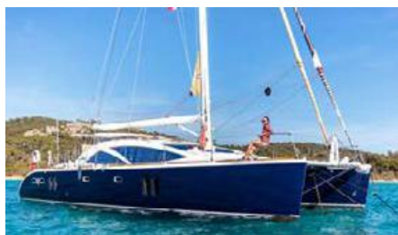
CURANTA CRIDHE Length: 15.35 m Guest/Crew: 6/2 Area: West Mediterranean Rate: From EUR 17 000/week