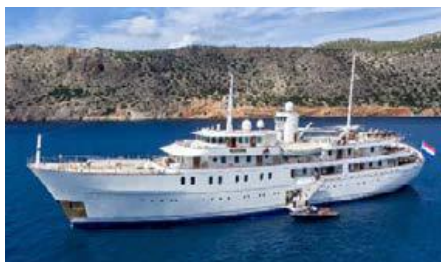
SHERAKHAN Length: 69.60 m Guest/Crew: 26/19 Area: West Mediterranean Rate: From EUR 485 000/week