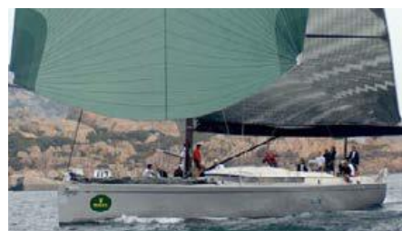
SILANDRA V Swan 76 23.20 m 2007, Refit 2021/2022 Location: Imperia Italy EUR 3 500 000