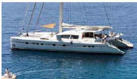
ORION Catana 90 26.52 m 2008, Refit 2020 Location: Caribbean, Curaçao EUR 2 060 000