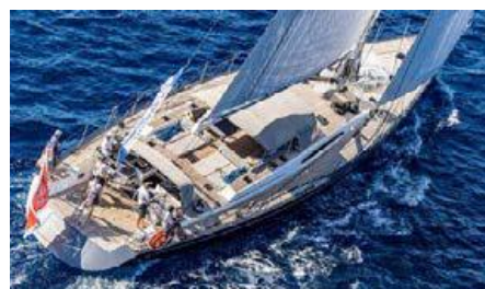
FREEBIRD Length: 30.20 m Guest/Crew: 8/4 Area: West Mediterranean Rate: From EUR 48 000/week