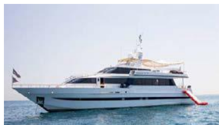
HEARTBEAT OF LIFE Heesen Yachts 28.20 m 1989, Refit 2008 Location: Barcelona, Spain EUR 1 100 000