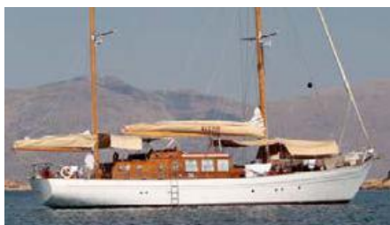
AITOR Laurent Gilles Ketch 21.75 m 1964, Refit 2017 Location: Sète, France EUR 460 000