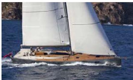
AEGIR Length: 25.10 m Guest/Crew: 6/3 Area: West Mediterranean Rate: From EUR 29 400/week