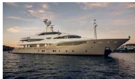
LIGHT HOLIC Length: 60.00 m Guest/Crew: 12/15 Area: West Mediterranean Rate: From EUR 320 000/week