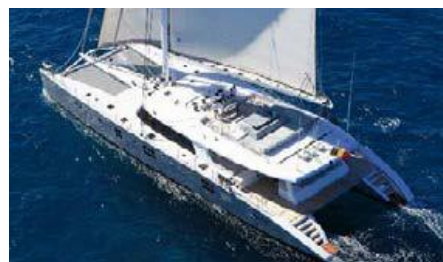
CHE Length: 34.70 m Guest/Crew: 8/6 Area: West Mediterranean Rate: From EUR 75 000/week