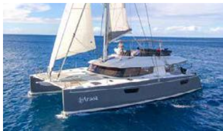
ARAK Length: 17.80 m Guest/Crew: 6/2 Area: West Mediterranean Rate: From EUR 24 000/week