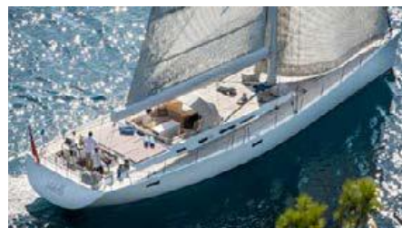
VIDELLE Felci 71 Performance 21.60 m 2006 Location: Italy, Cala Galera EUR 950 000