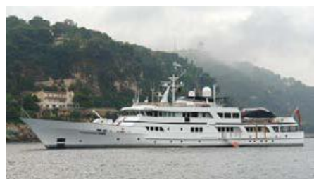
SANSSOUCI STAR Steel/Aluminium Large Motor Yacht 53.53 m 1982 Location: Flensburg, Germany EUR 2 250 000