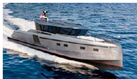
BIC ALUMINIUM 48C C48 14.66 m 2021 Location: Latvia, Riga EUR 1 196 700