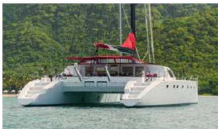
TAJ Length: 24.00 m Guest/Crew: 6/3 Area: Caribbean Rate: From EUR 27 000/week