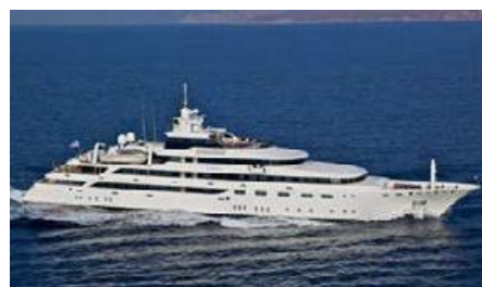
TITANIA Length: 73.00 m Guest/Crew: 12/19 Area: West Mediterranean Rate: From EUR 565 000/week