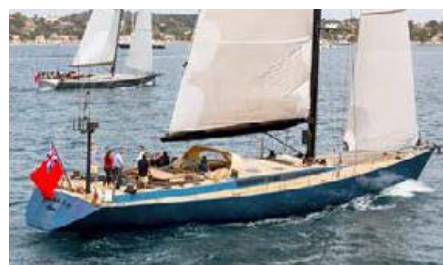
WALLY ONE Length: 25.30 m Guest/Crew: 6/4 Area: West Mediterranean Rate: From EUR 28 000/week