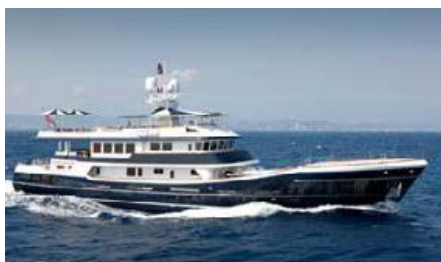
THE MERCY BOYS Length: 48.60 m Guest/Crew: 12/11 Area: East/West Mediterranean Rate: From EUR 90 000/week