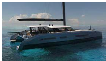
ICECAT sixtyfour Cruising catamaran 19.50 m 2022 Location: Italy P.O.A.