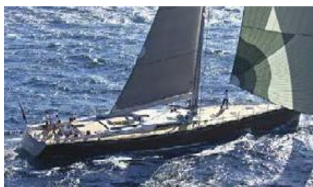
ARAGON Length: 28.64 m Guest/Crew: 8/4 Area: West Mediterranean Rate: From EUR 44 000/week