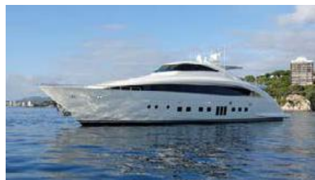
IL GATTOPARDO Amer 116 S 36.00 m 2012 Location: Barcelona, Spain EUR 4 900 000