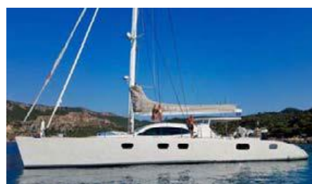
LAYSAN Length: 22.00 m Guest/Crew: 8/3 Area: US Virgin Islands Rate: From USD 39 000/week