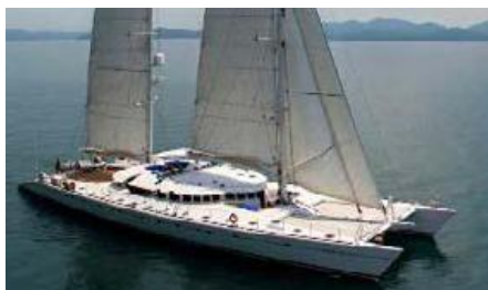
DOUCE FRANCE Length: 42.20 m Guest/Crew: 12/7 Area: West Mediterranean Rate: From EUR 106 000/week