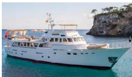
ODYSSEY III Length: 33.00 m Guest/Crew: 8/6 Area: West Mediterranean Rate: From EUR 54 000/week