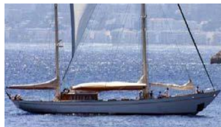
TAMORY Classic Wishbone Ketch 26.58 m 1952, Refit 1974 Location: Italy, Ventimiglia EUR 790 000