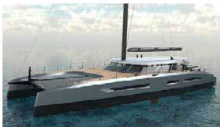
ICECAT seventytwo Cruising catamaran 22.00 m 2022 Location: Italy P.O.A.