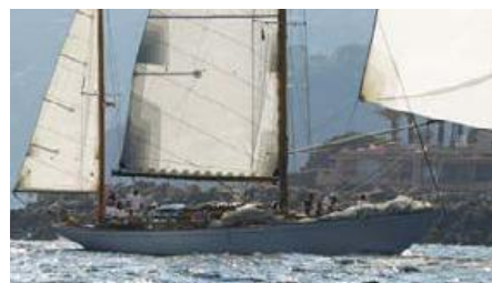
GIANNELLA II Yawl Marconi Sangermani 64 19.64 m 1966 Location: Palma, Spain EUR 495 000