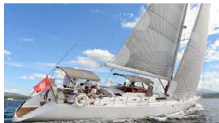
BELLA UNO Fast Cruising Sloop 21.88 m 1998 Location: Thailand, Phuket US$ 650 000