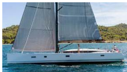
WINK CNB 76 - Hull n°2 23.17 m 2014 Location: France, Sète EUR 1 850 000