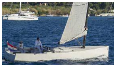
FRESET Setton 32 Custom 9.76 m 2012 Location: France, Antibes EUR 129 000