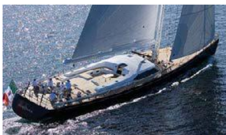
FARANDWIDE Length: 30.20 m Guest/Crew: 8/4 Area: East/West Mediterranean Rate: From EUR 46 000/week