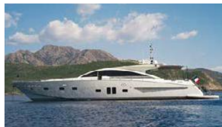
NOE Guy Couach 2800 Open 28.60 m 2013 Location: France, Saint Mandrier EUR 3 900 000