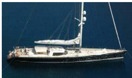
VAIMITI Length: 39.20 m Guest/Crew: 10/5 Area: West Mediterranean Rate: From EUR 41 140/week