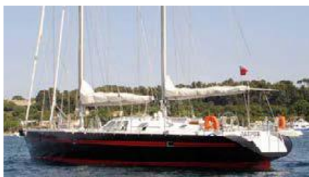
JAIPUR Centreboard Ketch 21.00 m 1991 Location: France, Cannes EUR 550 000