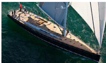
THALIMA Length: 33.70 m Guest/Crew: 8/5 Area: West Mediterranean Rate: From EUR 58 000/week