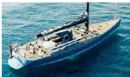
KALLIMA Length: 24.89 m Guest/Crew: 8/3 Area: West Mediterranean Rate: From EUR 30 000/week