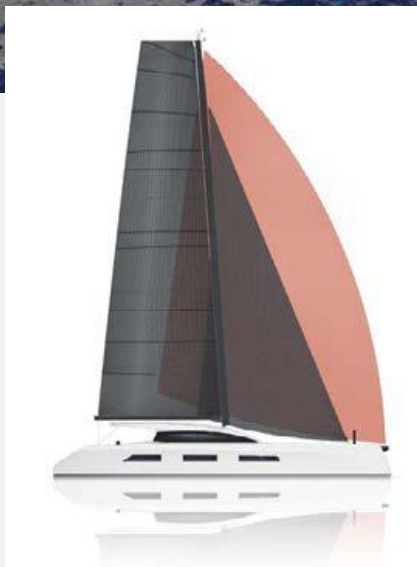
Rendering Linea Concept

The hulls and superstructure are ready to be put together, waiting for you to take the GP 70 over and to adapt her to your own wishes.