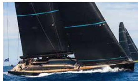
AESOP Length: 23.99 m Guest/Crew: 4/2 Area: West Mediterranean Rate: From EUR 30 000/week