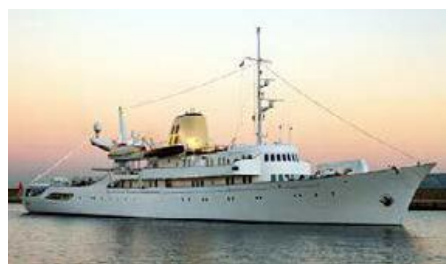
CHRISTINA O Length: 99.13 m Guest/Crew: 34/38 Area: West Mediterranean Rate: From EUR 620 000/week