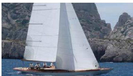
JOUR DE FETE Q Class Classic Bermudian Sloop 15.80 m 1930 Refit 2007 & 2017 Location: Marseille EUR 390 000