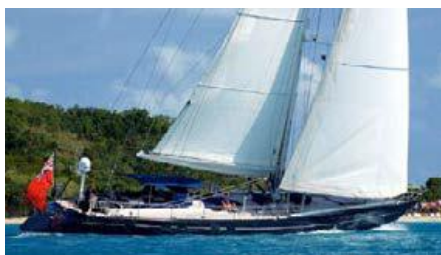
DARK STAR OF LONDON 90' Aluminium centreboard sloop 27.50 m 1982, Refit 2016 Location: France, Near Marseille EUR 705 000