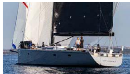
ARAGON Reichel Pugh 72 22.00 m 2006 Location: Palma, Spain EUR 992 000