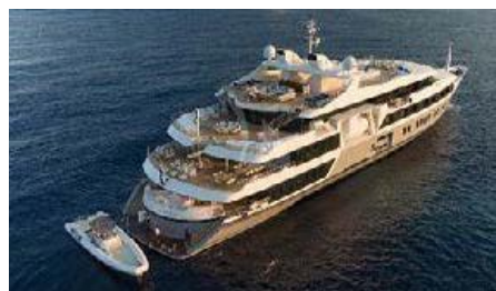
SERENITY Length: 72.00 m Guest/Crew: 28/30 Area: West Mediterranean Rate: From EUR 550 000/week