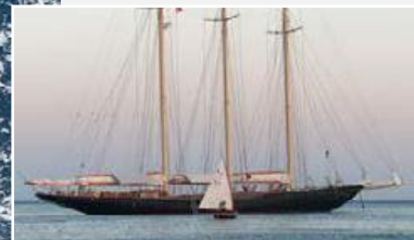
Atlantic, page 11