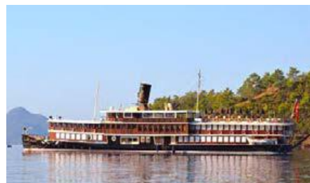
HALAS Length: 52.00 m Guest/Crew: 24/16 Area: Turkey Rate: From EUR 140 000/week