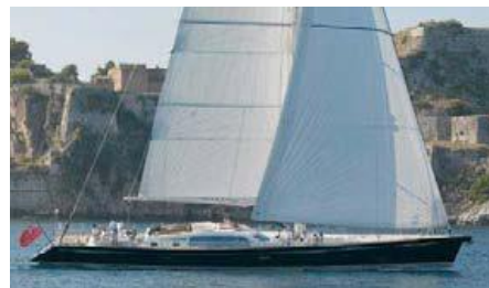
GRAND BLEU VINTAGE Length: 29.00 m Guest/Crew: 8/4 Area: West Mediterranean Rate: From EUR 39 000/week