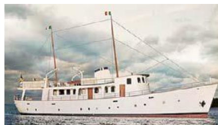
THEMARA Long Range Gentleman Motor Yacht 24.60 m 1962, Refit 2022 Location: Marseille, France EUR 950 000