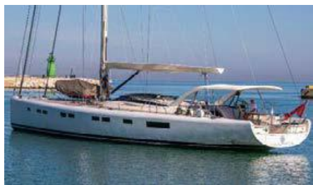
NAKUPENDA Length: 24.00 m Guest/Crew: 8/3 Area: West Mediterranean Rate: From EUR 28 000/week