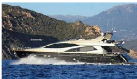
4 FIVE Riva Opera 85 26.02 m 2005 Location: Spain, Roses EUR 1 290 000