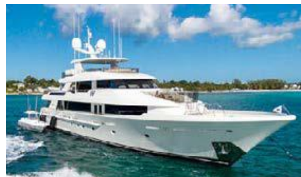
PIPE DREAM Length: 39.62 m Guest/Crew: 12/7 Area: Caribbean Rate: From EUR 129 000/week