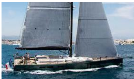
SHAMLOK Length: 20.42 m Guest/Crew: 6/2 Area: West Mediterranean Rate: From EUR 15 000/week