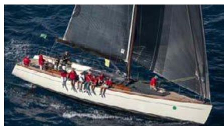
TOFINOU Tofinou 16 15.90 m 2022 Location: Port Camargue, South of France P.O.A.