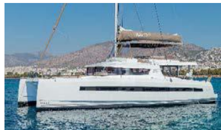
LICENSE TO CHILL Length: 16.80 m Guest/Crew: 10/2 Area: Greece Rate: From EUR 14 100/week