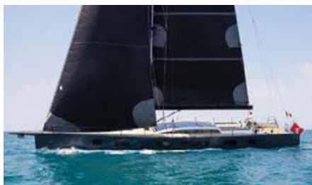
LUCE GUIDA Length: 23.60 m Guest/Crew: 6/2 Area: West Mediterranean Rate: From EUR 25 000/week