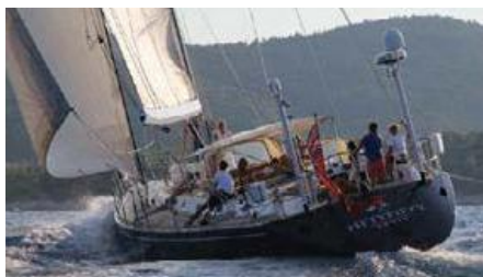
FIFTY FIFTY CNB 76 23.16 m 1991, Refit 2021 Location: Palma, Spain EUR 690 000