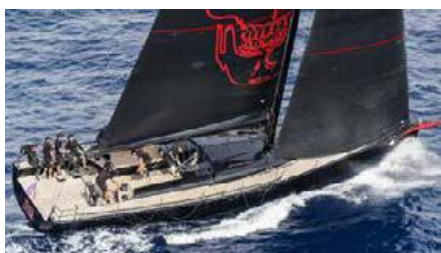
BLACK LEGEND S Mylius Cruiser-racer 18.23 m 2013 Location: Monaco EUR 1 200 000