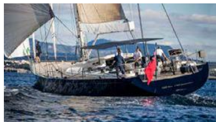
BLUE DIAMOND Bermudian Sloop 30.00 m 2004, Refit 2021 Location: Palma, Spain EUR 1 800 000