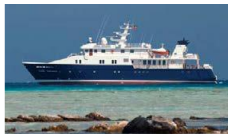
HANSE EXPLORER Length: 47.76 m Guest/Crew: 12/14 Area: Pacific Ocean Rate: From EUR 175 000/week