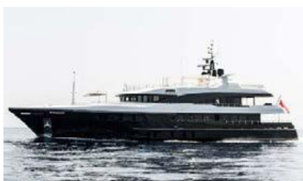
AMADEUS Length: 44.05 m Guest/Crew: 10/9 Area: West Mediterranean Rate: From EUR 106 500/week