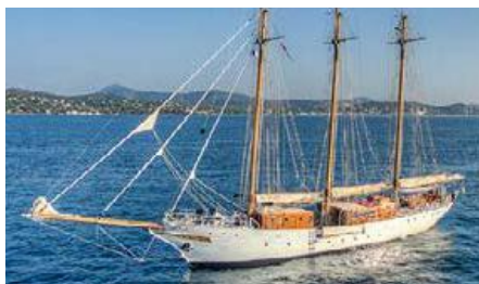
TRINAKRIA Length: 49.06 m Guest/Crew: 10/8 Area: West Mediterranean Rate: From EUR 65 000/week