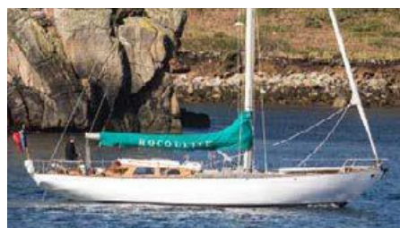
ROCQUETTE Camper and Nicholson racing sloop 12.88 m 1964, Refit 2019 Location: France, Brittany EUR 115 000