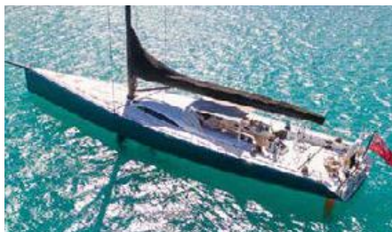
LEOPARD 3 Length: 30.00 m Guest/Crew: 8/6 Area: West Mediterranean Rate: From EUR 49 500/week