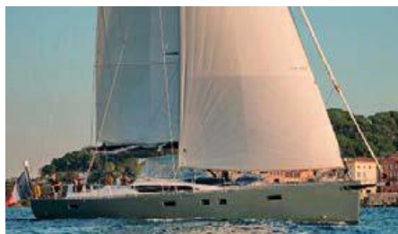
ICTHUS Length: 21.75 m Guest/Crew: 6/2 Area: West Mediterranean Rate: From EUR 15 000/week