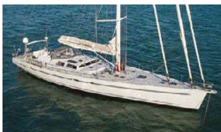
FANI Length: 26.33 m Guest/Crew: 12/2 Area: West Mediterranean Rate: From EUR 22 000/week