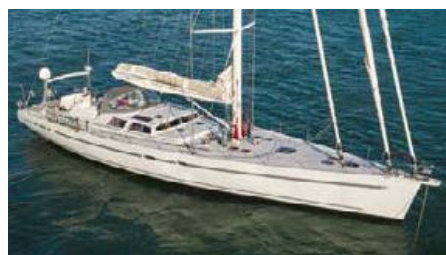
FANI Garcia 85 26.33 m 2005, Refit 2020 Location: France, Saint-Malo EUR 1 195 000