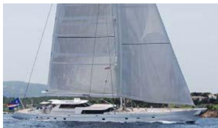
HYPERION Length: 47.42 m Guest/Crew: 6/8 Area: West Mediterranean Rate: From EUR 91 000/week