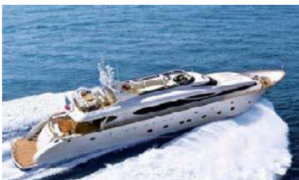
PARIS A Length: 35.05 m Guest/Crew: 12/6 Area: Greece Rate: From EUR 63 000/week