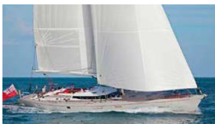
SWALLOWS AND AMAZONS Custom CNB 77 23.70 m 2009, Refit 2020 Location: Caribbean, Antigua EUR 1 190 000