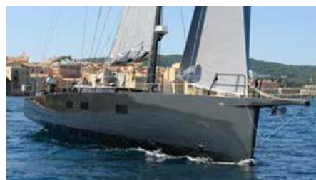
BLACK LEGEND 4 Black Pepper Code 2.1 17.40 m 2019 (New - Sold by her Shipyard) Location: Port Grimaud, South of France EUR 1 695 000