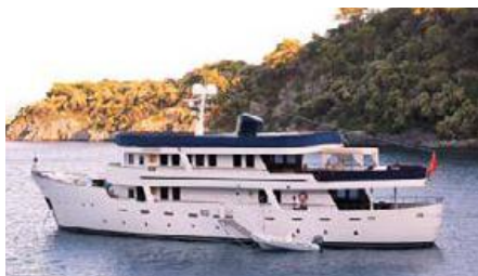
DONA DEL MARE New Classic 34.10 m 2006 Location: Croatia EUR 3 990 000