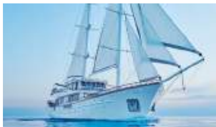
CORSARIO Length: 48.00 m Guest/Crew: 12/9 Area: East Mediterranean Rate: From EUR 85 000/week