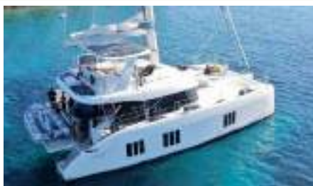
TIRIL Length: 15.20 m Guest/Crew: 10/2 Area: French Polynesia/South Pacific Ocean Rate: From EUR 25 200/week