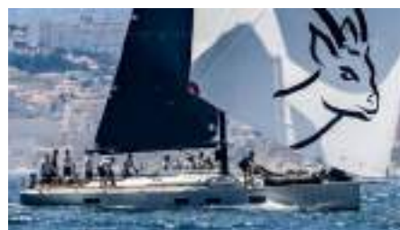
DAGUET² Mylius 50 15.60 m 2016 Location: Marseille, France EUR 795 000