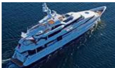
LIFE SAGA Length: 42.10 m Guest/Crew: 12/7 Area: West Mediterranean Rate: From EUR 100 000/week