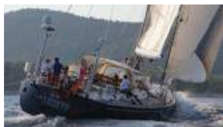
FIFTY FIFTY CNB 76 23.16 m 1991, Refit 2021 Location: Imperia, Italy EUR 610 000