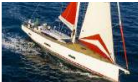
PURA FOLLIA Length: 21.00 m Guest/Crew: 6/2 Area: West Mediterranean Rate: From EUR 16 000/week