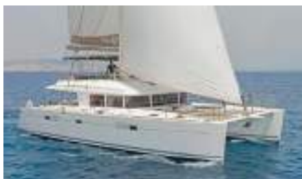
MELITI Length: 17.07 m Guest/Crew: 10/3 Area: East Mediterranean Rate: From EUR 16 730/week