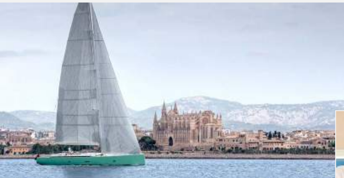
Opening of our new office in Palma