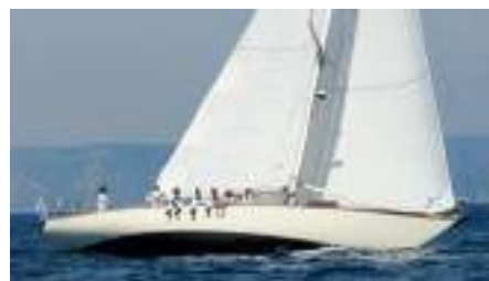
DUNE Sangermani 55't 16.70 m 1962 Location: Port Saint Louis du Rhône, France EUR 135 000