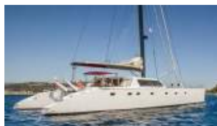
TAJ VPLP 77 24.00 m 2003, Refit 2019 Location: St Tropez, France EUR 1990 000