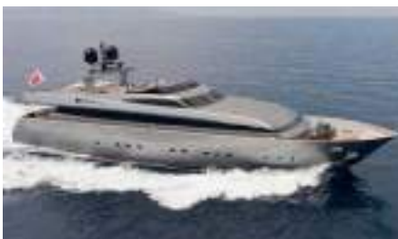
IROCK Length: 34.00 m Guest/Crew: 11/6 Area: West Mediterranean Rate: From EUR 84 000/week