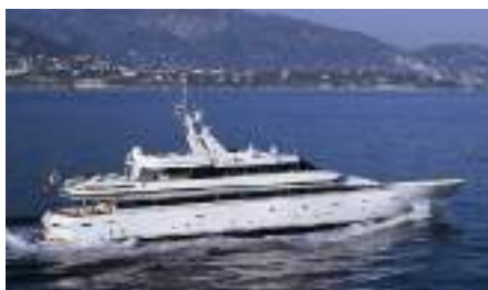
COSTA MAGNA Length: 44.50 m Guest/Crew: 10/8 Area: West Mediterranean Rate: From EUR 90 000/week