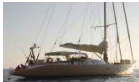
AIZU Length: 30.16 m Guest/Crew: 8/4 Area: East Mediterranean Rate: From EUR 29 000/week