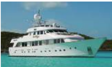
SWEET ESCAPE Length: 39.62 m Guest/Crew: 12/7 Area: Florida, Bahamas Rate: From USD 115 000/week