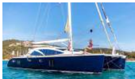
CURANTA CRIDHE Length: 15.35 m Guest/Crew: 6/2 Area: West Mediterranean Rate: From EUR 18 000/week