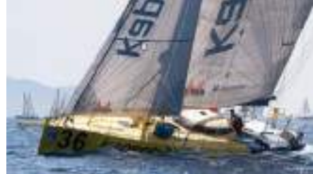
AUSTRIA ONE Ex Imoca 60 18.28 m 1995, Refit 2012 Location: Split, Croatia EUR 145 000