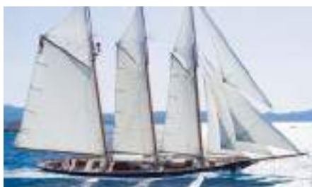
SHENANDOAH OF SHARK Length: 54.40 m Guest/Crew: 11/12 Area: East/West Mediterranean Rate: From EUR 125 000/week