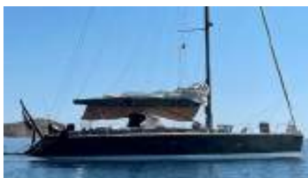
KALAO Maxi Dolphin 65 - 2 20.00 m 2003, Refit 2022 Location: Antibes, France EUR 780 000