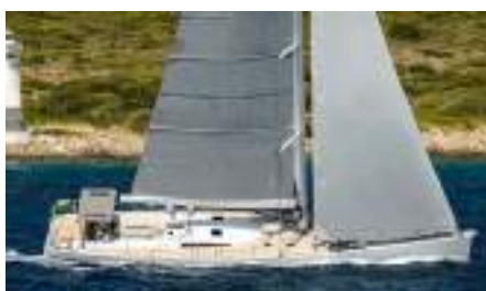
IKIGAI Length: 25.13 m Guest/Crew: 8/2 Area: West Mediterranean Rate: From EUR 28 000/week