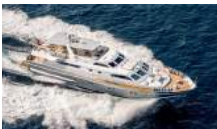
ANTISAN Length: 33.00 m Guest/Crew: 12/6 Area: West Mediterranean Rate: From EUR 56 000/week