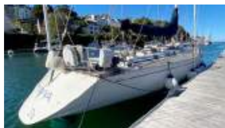
TAYYA Sloop 54' 16.55 m 1990, Refit 2022 Location: Tenerife, Canary Islands EUR 195 000