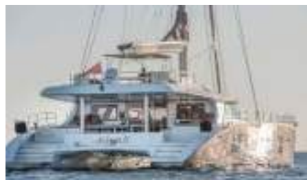
SEAZEN II Length: 21.40 m Guest/Crew: 8/3 Area: Corsica/East Mediterranean Rate: From EUR 30 000/week