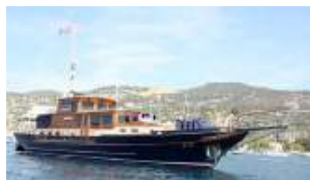
DOLCE VITA Classic 20 20.00 m 2004, Refit 2022 Location: Genoa, Italy EUR 600 000