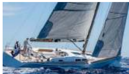
ALBATOR TOO Swan 60-906 Flush Deck Version 18.86 m 2012, Refit 2021 Location: Port Grimaud, France EUR 1 680 000