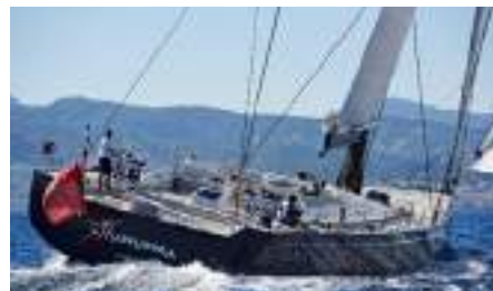
SHAMANNA Length: 35.20 m Guest/Crew: 6/6 Area: East Mediterranean Rate: From EUR 105 000/week