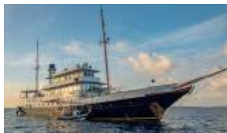
KALIZMA Length: 45.75 m Guest/Crew: 10/10 Area: East/West Mediterranean Rate: From EUR 120 000/week