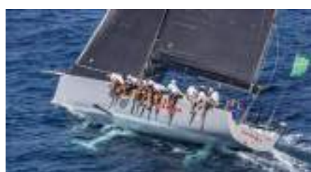
WILD JOE 60' Canting Keel Mini Maxi 18.57 m 2002, Refit 2018/2020 Location: Primosten, Croatia EUR 390 000