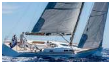
ALBATOR TOO Swan 60-906 Flush Deck Version 18.86 m 2012, Refit 2021 Location: Port Grimaud, France EUR 1680 000