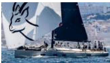
DAGUET 2 Mylius 50 15.60 m 2016 Location: Marseille, France EUR 795 000