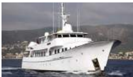
KRISS Abeking & Rasmussen Built 45.00 m 1974, Refit 2017 Location: Malta P.O.A.