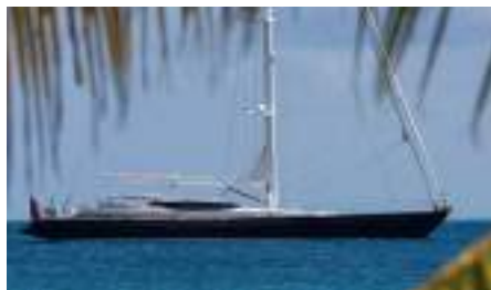
THANDEKA Length: 37.00 m Guest/Crew: 8/6 Area: Pacific Ocean Rate: From EUR 85 000/week