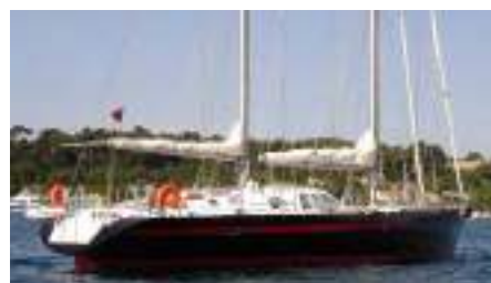
JAIPUR Centreboard Ketch 21.00 m 1991 Location: Cannes, France EUR 550 000