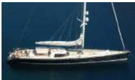
VAIMITI Length: 39.20 m Guest/Crew: 10/5 Area: East Mediterranean Rate: From EUR 60 000/week