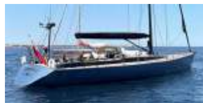
Wally 83 WALLY ONE