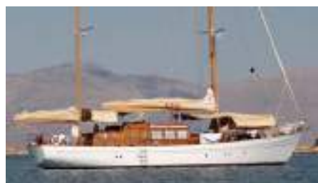
AITOR Laurent Gilles Ketch 21.75 m 1964, Refit 2017 Location: Sète, France EUR 460 000