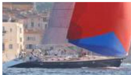
VAINATO CNB 64 19.51 m 2001, Refit 2011 Location: Cap d'Agde, South of France EUR 390 000