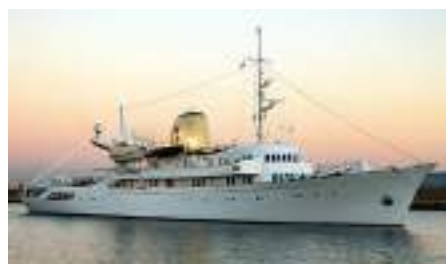
CHRISTINA O Length: 99.13 m Guest/Crew: 34/38 Area: East/West Mediterranean Rate: From EUR 700 000/week