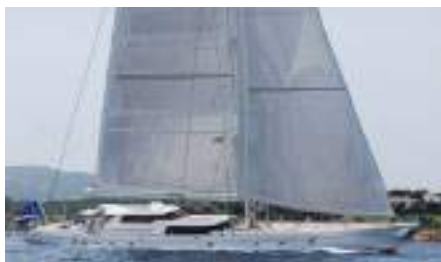
HYPERION Length: 47.42 m Guest/Crew: 6/8 Area: West Mediterranean Rate: From EUR 91 000/week