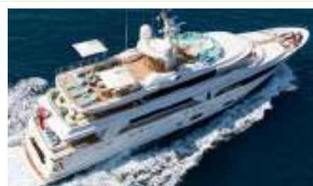
HANA Length: 42.60 m Guest/Crew: 11/9 Area: West Mediterranean Rate: From EUR 150 000/week