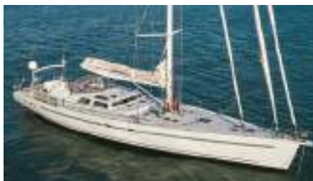
FANI Garcia 85 26.33 m 2005, Refit 2020 Location: Saint-Malo, France EUR 995 000