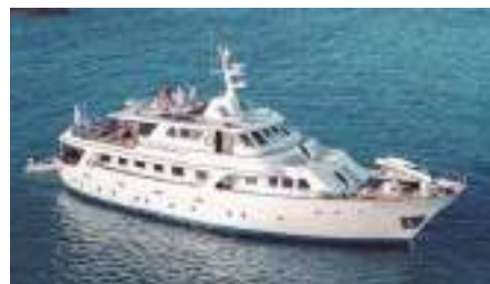
DAYLAMI Canoe Stern Classic Gentleman's Yacht 28.01 m 1972, Refit 2000 Location: Corfu, Greece EUR 795 000