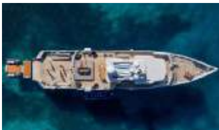
PREFERENCE 19 Length: 36.40 m Guest/Crew: 10/7 Area: West Mediterranean Rate: From EUR 105 000/week