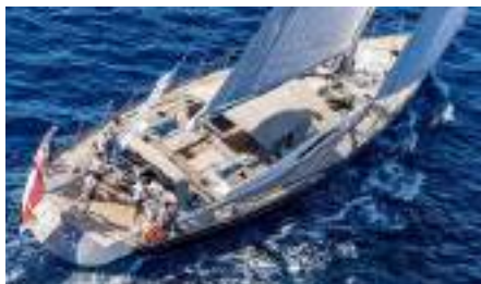
FREEBIRD Length: 30.20 m Guest/Crew: 8/4 Area: West Mediterranean Rate: From EUR 48 000/week