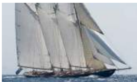
ATLANTIC Length: 64.40 m Guest/Crew: 12/11 Area: West Mediterranean Rate: From EUR 110 000/week