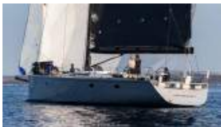
ARAGON Reichel Pugh 72 22.00 m 2006 Location: Palma, Spain EUR 992 000