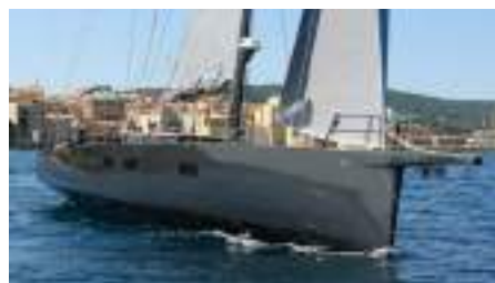
BLACK LEGEND 4 Black Pepper Code 2.1 17.40 m 2019 (New - Sold by her Shipyard) Location: Port Grimaud, France EUR 1 695 000