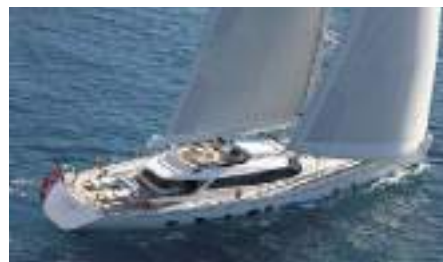
TWILIGHT Length: 38.10 m Guest/Crew: 8/6 Area: East Mediterranean Rate: From EUR 100 000/week