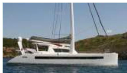
TRAMONTANE Catana 65 19.70 m 2008, Refit 2021 Location: Gruissan, France EUR 990 000