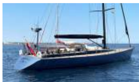
WALLY ONE Length: 25.15 m Guest/Crew: 6/4 Area: West Mediterranean Rate: From EUR 28 000/week