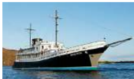
EVOLUTION Length: 58.50 m Guest/Crew: 32/20 Area: Galapagos Islands Rate: From USD 242 250/week