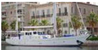
97ft Ketch TELSTAR VI