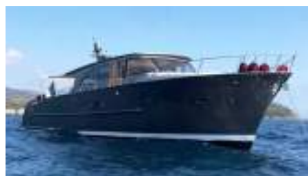
OLYMPIC MARITIME Lobster 65 19.95 m 2013 Location: Marseille, France EUR 620 000