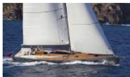
AEGIR Length: 25.10 m Guest/Crew: 6/3 Area: West Mediterranean Rate: From EUR 29 400/week