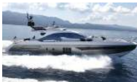
MAKANI Length: 23.60 m Guest/Crew: 9/4 Area: East Mediterranean Rate: From EUR 36 000/week