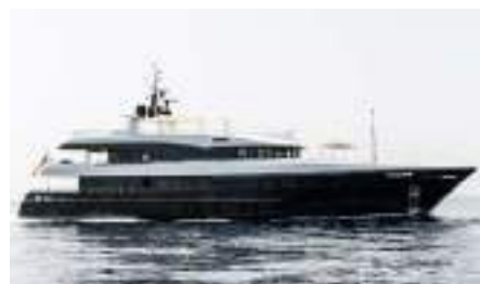
AMADEUS I Length: 44.05 m Guest/Crew: 10/9 Area: East/West Mediterranean Rate: From EUR 140 000/week