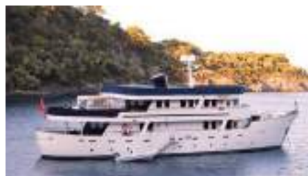
DONNA DEL MARE New Classic 34.10 m 2006 Location: Croatia EUR 3 990 000