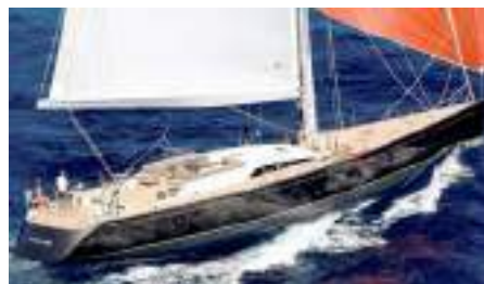
YCH2 Length: 27.71 m Guest/Crew: 6/3 Area: South of France/East Med Rate: From EUR 45 000/week