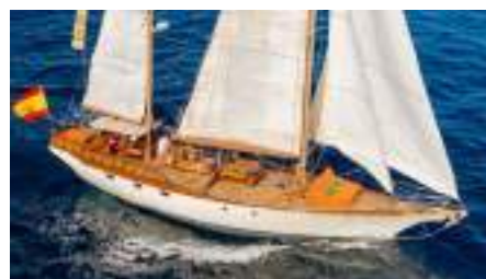
FREE BIRD Valero 20.00 m 1987 Location: Tenerife, Canary Islands EUR 475 000