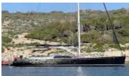
FREE AT LAST Length: 28.80 m Guest/Crew: 8/4 Area: West Mediterranean Rate: From EUR 29 000/week