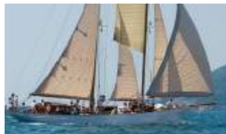
ORIANDA Length: 26.00 m Guest/Crew: 8/3 Area: West Mediterranean Rate: From EUR 28 500/week