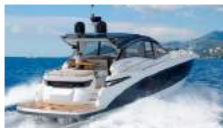
GLADIATOR Galeon 445 HTS 14.98 m 2017 Location: Hyères, France EUR 490 000