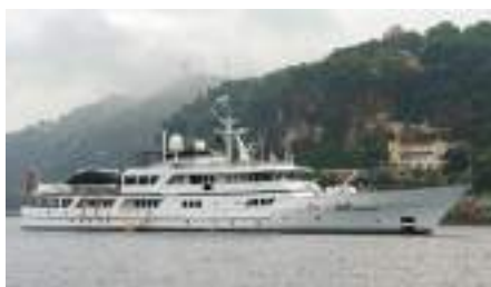
SANSSOUCI STAR Steel/Aluminium Large Motor Yacht 53.53 m 1982 Location: Flensburg, Germany EUR 2 250 000