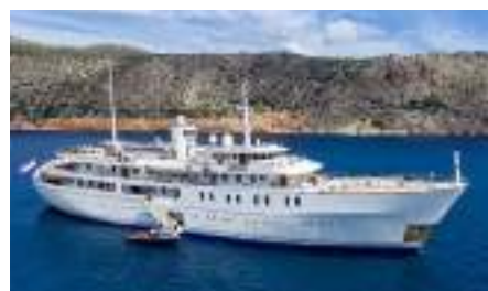
SHERAKHAN Length: 69.65 m Guest/Crew: 26/19 Area: East/West Mediterranean Rate: From EUR 485 000/week