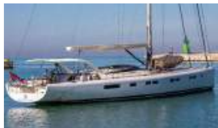
NAKUPENDA Length: 24.00 m Guest/Crew: 8/3 Area: West Mediterranean Rate: From EUR 21 000/week