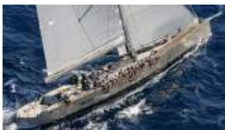
Y3K Wally 100ft 30.50 m 2009, Refit 2022 Location: Palma de Mallorca, Spain EUR 4 300 000