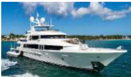
PIPE DREAM Length: 39.62 m Guest/Crew: 12/7 Area: Florida, Bahamas Rate: From USD 140 000/week