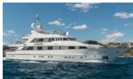
DESAMIS B Length: 40.00 m Guest/Crew: 11/8 Area: West Mediterranean Rate: From EUR 102 000/week