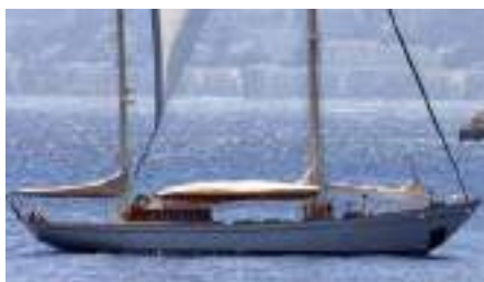
TAMORY Classic Wishbone Ketch 26.58 m 1952, Refit 1974 Location: Ventimiglia, Italy EUR 740 000