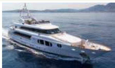
BINA Length: 43.25 m Guest/Crew: 12/8 Area: East/West Mediterranean Rate: From EUR 150 000/week