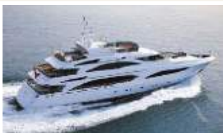
DIANE Length: 43.00 m Guest/Crew: 10/8 Area: West Mediterranean Rate: From EUR 140 000/week