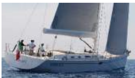
FELUCA Felci 71 21.60 m 2008 Location: Imperia, Italy EUR 890 000