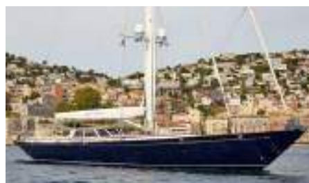
IRELANDA Length: 31.90 m Guest/Crew: 6/4 Area: West Mediterranean Rate: From EUR 35 000/week