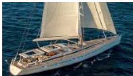
SAVARONA Aluminium Lifting Keel Sloop 28.60 m 2001, Refit 2021 Location: Caribbean EUR 1 790 000