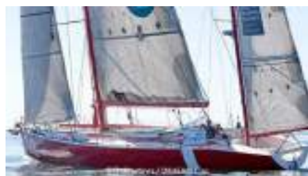
LE CIGARE ROUGE Open 60 18.18 m 1991, Refit 2018 Location: La Trinité sur Mer, France EUR 250 000