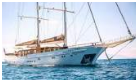
ZANZIBA Length: 40.00 m Guest/Crew: 10/7 Area: East Mediterranean Rate: From EUR 69 300/week