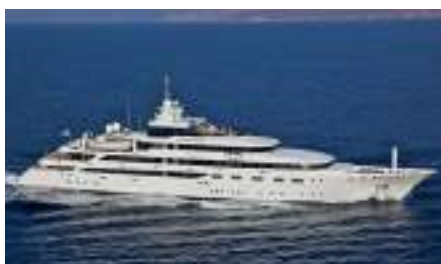
TITANIA Length: 73.00 m Guest/Crew: 12/19 Area: West Mediterranean Rate: From EUR 595 000/week