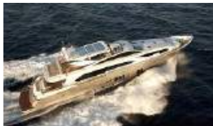
ASCENSION Length: 37.00 m Guest/Crew: 10/5 Area: West Mediterranean Rate: From EUR 100 000/week