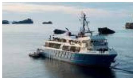
KUDANIL Length: 50.00 m Guest/Crew: 16/21 Area: Asia/Indonesia Rate: From USD 140 000/week