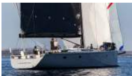
ARAGON Reichel Pugh 72 22.00 m 2006 Location: Palma, Spain EUR 992 000