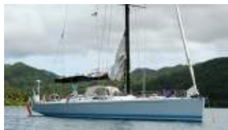
CAPRICORNO Maxi 79 24.01 m 1995, Refit 2005 Location: La Spezia, Italy EUR 850 000