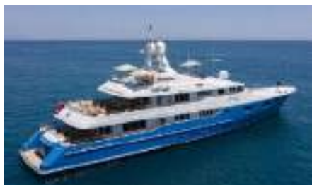
MOSAIQUE Length: 49.90 m Guest/Crew: 12/12 Area: West Mediterranean Rate: From EUR 200 000/week