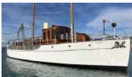
KIWI Motor Gentleman's Yacht 18.30 m 1914 Location: Sète, France P.O.A.