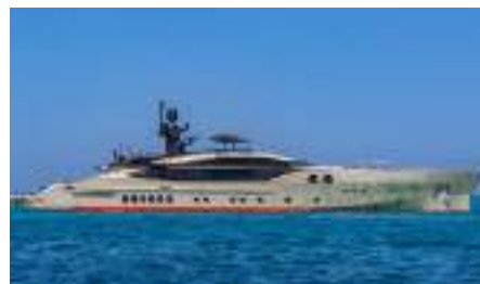
DB9 Length: 52.40 m Guest/Crew: 10/11 Area: West Mediterranean Rate: From EUR 250 000/week