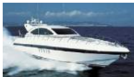
HALKIN Mangusta 72 21.56 m 1999 Location: Alassio, Italy EUR 430 000