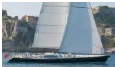
GRAND BLEU VINTAGE Length: 29.00 m Guest/Crew: 8/4 Area: West Mediterranean Rate: From EUR 39 000/week