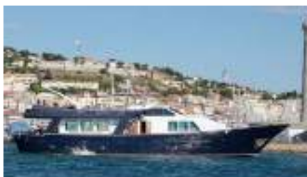
AFRICA QUEEN Classic Canoe Stern Gentleman's Yacht 29.80 m 1976 Location: Sète, France P.O.A.