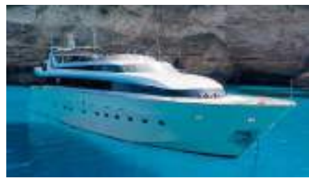
PAULA III Mondomarine 120 38.00 m 1995, Refit 2022 Location: Valencia, Spain EUR 2 200 000