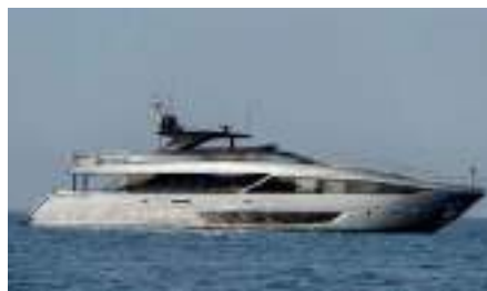
FIGURATI Length: 33.53 m Guest/Crew: 10/7 Area: West Mediterranean Rate: From EUR 135 000/week