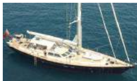
TIGA BELAS Length: 24.59 m Guest/Crew: 8/2 Area: West Mediterranean Rate: From EUR 22 000/week