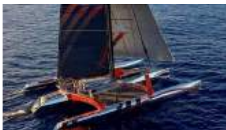
SHOCKWAVE Custom 63' Trimaran 19.20 m 2010 Location: Croatia EUR 740 000