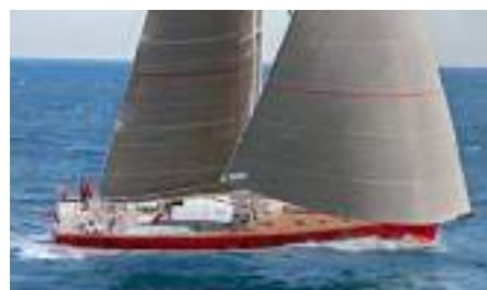
NOMAD IV Length: 30.48 m Guest/Crew: 12/6 Area: West Mediterranean Rate: From EUR 56 000/week