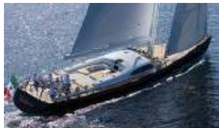
FARANDWIDE Length: 30.20 m Guest/Crew: 8/4 Area: West Mediterranean Rate: From EUR 46 000/week