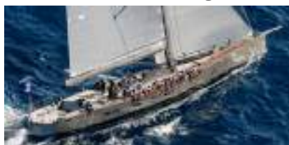
Wally 100 Y3K