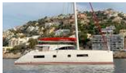
PARADISE Nautitech 542 16.30 m 2012 Location: Canet en Roussillon, France EUR 700 000