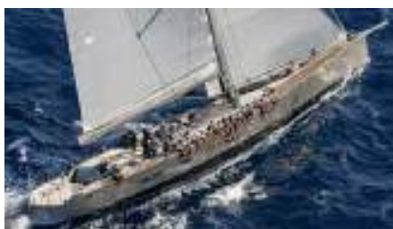
Y3K Wally 100ft 30.50 m 2009, Refit 2022 Location: Palma de Mallorca, Spain EUR 4 300 000