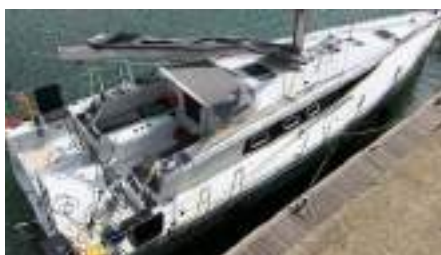
PEGASE Kobe 43' 13.00 m 2010 Location: Canary Islands EUR 350 000