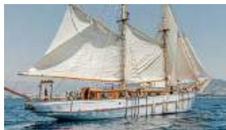
O'REMINGTON Classic Gaff Schooner 28.00 m 1948, Refit 2021 Location: Cannes, France EUR 950 000