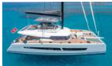
SEMPER FIDELIS Length: 20.42 m Guest/Crew: 6/3 Area: West Mediterranean Rate: From EUR 40 000/week