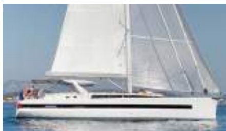
TAONA Oceanis 62 19.16 m 2018 Location: Trogir, Croatia EUR 910 000