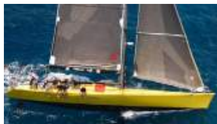
CHESSEA Volvo 60 19.50 m 1997, Refit 2015 Location: Sète, France EUR 180 000