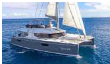
ARAOK Length: 17.80 m Guest/Crew: 6/3 Area: West Mediterranean Rate: From EUR 25 000/week