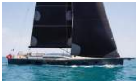
LUCE GUIDA Length: 23.60 m Guest/Crew: 6/2 Area: West Mediterranean Rate: From EUR 24 000/week