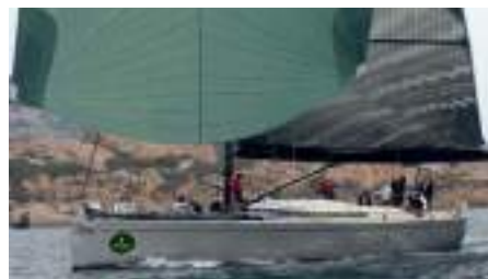
SILANDRA V Swan 76 23.20 m 2007, Refit 2021/2022 Location: Imperia, Italy EUR 3 500 000