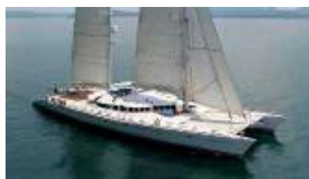
DOUCE FRANCE Two Masted Catamaran Schooner 42.20 m 1998, Refit 2015 Location: Mediterranean P.O.A.