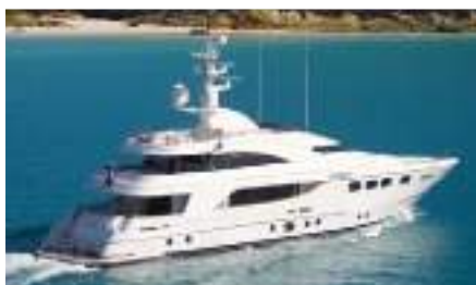
DE LISLE III Length: 42.00 m Guest/Crew: 9/7 Area: Australia Rate: From AUD 165 000/week