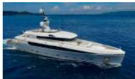
ASLEC 4 Length: 48.00 m Guest/Crew: 10/9 Area: West Mediterranean Rate: From EUR 180 000/week