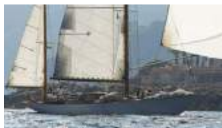
GIANNELLA II Yawl Marconi Sangermani 64 19.64 m 1966 Location: Palma de Mallorca, Spain EUR 495 000