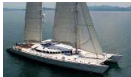
DOUCE FRANCE Length: 42.20 m Guest/Crew: 12/7 Area: East Mediterranean Rate: From EUR 99 500/week