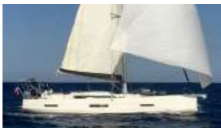
RAPHAËL Dufour 56 Exclusive 17.15 m 2019 Location: Saint-Cyprien, France EUR 580 000