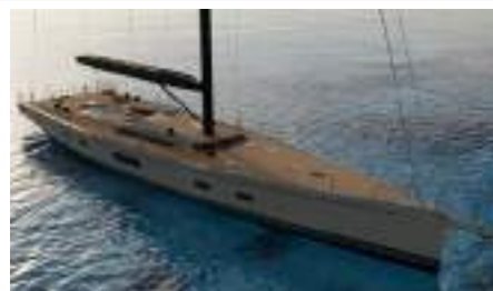
FANCY Length: 32.92 m Guest/Crew: 9/5 Area: West Mediterranean Rate: From EUR 115 000/week