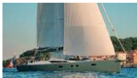
ICTUS Futuna 70 21.75 m 2010 Location: Marseille, France EUR 950 000