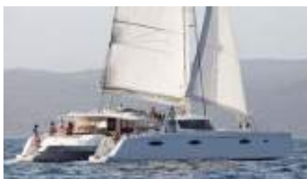
MOBY DICK Galathea 65 19.81 m 2009 Location: Dominique, Caraïbes EUR 980 000