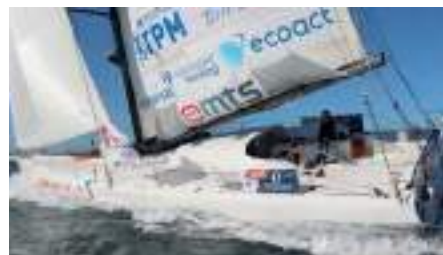
MERCI Imoca 60 20.10 m 2010 Location: Toulon, France EUR 390 000