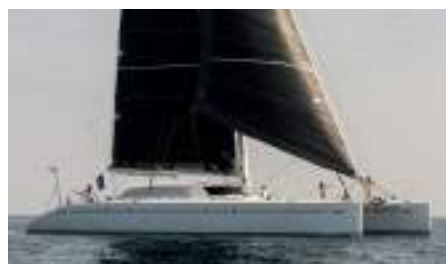
MAGIC CAT Length: 25.00 m Guest/Crew: 8/4 Area: Caribbean Rate: From EUR 38 000/week