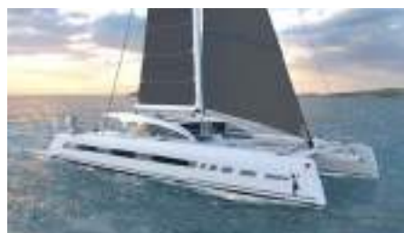
GP 70 GP 70 21.00 m New, to be launched soon! Location: Portugal P.O.A.