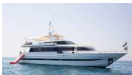
HEARTBEAT OF LIFE Heesen Yachts 28.20 m 1989, Refit 2008 Location: Barcelona, Spain EUR 1 100 000