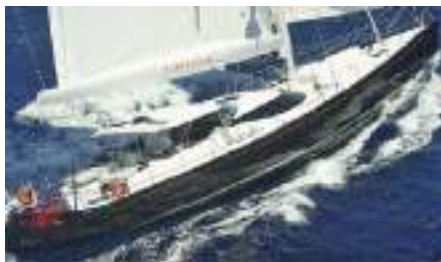
BLISS Length: 36.70 m Guest/Crew: 6/5 Area: East/West Mediterranean Rate: From EUR 72 500/week