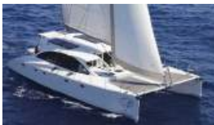
FRIENDS FOREVER DH 550 16.75 m 2016 Location: Portimao, Portugal EUR 655 000