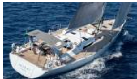
IKIGAI JFA 82 Sloop 25.13 m 2001, Refit 2018 Location: Palma, Spain EUR 2 100 000