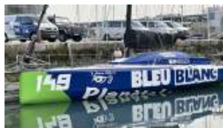
HYDRA Class 40 N.149 12.19 m 2017, Refit 2022 Location: Guadeloupe, Caribbean EUR 295 000