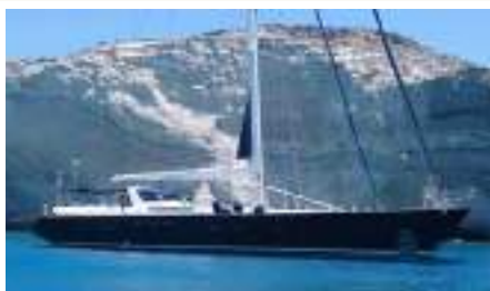
AMADEUS Length: 33.50 m Guest/Crew: 12/6 Area: East Mediterranean Rate: From EUR 35 000/week