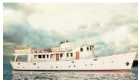
THEMARA Long Range Gentleman Motor Yacht 24.60 m 1962, Refit 2022 Location: Marseille, France EUR 950 000