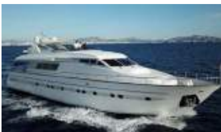
OLA Length: 23.95 m Guest/Crew: 8/3 Area: South of France Rate: From EUR 22 000/week