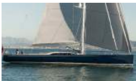
FARFALLA Length: 31.78 m Guest/Crew: 8/5 Area: Pacific Ocean Rate: From EUR 70 000/week