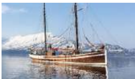
LUN II Norwegian Galeas 20.76 m 1914 Location: Amsterdam, NL EUR 295 000