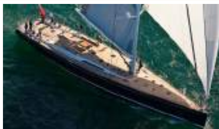
THALIMA Length: 33.70 m Guest/Crew: 8/5 Area: West Mediterranean Rate: From EUR 58 000/week