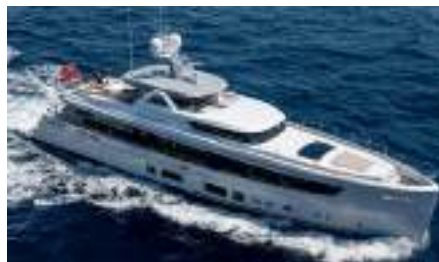
CALYPSO I Length: 36.00 m Guest/Crew: 10/6 Area: West Mediterranean Rate: From EUR 148 500/week