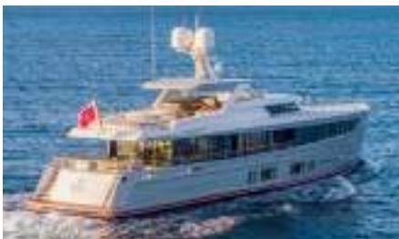
DELTA ONE Length: 36.00 m Guest/Crew: 10/8 Area: West Mediterranean Rate: From EUR 145 000/week