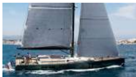
SHAMLOR Nacira 67 20.42 m 2012 Location: Olbia, Italy EUR 1 500 000