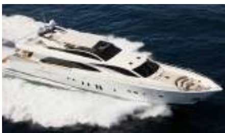
LADY EMMA Length: 34.10 m Guest/Crew: 8/4 Area: West Mediterranean Rate: From EUR 69 000/week