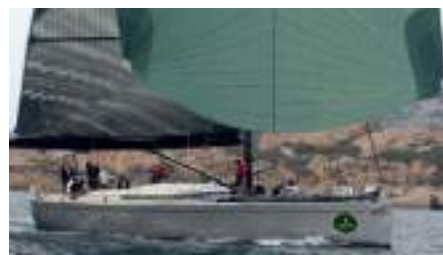
SILANDRA V Swan 76 23.20 m 2007, Refit 2021/2022 Location: Imperia, Italy EUR 3 500 000