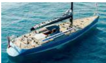
KALLIMA Length: 24.89 m Guest/Crew: 8/3 Area: West Mediterranean Rate: From EUR 30 000/week