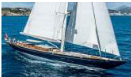
ATALANTE Length: 27.50 m Guest/Crew: 6/3 Area: West Mediterranean Rate: From EUR 37 000/week