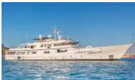
SANSSOUCI STAR Length: 53.50 m Guest/Crew: 12/6 Area: Northern Europe Rate: From EUR 95 000/week