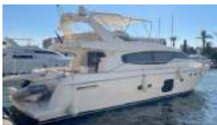
ELLION Ferretti 630 19.46 m 2008 Location: Roses, Spain EUR 795 000