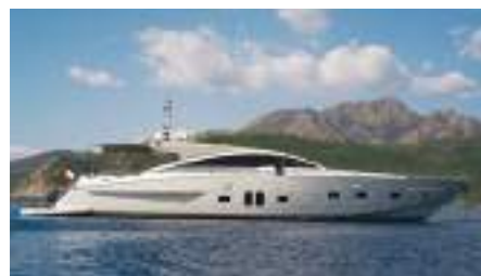
NOE Guy Couach 2800 Open 28.60 m 2013 Location: Port Grimaud, France EUR 2 950 000