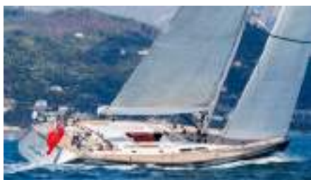
ELISE WHISPER SW 78 23.99 m 2001 Location: Genoa, Italy EUR 1 490 000