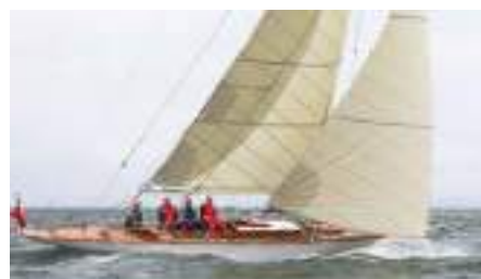
SILK 8 M JI 14.85 m 1947, Refit 2016 Location: Lorient, France EUR 195 000