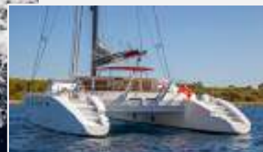
TAJ, page 17