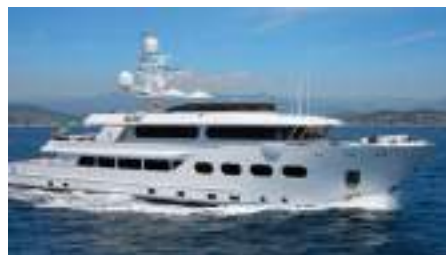
BARON TRENCK Eurocraft 142' 43.50 m 2011, Refit 2023 Location: Loano, Italy EUR 13 900 000