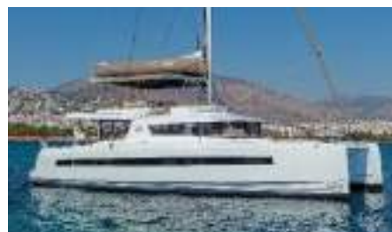
LICENSE TO CHILL Length: 16.80 m Guest/Crew: 10/2 Area: East Mediterranean Rate: From EUR 13 260/week