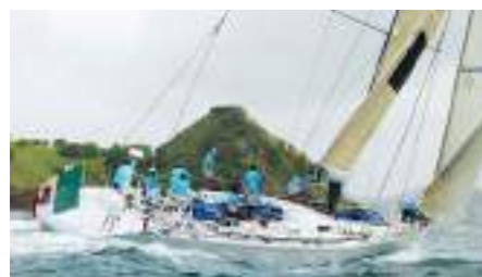
CAPRICORNO Maxi 79 24.01 m 1995, Refit 2005 Location: La Spezia, Italy EUR 850 000