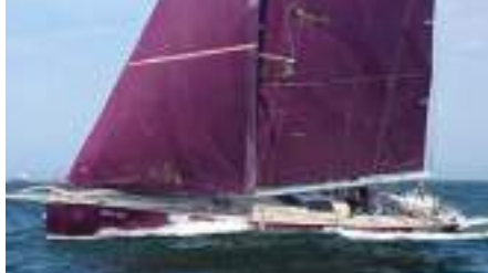
GLOBE Ex Imoca 60 18.28 m 1992 Location: Gdansk, Poland EUR 115 000