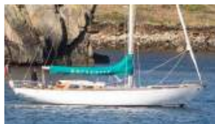
ROCQUETTE Camper & Nicholson's 43 12.88 m 1964, Refit 2019 Location: Douarnenez, France, EUR 115 000