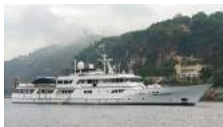
SANSSOUICI STAR Steel/Aluminium Large Motor Yacht 53.53 m 1982 Location: Flensburg, Germany EUR 2 250 000