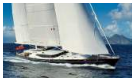
DRUMBEAT Length: 53.00 m Guest/Crew: 10/10 Area: East/West Mediterranean Rate: From EUR 175 000/week