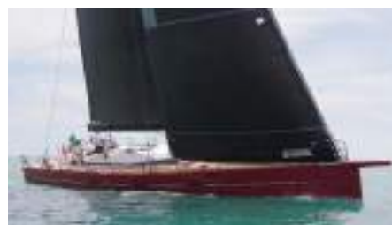
RED CARPET Vismara V71 21.82 m 2017 Location: Viareggio, Italy EUR 995 000