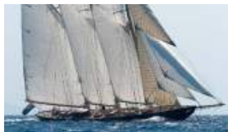
ATLANTIC New Classic Schooner Replica 64.50 m 2010 Location: France/Italy EUR 12 000 000