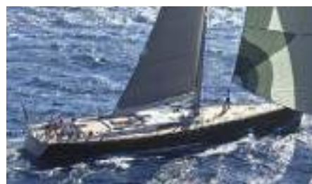
ARAGON Length: 28.64 m Guest/Crew: 8/4 Area: West Mediterranean Rate: From EUR 44 000/week