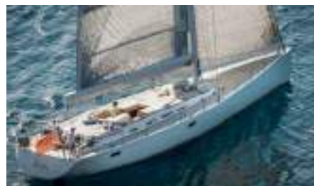
LA VIDELLE Length: 21.60 m Guest/Crew: 6/2 Area: West Mediterranean Rate: From EUR 16 000/week