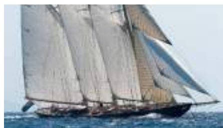
ATLANTIC New Classic Schooner Replica 64.50 m 2010 Location: France/Italy EUR 12 000 000