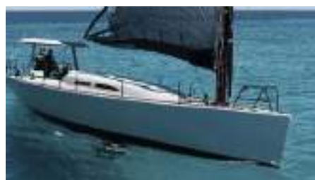
WATER MAIDEN Cat-Rigged Sailing Yacht 13.90 m 2008 Location: Canet en Roussillon, France EUR 145 000