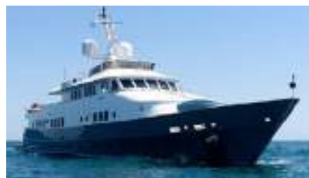
BERZINC Camper & Nicholson's Design 44.68 m 1977, Refit 2012 Location: West Mediterranean EUR 3 600 000