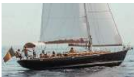
LAZY DAYS Cruising TM 52 15.85 m 2004 Location: Palma de Mallorca, Spain EUR 380 000