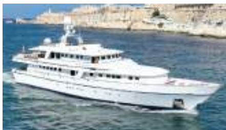
CHEETAH MOON 38m Custom 38.36 m 1986, Refit 2020 Location: Malta EUR 3 000 000