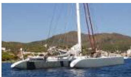
OCEAN PEARL Maxi Catamaran 33.50 m 2000 Location: Barcelona, Spain EUR 950 000