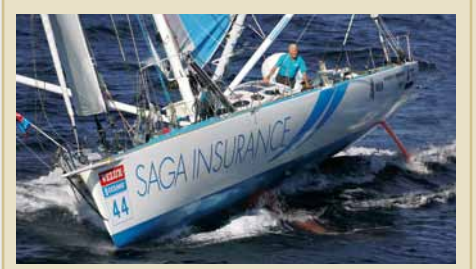
SPARTAN, ex SAGA 18.28 m