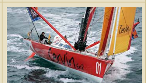
ENERGIE AUTOUR DU MONDE Open 60 IMOCA Class 18.28 m