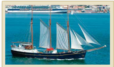
PRINCIPE PERFEITO 3 Mast Schooner 41.52 m 1943 10 guests 1,650,000 €