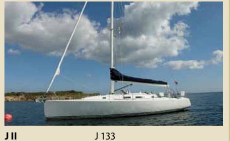
13.11 m 2005 6 guests 180,000€