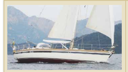
ZARIK Dynamique 62 18.73 m 1985 8 guests 280,000€