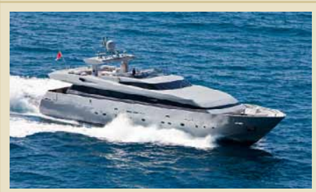
MY SPACE 34.00 m 10/6 ???? 75,000/68,000 €/week