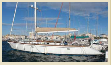
EQUINOX Selestra 64, aluminium 20.54 m 1996/2010 8 guests 350,000 €