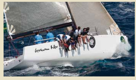
GERANIUM KILLER 11.98 m