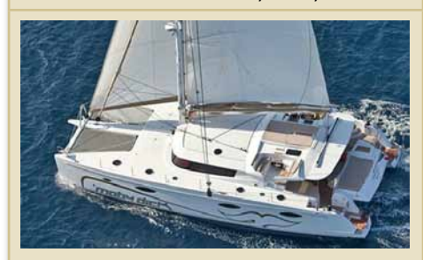
MOBY DICK 19.81 m 10/3 West Mediterranean – Carribean 26,000/22,000 €/week