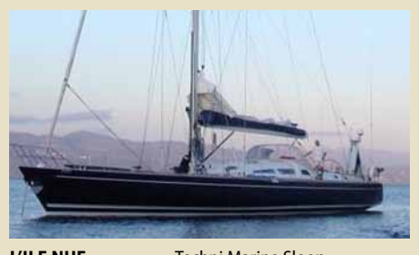
L'ILE NUE Techni Marine Sloop 23.66m 1988 8 guests 850,000 €