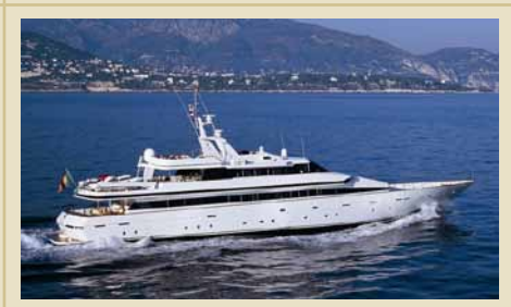
COSTA MAGNA 44.50 m 10/8 West Mediterranean 96,000/90,000 €/week