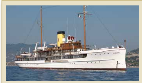
DELPHINE Steam Ship 258ft 78.50 m 1921/2003 26 guests 38,000,000 €