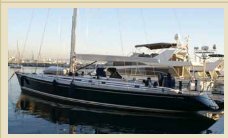
SEAWOLF 3 19.82 m 6/2 West Mediterranean 17,000/15,000 €/week