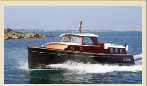
LOCH LOMOND Classic Tender 9.00 m 2007 12 passengers 175,000 €