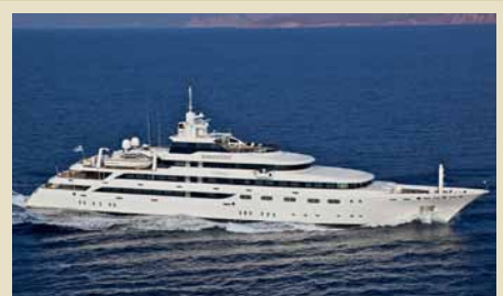
Name: O'MEGA Guest/Crew: 32/30 Rate (high/low):