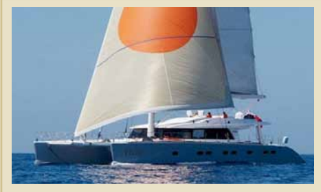
MAITA'1 22.56 m 9/4 West Mediterranean – Carribean 42,000 36,000 €/week