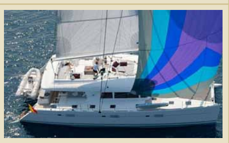
Crocodile Daddy18.90 m8/3West Mediterranean – Carribean26,000 €/week