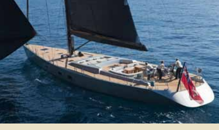
DARK SHADOW 30.45 m 6/5 West Mediterranean 50,000 €/week