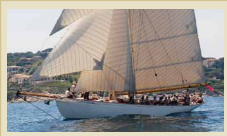
MOONBEAM OF FIFE III Gaff Cutter 31.00 m 1903 10 guests 2,500,000 €