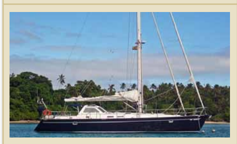
LACARABA Adams 52 16.00 m 1998 8 guests 250,000€