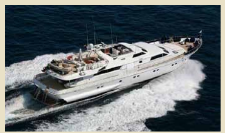
ANTISAN 33.00 m 12-40/6 West Mediterranean 56,000/49,000 €/week