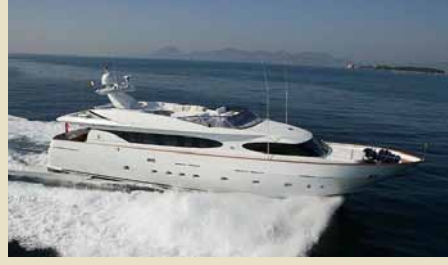
TALILA 29.00 m 8/4 West Mediterranean 46,000 /40,000 €/week