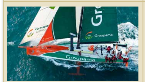
GROUPAMA 70 21.50 m