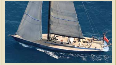
WALLY ONE 25.30 m 11/3 West Mediterranean 24,000/18,000 €/week