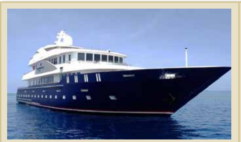
DHAAINKAN'BAA 40.00 m 14/18 Indian Ocean/Maldives 115,000/100,000 USD/week