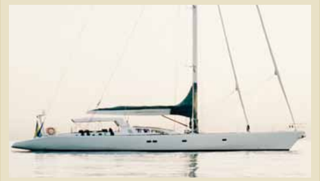
SUSANNE AF STOCKHOLM Aluminium sloop 30.16 m 1990/2008 8 guests 2,900,000 €