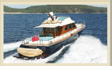
MATHIGO Morgan 70 21.24 m 2007 7 guests 980,000 €