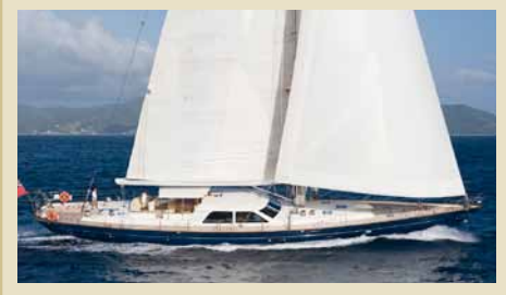
AVENTURA Danish Yacht & Holland Jachtbouw Sloop 33.24 m 2005 10 guests US$ 5,995,000