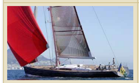
Mrs SEVEN 30.20 m 8/5 West/East Mediterranean – Carribean 52,000/46,000 €/week