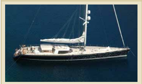
VAIMITI 39.20 m 10/5 East Mediterranean – Carribean 72,000/67,000 USD/week