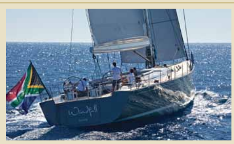
WINDFALL 28.64 m 7/4 West Mediterranean 45,000/40,000 €/week