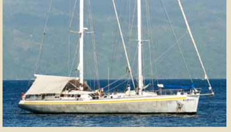
ANTSIVA Aluminium Centre board schooner 28.00 m 2004 10 guests 1,190,000 €