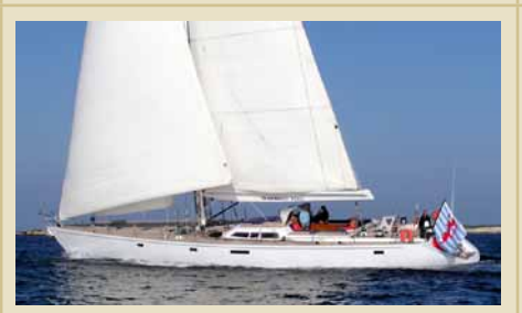
DJANGO TOO 25.00 m 8/4 East/West Mediterranean – Carribean 25,000 €/week