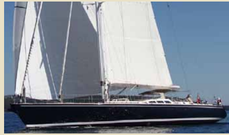
07<sup>2</sup> - OCEAN SEVEN SQUARED 31.69 m 8/4 Carribean 54,000 USD/week