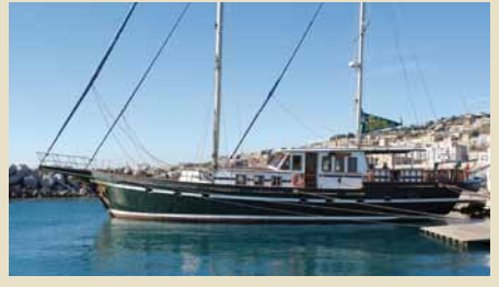
BOJAROS Steel Ketch 25,60 m 2000 10 guests 350,000 €