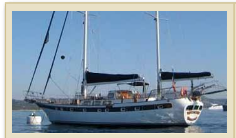
BIG MOMMA Formosa 58 20.00m 1982 8 guests 250,000€