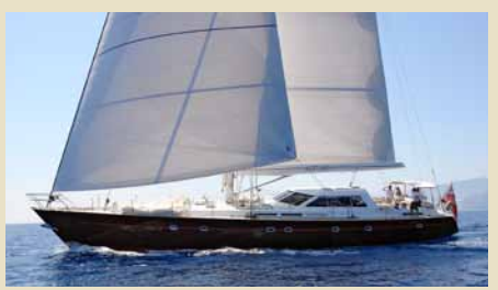
NEPTUNE Fitzroy Aluminium Sloop 25.65 m 2004 7 guests 1,990,000 €