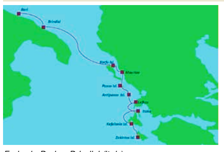
Embark: Bari or Brindisi (Italy) Disembark: Zakintos (Greece) - or viceversa

Bari ◆ Brindisi – Korfu Island ◆ Korfu Isl. (town) ◆ Sivota Bay (Mourtos) ◆ Paxos Island: Lakka, Gaios ◆ Antipaxos Island