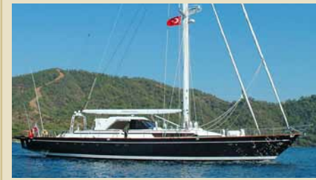
SOUTHERN CROSS Maxi 88 Sloop 29.70 m 1991/2004 8 guests 1,350,000 €