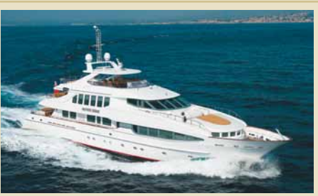
SEVEN SINS 41.30 m 10/7 Croatia, Greece 120,000 €/118,300 USD/week