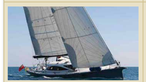
EUPHONIE Sydney 60 converted 18.20 m 1998/2005