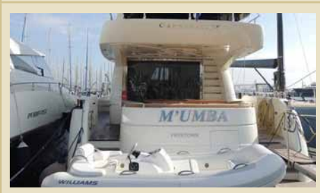
M'UMBA Carnevali C68 20.00 m 2007 8 guests 750,000 €