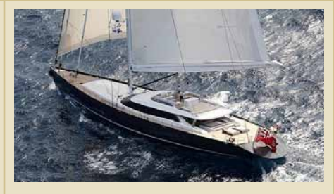
RED DRAGON 51.70 m 8/10 West Mediterranean 200,000 €/week