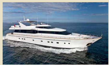
SYNERGY 30.70 m 10/5 West Mediterranean 52,500/45,500 €/week