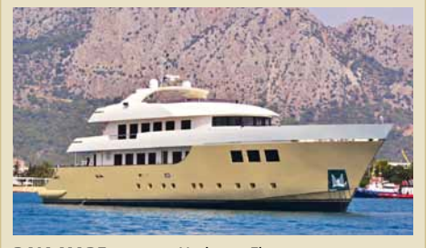
BAIA MARE Ned 41 m Fly 40.80 m 2011 12 guests 10,500,000 €