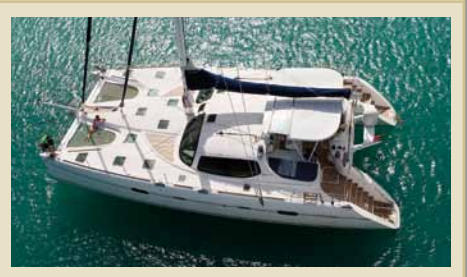
OCEAN'S SEVEN Privilege 585, Catamaran 17.82 m 2004/2007 8 guests 695,000€