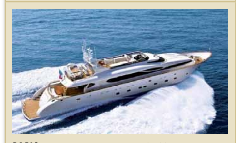
PARIS 35.00 m 12/6 Greece 73,000/63,000 €/week