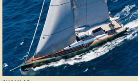
SHAMLOR 20.00 m 6/2 West Mediterranean 20,000/15,000 €/week