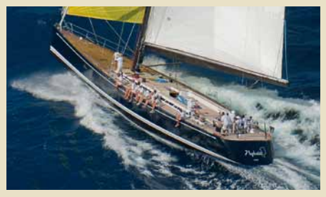
NEFERTITI 27.70 m 8/4 West Mediterranean – Carribean Rate (high/low): 50,000 USD/week