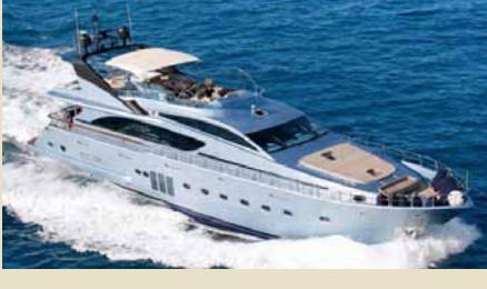
MAKARENA 30.00 m 10/5 Pucket 25,000 €/week