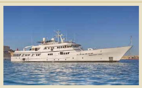
SANSSOUCI STAR 12/8