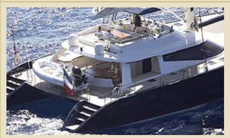
NAHEMA IV 21.95 m 8/3 West Mediterranean – Carribean 32,000 29,000 €/week