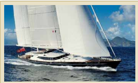
Name: DRUMBEAT Length: 53.00 m Guest/Crew: 11/10 Area: South Pacific – South East Asia Rate (high/low): 230,000 USD/week