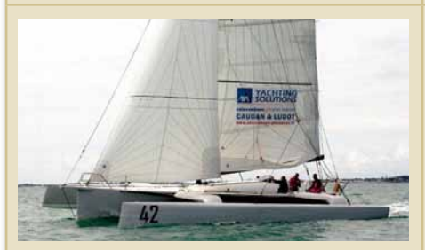
KRYSALID 12.70 m