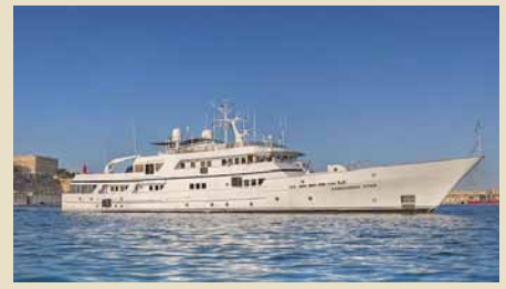
SANSSOUCI STAR Classic Motor Yacht 53.53 m 1982 12 guests Price on application