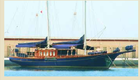
WISH Motor Sailor 25.80 m 2004 6 guests 580,000 €