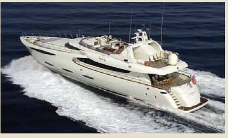
MABRUK III 35.00 m 10/6 West Mediterranean 65,000 €/week