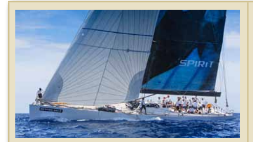
MED SPIRIT 28.20 m