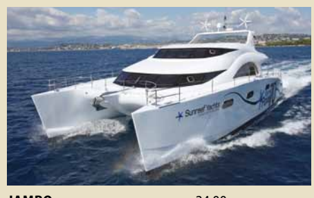
JAMBO 24.00 m 8/2 Pacific Ocean 29,750 €/week