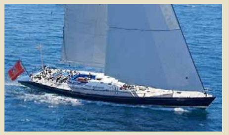
BAIURDO VI 34.00 m 8/4 East Mediterranean/Carribean 41,000/38,000 €/week