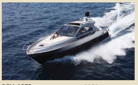
DELL ARTE 16.94 m 5/1 Seychelles 12,000/15,000 €/week