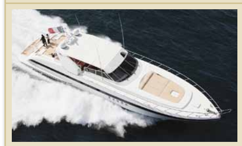
SILAOS 25.10 m 7-12/2 West Mediterranean 33,000/27,000 €/week