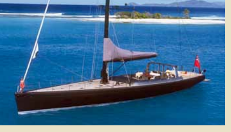
WALLY B 32.72 m 6/5 East/West Mediterranean 50,000/47,500 €/week