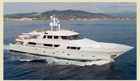
SENSEI 39.98 m 10/7 West Mediterranean 98,000/70,000 €/week