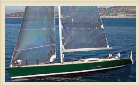
GENIE 24.00 m 6/3 West Mediterranean 30,000/25,000 €/week