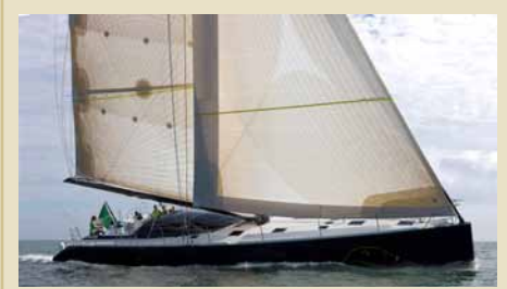
OURSON RAPIDE 60ft Multiplast Fast Sloop 6 guests 18.28 m 2009 2,350,000€