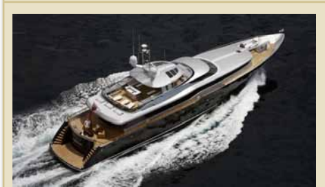
COMO Alloy Yachts 41.14 m 2007 10 guests 10,995,000 €