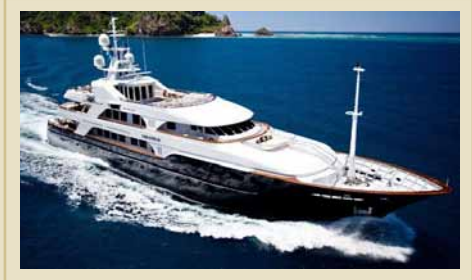
NOBLE HOUSE 53.90 m 12/12 Australia 199,000 USD/week