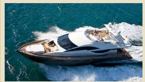
VENTURA SU Numarine 78 Fly 23.98 m 2008 8 guests 1,100,000 €