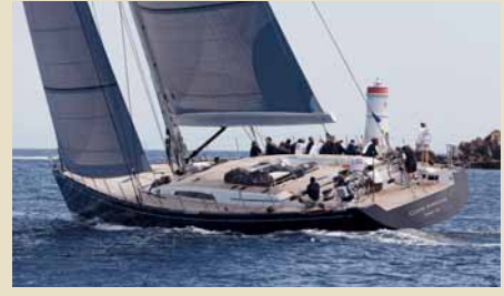
CAPE ARROW 30.20 m 8/4 West Mediterranean – Carribean 50,000/45,000 €/week