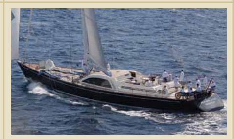
HIGHLAND BREEZE 34.34 m 8/5 West Mediterranean – Carribean 52,000/46,000 €/week