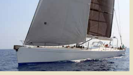
QUINTA SANTA MARIA Composite Cruising Sloop 27.42 m 2001 8 guests 1,750,000 €