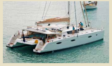
WORLD'S END 19.67 m 10/3 West Mediterranean – Carribean 25,000/24,000 USD/week