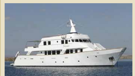
SHERAZADE Motor Yacht (Diving Charter) 32.15 m 2006 10 guests 990,000 €