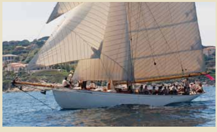
MOONBEAM III 31.00 m 6-12/2 West Mediterranean 35,000/30,000 €/week