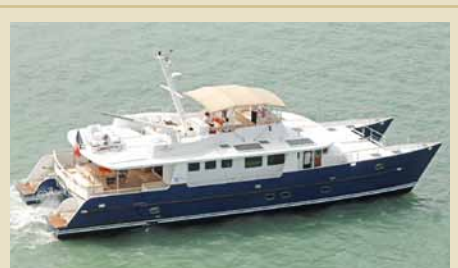
PELICANO Motor Catamaran 23.95 m 2005 6 guests 1,250,000 €