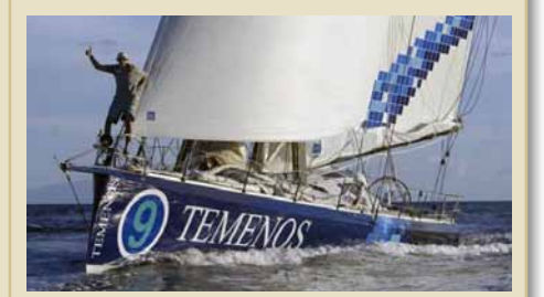
TEMENOS Open 60 IMOCA Class 18.28 m 2006