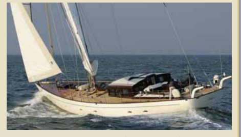
ATAO Neo-classic JFA Yachts 24.90m 2006 8 guests 2,950,000 €