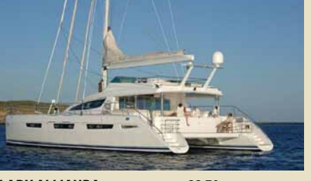
LADY ALLIAURA 22.70 m 8/3 Caribbean 42,000/29,000 €/week