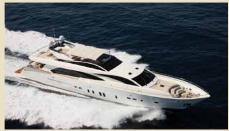
LADY EMMA 34.10m 8/4 South of France 78,000/72,000 €/week