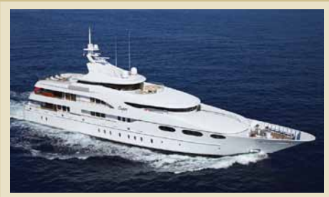
CAPRI 58.55 m 12/15 West Mediterranean 340,000/260,000 €/week