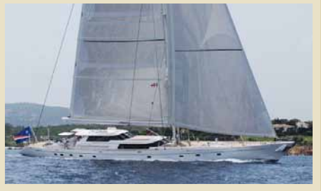
HYPERION 47.42 m 6/8 West Mediterranean – Carribean 97,000/90,000 USD/week