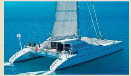
MAGIC CAT 25.00 m 8/4 East/West Mediterranean – Carribean 35,000/30,000 €/week