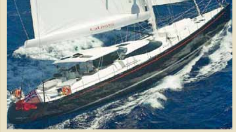
BLISS (sailing yacht) 37.00 m 10/4 West Mediterranean – Carribean 70,000/89,000 USD/week