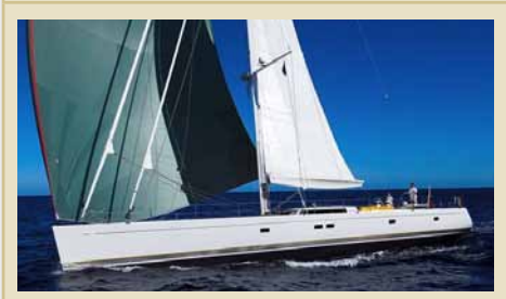
WHIMSY Custom performance sloop 23.98m 2005 6 guests 2,850,000 €