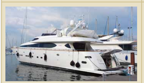
LADY KATANA II Maiora 30 DP 30.20 m 1997 8 guests 1,500,000 €