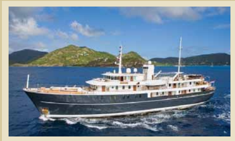
SHERAKHAN 69.95 m 26-36/19 West Med. & Croatia 350,000 €/week