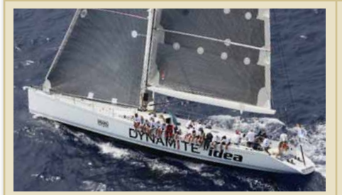
IDEA 23.90 m 12/4 West Mediterranean 30,000/25,000 €/week