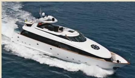
L'OR 30.00 m 8/5 West Mediterranean 40,000 €/week