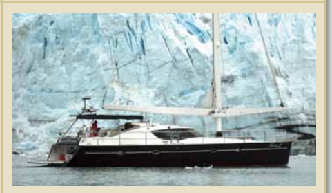
MELINA I 56ft Cruising Sloop 17.10 m 2004 6 guests 390,000€