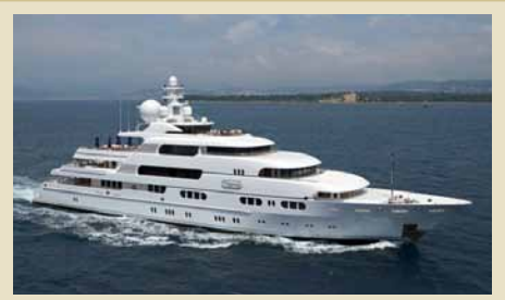
TITANIA 72.00 m 12/22 West Mediterranean 600,000 €/550,000 €/week