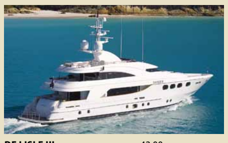
DE LISLE III 42.00 m 10/6 South Pacific, Australia, Fiji 100,000 €/week