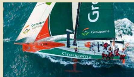
GROUPAMA 70 VOR 70 21.50 m 2008 Location: West France 900,000 €