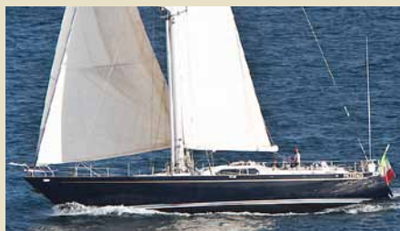
KINZANA GEM 610 19.26m 1989 Location: Sardinia, Italy 450,000 €