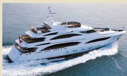
DIANE 43.00 m 10/8 West Mediterranean 150,000/135,000 €/week