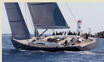
CAPE ARROW 30.20 m 8/4 West Mediterranean – Caribbean 50,000/45,000 €/week