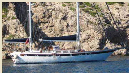
BIG MOMMA Formosa 58 20.00m 1982 Location: South France 250,000 €