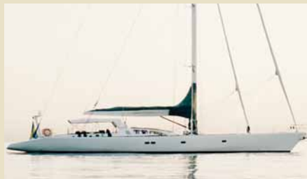
SUSANNE AF STOCKHOLM Aluminium Sloop 30.16 m 1990/2008 Location: Caribbean 2,900,000 €