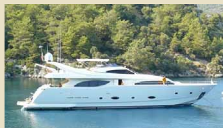
PRINCIPESSA Ferretti Custom Line 94 Fly 28.80 m 2005 Location: Turkey 3,330,000 €