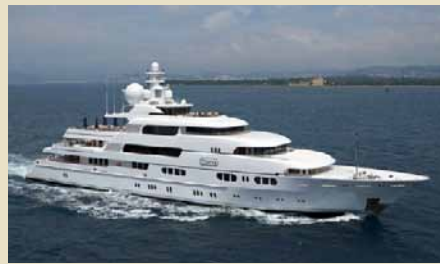
TITANIA 72.00 m 12/22 West Mediterranean 600,000 €/550,000 €/week