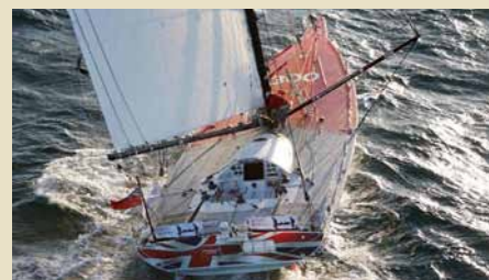
SPARTAN, ex SAGA Open 60 IMOCA Class 18.28 m 1997 Location: South England 200,000 GBP