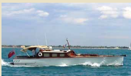
ALLEGIANCE Réplique C&N 1925 14.40 m 2004 Location: South France 330,000 €