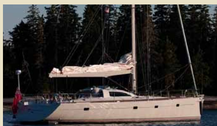
WANAKA 2 Next 57 17.20 m 2003 Location: East Italy 550,000 €