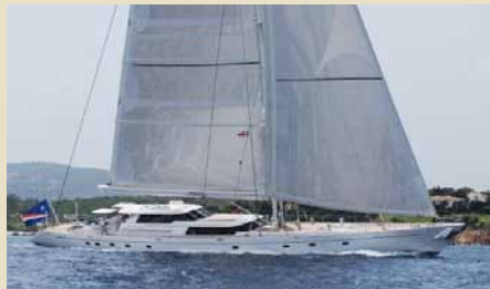
HYPERION 47.42 m 6/8 West Mediterranean – Caribbean 97,000/90,000 USD/week