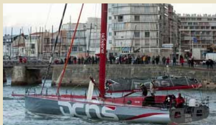
DCNS Open 60 IMOCA Class 18.28 m 2008 Location: West France 690,000 €