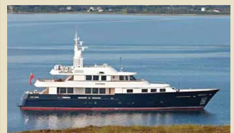
CALLIOPE 42.28 m 10/9 Croatia 190,000 USD/week