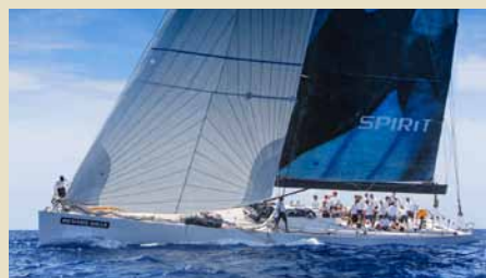
MED SPIRIT Super Maxi Yacht 28.20 m 2003 Location: South France 650,000 €