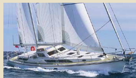
LAZY JACK Amel 54 17.20 m 2008 Location: West France 695,000 €