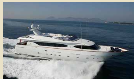
TALILA 29.00 m 8/4 West Mediterranean 46,000 /40,000 €/week