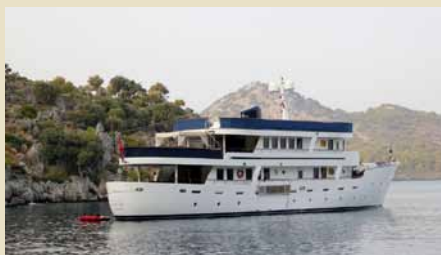
LA SULTANE Neo Classic Motor Yacht 34.10 m 2006 Location: Turkey 2,800,000 €