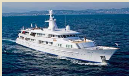
ILLUSION 55.50 m 12/13 West & East Mediterranean 196,000/175,000 €/week