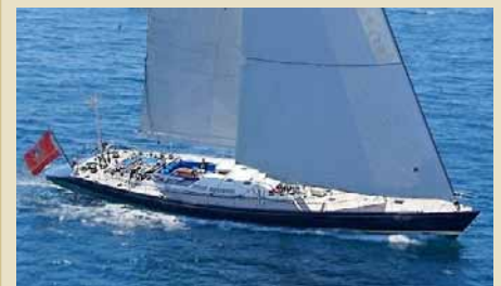
BAIURDO VI 34.00 m 8/4 East Mediterranean/Caribbean 41,000/38,000 €/week