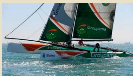
GROUPAMA 40 Extreme 40 12.20 m 2009 Location: West France 190,000 €