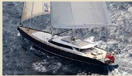
RED DRAGON 51.70 m 8/10 West Mediterranean 175,000 €/week