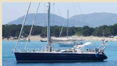
LUAR Passoa 54 Aluminium Centreboard Sloop 16.32 m 2002 Location: Caribbean 330,000 €