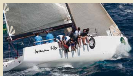
GERANIUM KILLER A40 RC 11.98 m 2008 Location: South France 140,000 €