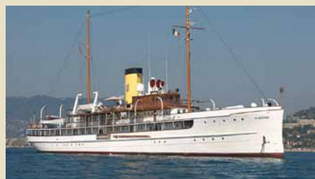
DELPHINE Steam Ship 78.00 m 1921 Location: Tunisia 39,000,000 USD