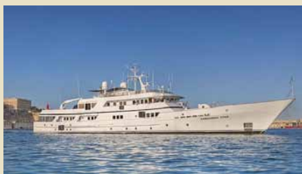
SANSSOUCI STAR Classic Motor Yacht 53.53 m 1982 Location: Baltic Sea Price on application