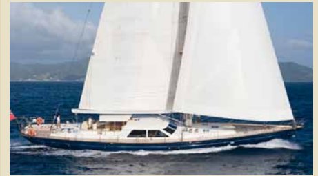
AVENTURA Danish Yacht & Holland Jachtbouw Sloop 33.24 m 2005 Location: East USA US$ 5,995,000