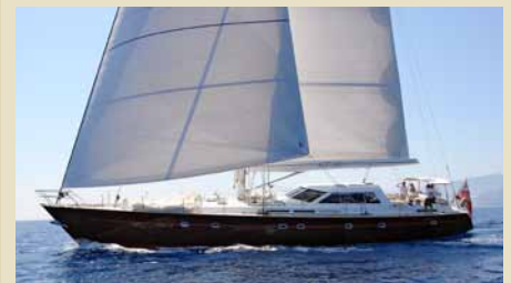
NEPTUNE Fitzroy Aluminium Sloop 25.65 m 2004 Location: Liguria, Italy 1,750,000 €