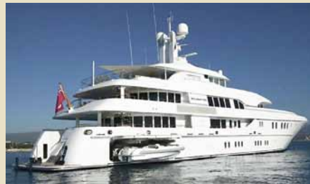
SOLEMATES 60.00 m 12/15 West Mediterranean 520,000/450,000 €/week