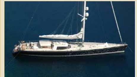
VAIMITI 39.20 m 10/5 East Mediterranean – Caribbean 72,000/67,000 USD/week