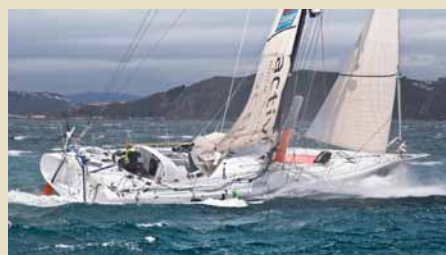
SPIRIT OF CANADA Open 60 ECO Class 18.28 m 1997 Location: East Canada 159,000 €