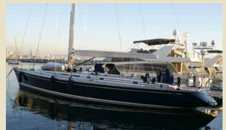
SEAWOLF 3 19.82 m 6/2 West Mediterranean 17,000/15,000 €/week