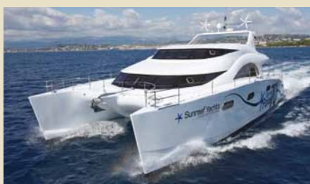
JAMBO 24.00 m 8/2 Pacific Ocean 30,000 €/week