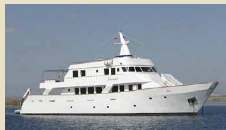
SHERAZADE Motor Yacht (Diving Charter) 32.15 m 2006 Location: Egypt 990,000 €