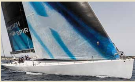
MED SPRIT (ex BOLLS) 29.70 m 12-16/8 West Mediterranean – Caribbean 50,000/35,000 €/week