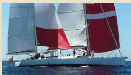
FORTUNA Maxi 82 Ketch 25.40 m 1989/2005 Location: Spain 495,000 €