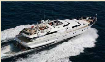
ANTISAN 33.00 m 12-40/6 West Mediterranean 56,000/49,000 €/week