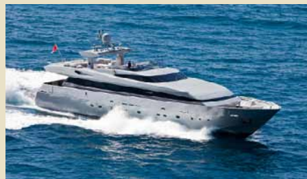
MY SPACE 34.00 m 10/6 ??? 75,000/68,000 €/week