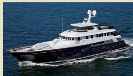
KARIA RMK 4500 45.00 m 2011 Location: Turkey 19,000,000 €