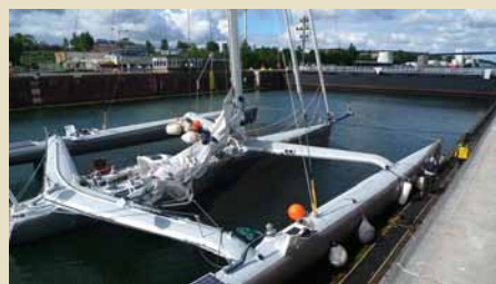
LAKOTA 60ft Orma Trimaran 18.28 m 1990 Location: West France 280,000 €