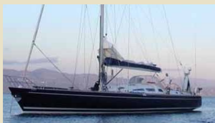
L'ILE NUE Techni Marine Sloop 23.66m 1988 South France/Caribbean 720,000 €