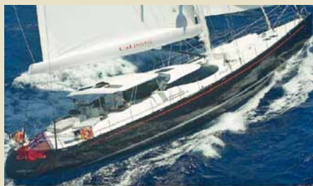
BLISS (sailing yacht) 37.00 m 10/4 West Mediterranean – Caribbean 89,000/98,000 USD/week