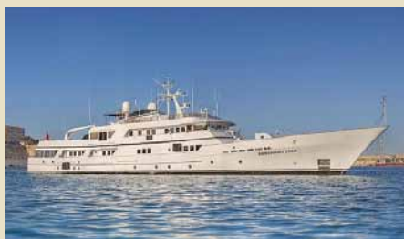
SANSSOUCI STAR 53.50 m 12/8 West Mediterranean 70,000/65,000 €/week