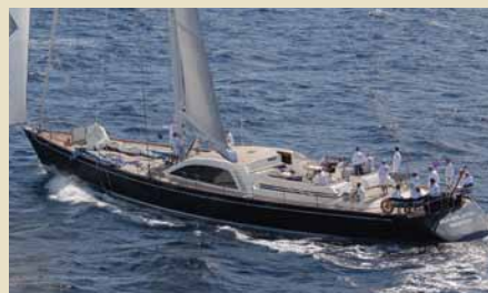
HIGHLAND BREEZE 34.34 m 8/5 West Mediterranean – Caribbean 52,000/46,000 €/week