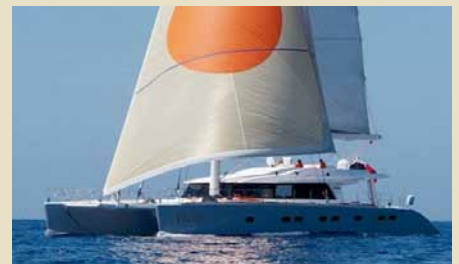
MAITA'1 22.56 m 9/4 West Mediterranean – Caribbean 42,000 34,000 USD/week