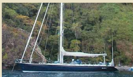
SILANDRA Nauto 70 21.33 m 1991 Location: Caribbean 750,000 USD