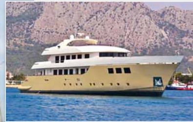
BAIA MARE, p. 4