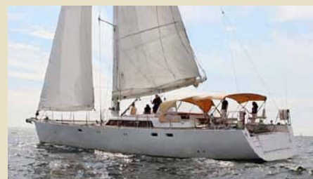
NAUSICAA Aluminium Sloop 20.00 m 2006 Location: South France 320,000 €