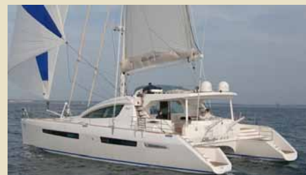
ETANA Privilege 615 18.50m 2007 Location: South France 850,000 €