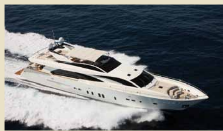
LADY EMMA 34.10m 8/4 South of France 78,000/72,000 €/week