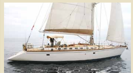
EQUINOX Selestra 64, aluminium 20.54 m 1996/2010 Location: South France 290,000 €