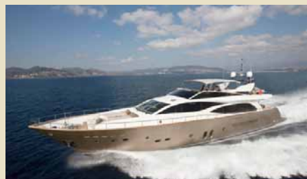
MAYAMA 30.70 m 10/4 West & East Mediterranean 59,500/54,000 €/week