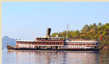
HALAS 50.00 m 24/TBC East Mediterranean 105,000/93,000 €/week