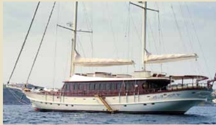
QUEEN OF ANDAMAN Classic Motor Sailing 41.00 m 2007 Location: Spain 3,875,000 €