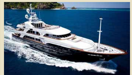
NOBLE HOUSE 53.90 m 12/12 Australia 199,000 USD/week