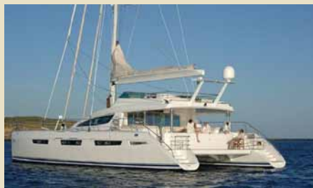
LADY ALLIAURA 22.70 m 8/3 Caribbean 44,000/39,500 USD/week