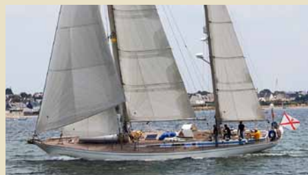
CASSIOPEIA Swan 65 19.68m 1975 Location: Spain 450,000 €