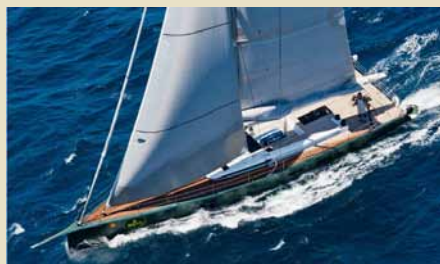
SHAMLOR 20.00 m 6/2 West Mediterranean 20,000/15,000 €/week