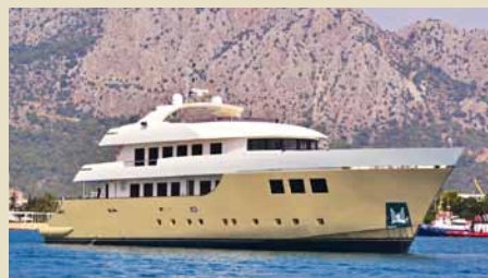
BAIA MARE Ned 41m Fly 40.80 m 2011 Location: Turkey 10,500,000 €