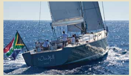
WINDFALL 28.64 m 6+1/4 West Mediterranean 45,000/40,000 €/week