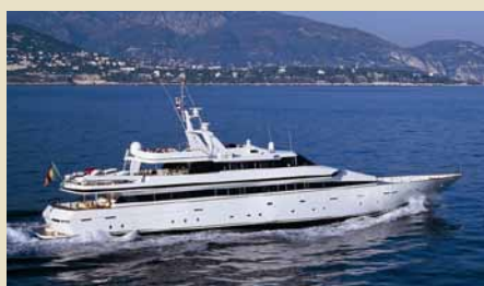
COSTA MAGNA 44.50 m 10/8 West Mediterranean 96,000/90,000 €/week