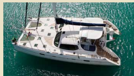
OCEAN'S SEVEN Privilege 585, Catamaran 17.82 m 2004/2007 Location: Turkey 595,000 €