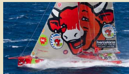
GROUPE BEL Open 60 IMOCA Class 18.28 m 2007 Location: South France 1,200,000 €