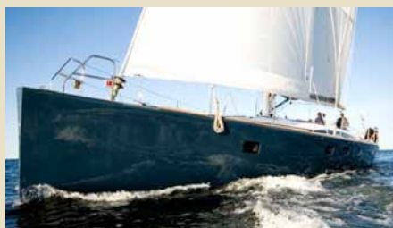
MITI Sunreef 60 18.20 m 2006 Location: Tunisia 590,000 €