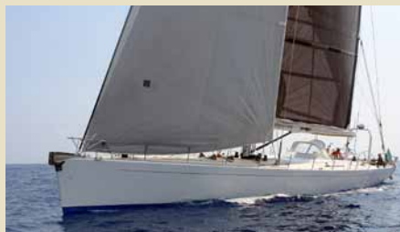
QUINTA SANTA MARIA Composite Cruising Sloop 27.42 m 2001 Location: Liguria, Italy 1,750,000 €