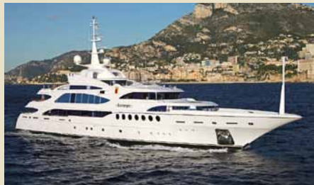
BISTANGO 62.00 m 12/14 West & East Mediterranean 350,000/329,000 €/week