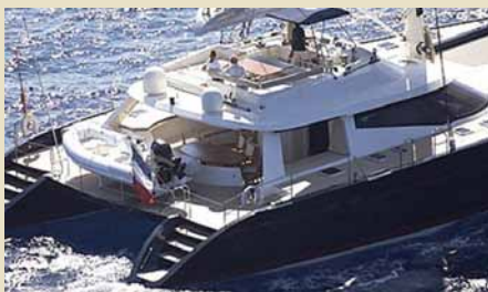
NAHEMA IV 21.95 m 8/3 West Mediterranean – Caribbean 32,000 29,000 €/week