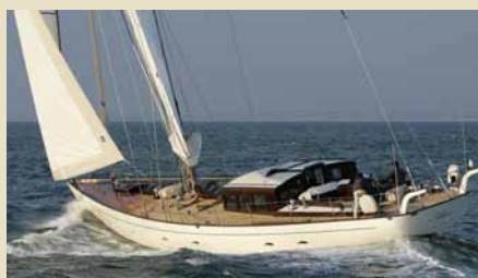
ATAO Neo-classic JFA Yachts 24.90m 2006 Location: South France 2,950,000 €