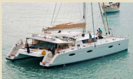
WORLD'S END 19.67 m 10/3 West Mediterranean – Caribbean 25,000/24,000 USD/week