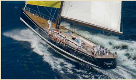
NEFERTITI 27.70 m 8/4 West Mediterranean – Caribbean Rate (high/low): 50,000 USD/week