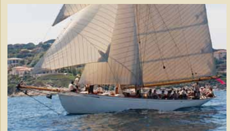
MOONBEAM III 31.00 m 6-12/2 West Mediterranean 42,000 €/week