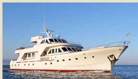
SPREZZATURA Classic Motor Yacht 30.30 m 1971/2013 Location: South France US$ 1,975,000