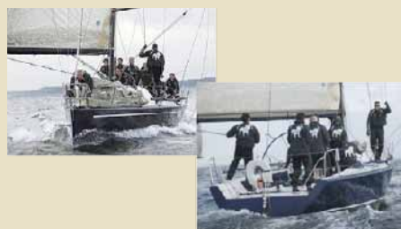
KATANGA Farr 40 12.41 m 2000 Location: Caribbean 110,000 USD