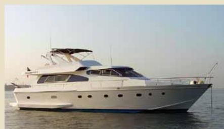
CELESTIAL Navarcantieri P 21 S 22.60 m 1997 Location: South France 325,000 €