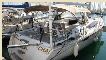
CHAI Jeanneau 57 17.78 m 2011 Location: South France 550,000 €