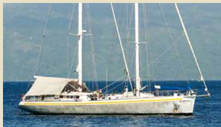
ANTSIVA Aluminium Centreboard Schooner 28.00 m 2004 Location: Indian Ocean 1,190,000 €