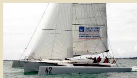
KRYSALID 42ft racing trimaran 12.70 m 2006 Location: West France 150,000 €