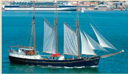
PRINCIPE PERFEITO 3 Mast Schooner 41.52 m 1943 Location: Portugal 1,650,000 €