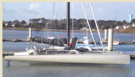
PARADOX Fast Cruising Trimaran 18.90 m 2010 Location: West USA 1,350,000 €