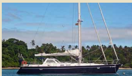
LACARABA Adams 52 16.00 m 1998 Location: South France 250,000 €