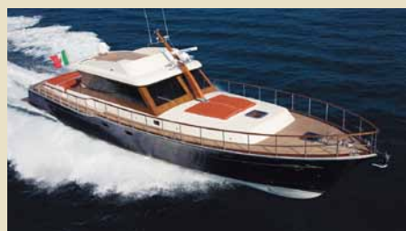
MATHIGO Morgan 70 21.24 m 2007 Location: South France 980,000 €