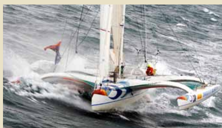
BRANEC Cruiser Racer Trimaran 15.24 m 1990 Location: West France 200,000 €