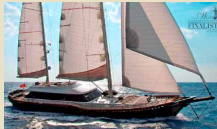
INFINITY 46.00 m 12/7 East Mediterranean 70,000/91,000 €/week