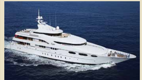
CAPRI 58.55 m 12/15 West Mediterranean 340,000/260,000 €/week