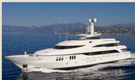
DIAMOND A 57.30 m 12/16 West Med. & Croatia 280,000/255,000 €/week