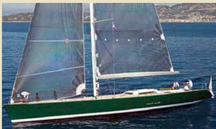
GENIE 24.00 m 6/3 West Mediterranean 30,000/25,000 €/week