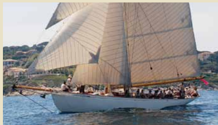
MOONBEAM OF FIFE III Gaff Cutter 31.00 m 1903 Location: South France 2,500,000 €