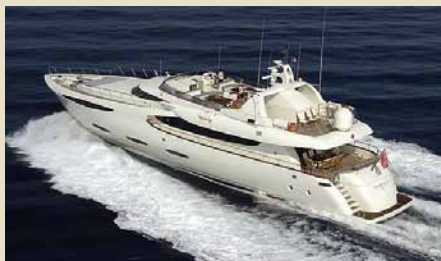
MABRUK III 35.00 m 10/6 West Mediterranean 65,000 €/week