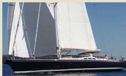
O7² - OCEAN SEVEN SQUARED 31.69 m 8/4 Caribbean 54,000 USD/week