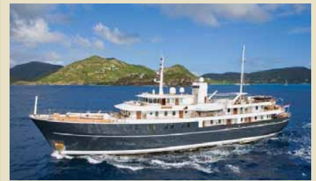
SHERAKHAN 69.95 m 26-36/19 West Med. & Croatia 350,000 €/week