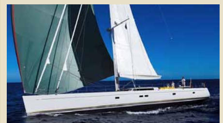
WHIMSY Custom Performance Sloop 23.98m 2005 South France/Malta 2,450,000 €