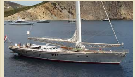
DWINGER 48.50 m 11/8 West Mediterranean 75,000/65,000 €/week