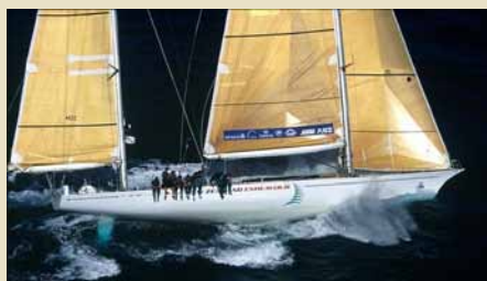
NEW ZEALAND ENDEAVOUR Racing yacht 25.73 m 1993 Location: Elba, Italy 220,000 €