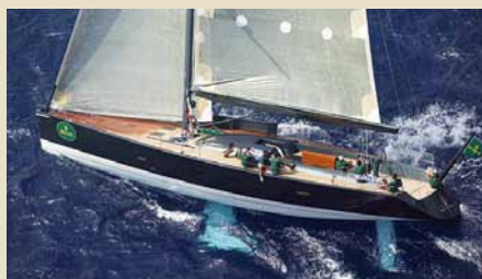
KALAO Maxi Dolphin 65 - 2 20.00 m 2003 Location: South France 1,100,000 €