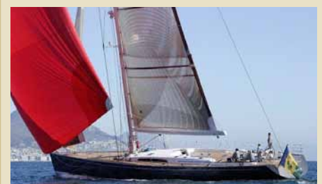
Mrs SEVEN 30.20 m 8/5 West/East Mediterranean – Caribbean 52,000/46,000 €/week