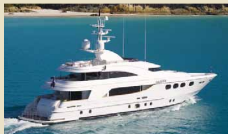
DE LISLE III 42.00 m 10/6 South Pacific, Australia, Fiji 125,000 USD/week