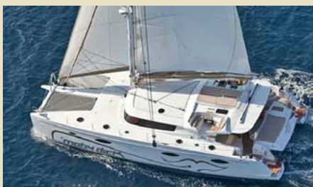
MOBY DICK 19.81 m 10/3 West Mediterranean – Caribbean 26,000/22,000 €/week