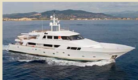
SENSEI 39.98 m 10/7 West Mediterranean 98,000/70,000 €/week