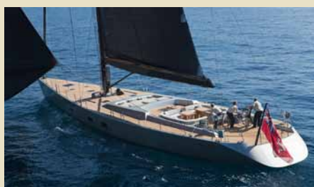
DARK SHADOW 30.45 m 6/5 West Mediterranean 50,000 €/week