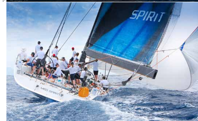
SW 94 WINDFALL