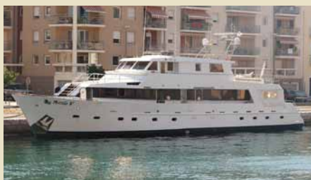
ATTILA Steel Motor Yacht 30.00 m 1989 Location: South France 350,000 €