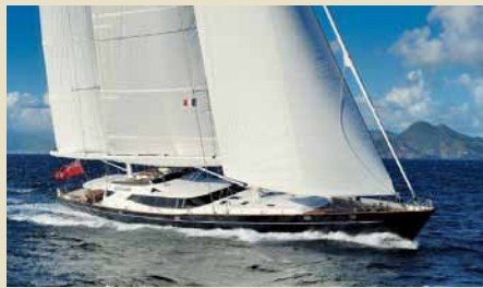
Name: DRUMBEAT Length: 53.00 m Guest/Crew: 11/10 Area: South Pacific – South East Asia Rate (high/low): 230,000 USD/week