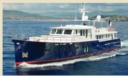
PAOLYRE 32.70 m 10/5 West Mediterranean 52,000/49,000 €/week