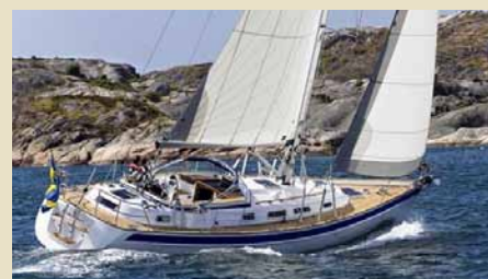
GRACILIA II HR 40 12.40 m 2006 Location: Turkey 2,950,000 SEK (approx. 340,000 €)