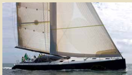
OURSON RAPIDE 60ft Multiplast Fast Sloop 18.28 m 2009 Location: Liguria, Italy 2,350,000 €