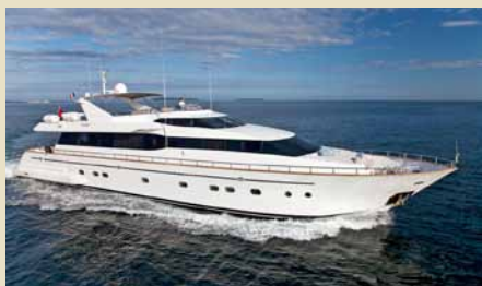
SYNERGY 30.70 m 10/5 West Mediterranean 52,500/45,500 €/week