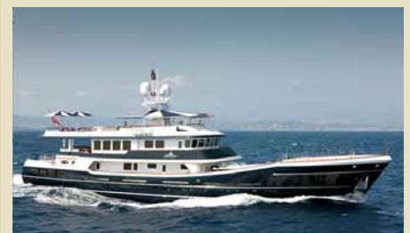
THE MERCY BOYS 49.00 m 12/11 West Mediterranean 115,000/99,000 €/week