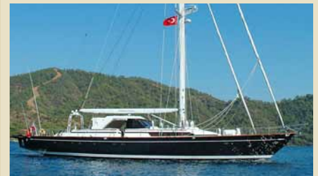
SOUTHERN CROSS Maxi 88 Sloop 29.70 m 1991/2004 Location: Turkey 1,350,000 €