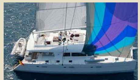
CROCODILE DADDY 18.90 m 8/3 West Mediterranean – Caribbean 26,000 €/week