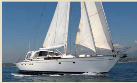
MOONLIGHT II OF LONDON 29.70 m 8/4 West Mediterranean 24,000/27,000 €/week