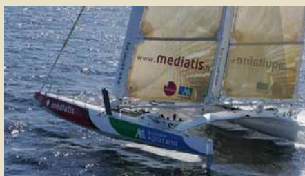
MEDIATIS Multihull "hydraplaneur" 18.28 m 2004 Location: West France 250,000 €