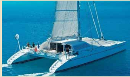
MAGIC CAT 25.00 m 8/4 East/West Mediterranean – Caribbean 35,000/30,000 €/week