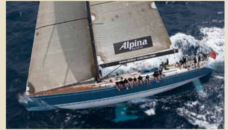
ALPINA 24.89 m 6/3 West Mediterranean 25,000 €/week