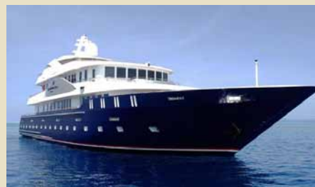
DHAAINKAN'BAA 40.00 m 14/18 Indian Ocean/Maldives 115,000/100,000 USD/week