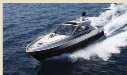
DELL ARTE 16.94 m 5/1 Seychelles 12,000/15,000 €/week