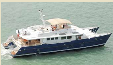
PELICANO Motor Catamaran 23.95 m 2005 Location: South France 1,250,000 €