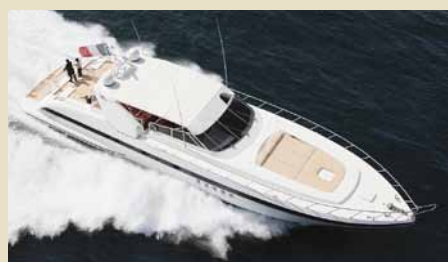
SILAOS 25.10 m 7-12/2 West Mediterranean 33,000/27,000 €/week