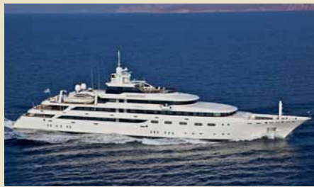
Name: O'MEGA Length: 82.00 m Guest/Crew: 32/30 Area: West Mediterranean Rate (high/low): 525,000 €/week