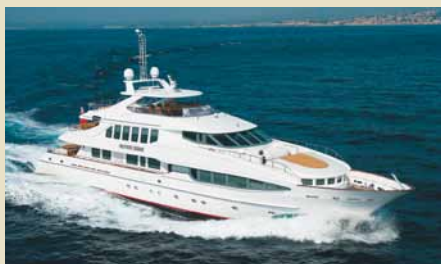
SEVEN SINS 41.30 m 10/7 Croatia, Greece 120,000 €/118,300 USD/week