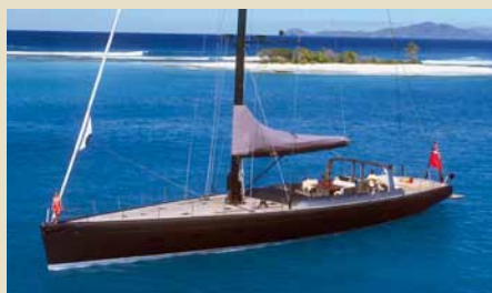
WALLY B 32.72 m 6/5 East/West Mediterranean 56,500/45,000 €/week