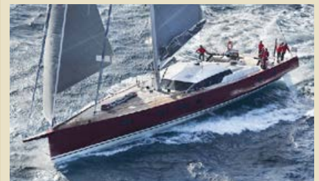
NOMAD IV 30.48 m 12/4 East/West Mediterranean 65,000/57,000 €/week