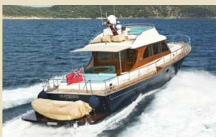
MATHIGO MORGAN 70 21.00 m 2007 Location: Spain 950,000 €