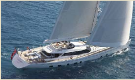
TWILIGHT 38.10 m 8/6 East/West Mediterranean 100,000/90,000 €/week