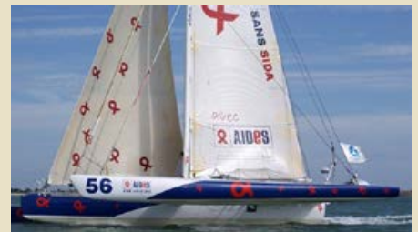
TRIBULATION Multi 50 Racing Trimaran 15.24 m 1987/2012 Location: West France 160,000 €