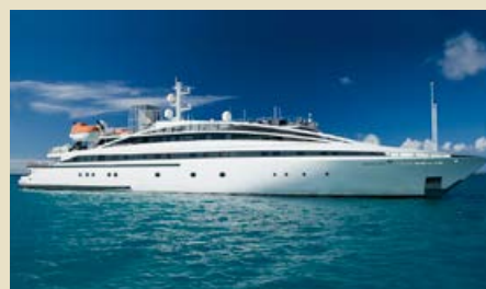
RM ELEGANT 72.40 m 30/31 East/West Mediterranean 455,000 €/week