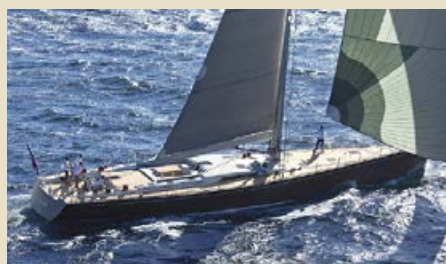
WINDFALL 28.64 m 8/4 Wint.: Caribbean, Sum.: West Mediterranean 45,000/40,000 €/week