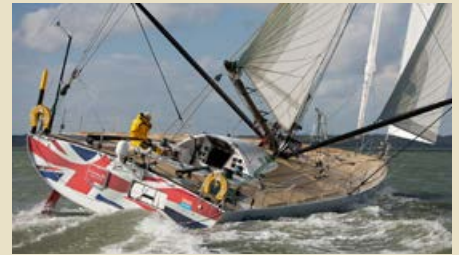
GREY POWER Open 60 ECO Class 18.28 m 1997 Location: South England 190,000 €