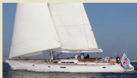
DJANGO TOO Cutter Rigged Sloop 25.00m 1991 Location: South France 990,000 €