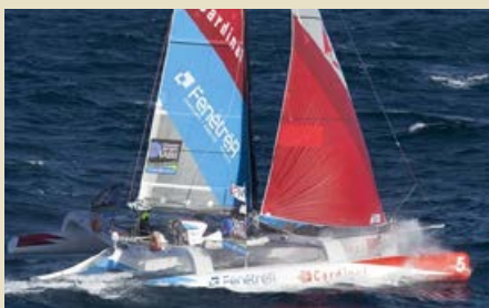
TRILOGIC Multi 50 Racing Trimaran 15.24 m 2003 Location: Canary Islands 125,000 €