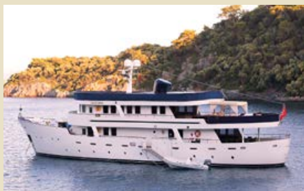
DONA DEL MARE Luxury Motor Yacht 34.10 m 2006 Location: Croatia 2,200,000 €