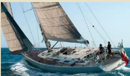
GRANDE ORAZIO Starkel 60 18.31 m 2006 Location: Italy 550,000 €