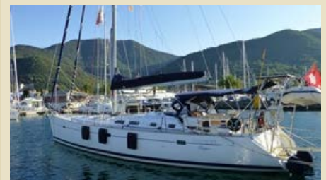
EXPLORA OCEANIS 473 CP 14.30 m 2005 Location: South France 149,000 €