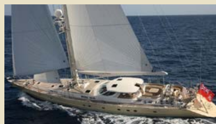
CELANDINE Jongert 2900 M 29.70 m 1993 Location: Turkey Exhibited at the Palma Superyacht show 2016 2,190,000 €