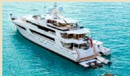
AQUAVITA 49.99 m 12/11 Central America, California, Caribbean 295,000 USD/week