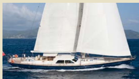
AVENTURA Danish Yacht & Holland Jachtbouw Sloop 33.24 m 2005 Location: St Martin US$ 2,990,000