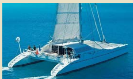
MAGIC CAT 25.00 m 8/4 West Mediterranean 35,000 €/week