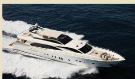
LADY EMMA 34.10 m 8/4 West Mediterranean 78,000/72,000 €/week