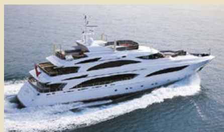
DIANE 43.00 m 10/8 West Mediterranean 154,000/133,000 €/week