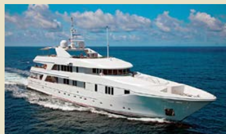
RHINO 46.94 m 10/10 West Mediterranean 160,000/150,000 €/week