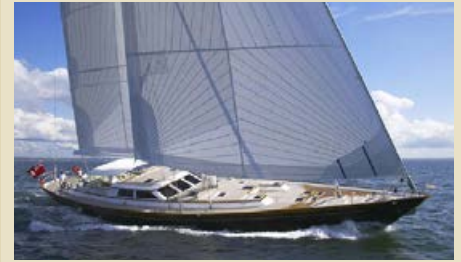
WHISPER 35.36 m 6/5 Wint.: Caribbean, Sum.: New England 65,000/60,000 USD/week