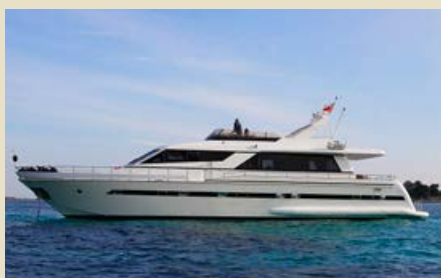
ROA Falcon 73 23.55 m 1987 Location: French Polynesia 195,000 €