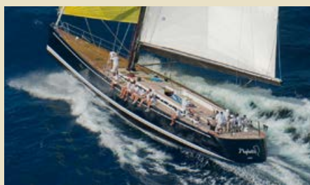
NEFERTITI 27.70 m 8/4 West Mediterranean 49,000/44,000 €/week