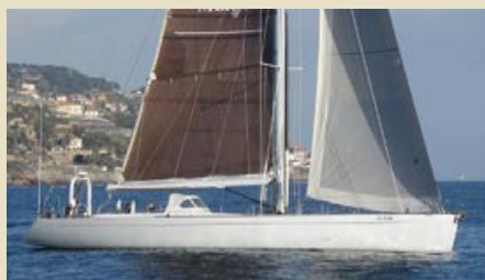
QUINTA SANTA MARIA Fast Sloop 27.42 m 2002 Location: Italy 1,290,000 €