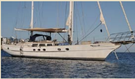
TARA BAY Scorpio 72 21.60 m 1991 Location: South France 480,000 €