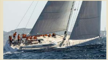
KORENOC VISMARA 78' Carbon 24.00 m 2003 Location: South France 980,000 €