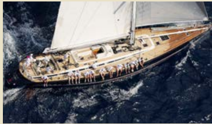
LA FORZA DEL DESTINO Swan 77 23.44 m 1992 Location: St Marteen US$ 1,300,000