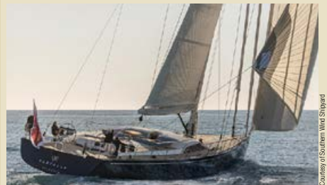
FARFALLA 31.78 m 8/5 South Pacific 65,000 €/week