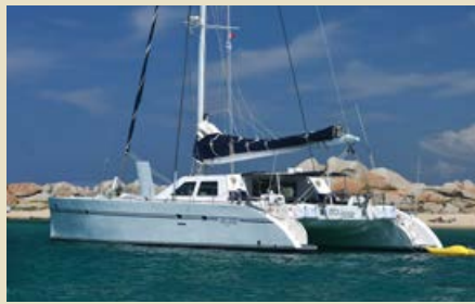
ABYSSE Nautitech 64 19.50 m 1994 Location: St Marteen 335,000 €