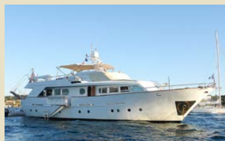
KIA ORA C 78ft Classic Benetti 22.86 m 1981 Location: South France 1,100,000 €