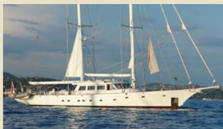
QUEEN NEFERTITI Classic Yacht 41.58 m 1986/2005 Location: South France 2,490,000 €