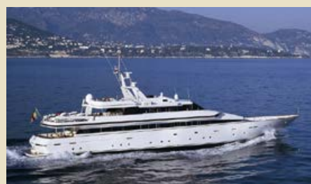
COSTA MAGNA 44.50 m 10/9 West Mediterranean 96,000/90,000 €/week