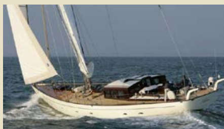
ATAO Neo-classic JFA Yachts 24.90m 2005 Location: Caribbean 1,990,000 €