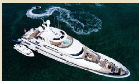
W 39.62 m 10/7 Bahamas 140,000 USD/week