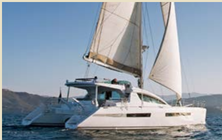
ETANA Privilege 615 18.50 m 2007 Location: South France 850,000 €