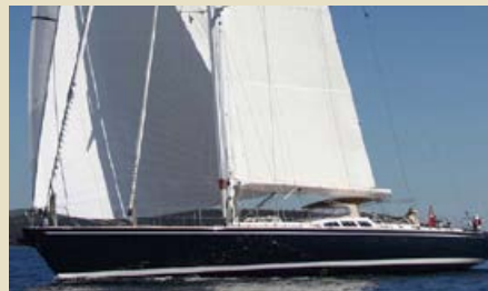
O7² - OCEANS SEVEN SQUARED 31.80 m 8/4 Wint.: Caribbean, Sum.: South Pacific 49,000 USD/week