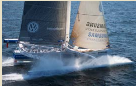
SJÖVILLAN Orma 60 Trimaran 18.28 m 1998 Location: Sweden 400,000 €