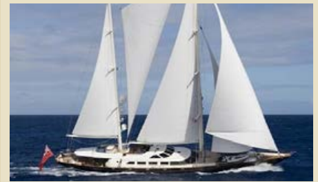
ANTARA 46.00 m 10/8 East/West Mediterranean 120,000 €/week