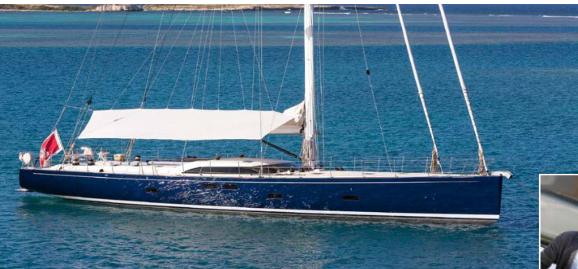
SW 102RS Farfalla