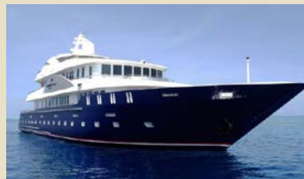
DHAAINKAN'BAA 40.00 m 14/20 Maldives 105,000/90,000 USD/week