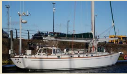
FLY Custom Aero-rig Cruiser 21.34 m 1991 Location: West Scotland 375,000 GBP