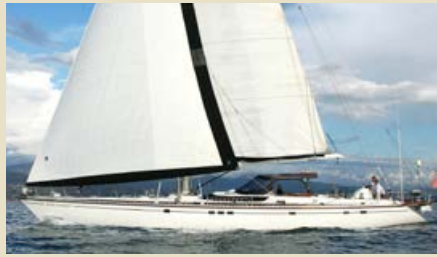
WILD SALMON Locwind 80 24.00m 1997 Location: South France 780,000 €