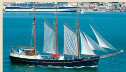
PRINCIPE PERFEITO 3 Mast Schooner 41.52 m 1943 Location: Portugal 1,650,000 €