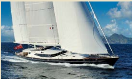
Name: DRUMBEAT Length: 53.00 m Guest/Crew: 11/10 Area: Northern Europe + Arctic. Rate (high/low): 190,000 €/week