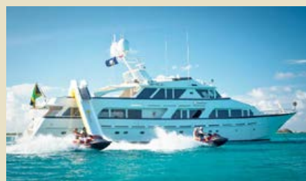
SUNSHINE 37.80 m 12/7 Bahamas 75,000 USD/week