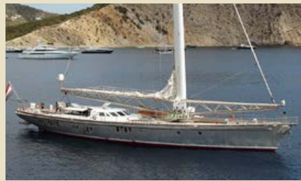
DWINGER 48.50 m 11/7 Northern Europe + Arctic 75,000 €/week