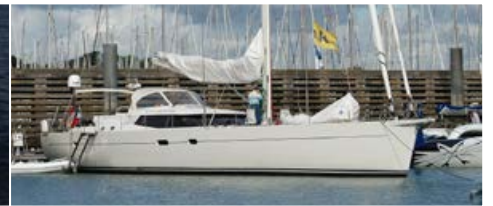
Beniguet, Berret-Racoupeau design, is a sleek aluminium sloop with a lifting keel. She had a major refit in 2014.