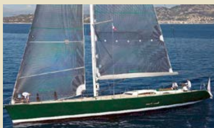
GENIE 24.00 m 6/3 West Mediterranean 25,000 €/week