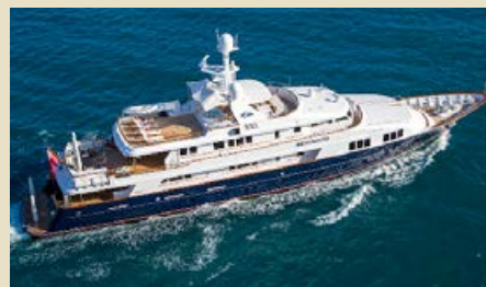
BROADWATER 49.68 m 10/11 East/West Mediterranean 210,000/185,000 €/week