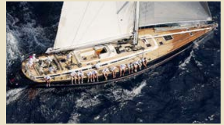
LA FORZA DEL DESTINO Swan 77 23.44 m 1992 Location: USA/St Marteen US$ 1,500,000