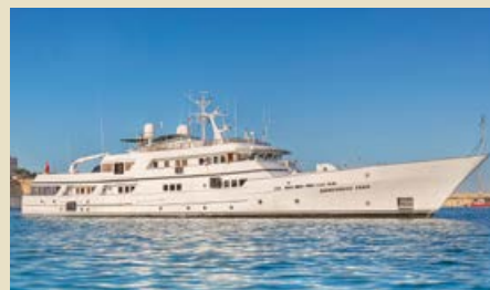
SANSSOUCI STAR 53.50 m 12/8 Scandinavia & Artic 90,000/70,000 €/week