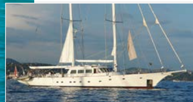
Queen Nefertiti, p. 7

Simply click on photos to get more information