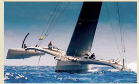
PARADOX 2.0 Racing/Cruising Trimaran 18.90 m 2010 Location: Mediterranean Sea 1,190,000 €