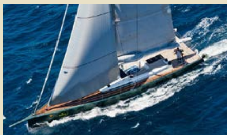
SHAMLOP 22.40 m 6/2 Wint.: Caribbean, Sum.: West Mediterranean 22,000/20,000 €/week