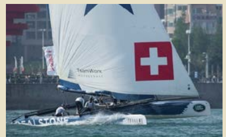
REALTEAM Extreme 40 Racing Catamaran 12.19 m 2009 Location: Switzerland 150,000 €