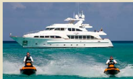
CAMARINA ROYALE 35.05 m 10/6 Bahamas 79,000 USD/week