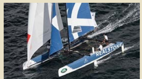
REALTEAM Extreme 40 Racing Catamaran 12.19 m 2009 Location: Switzerland 150,000 €