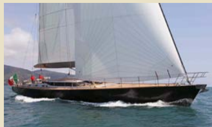
XNOI 30.65 m 10/4 West Mediterranean 60,000/55,000 €/week