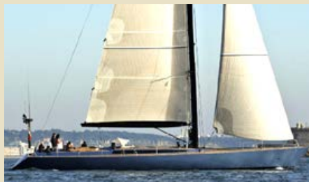
WALLY ONE 25.30 m 8/3 Wint.: Other destinations, Sum.: West Mediterranean 24,000/18,000 €/week