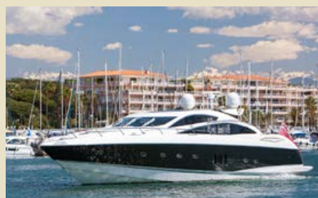
GECKO Sunseeker - Predator 82 24.71 m 2006 Location: South France 750,000 GBP