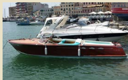
RAMY II RIO - Colarado Super 8.45 m 1974 Location: Italy 195,000 €