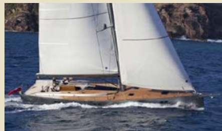
AEGIR 25.10 m 7/3 West Mediterranean 32,000/27,000 €/week