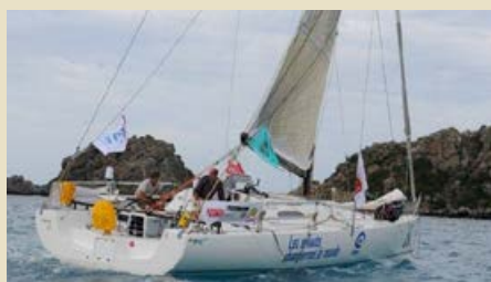
JUMPA LAGI Pogo 40 12.18 m 2009 Location: North West France 160,000 €