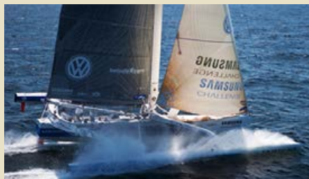
SJÖVILLAN Orma 60 Trimaran 18.28 m 1998 Location: Sweden 400,000 €