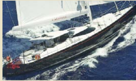
BLISS 37.00 m 10/5 South East Asia 95,000/89,000 USD/week