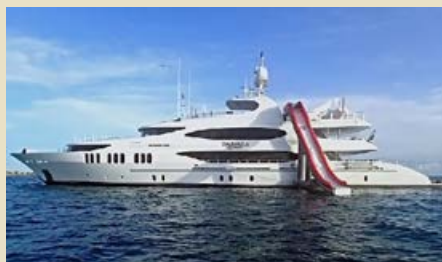
AMARULA SUN 49.99 m 12/9 Bahamas, Florida and Caribbean 230,000/195,000 USD/week