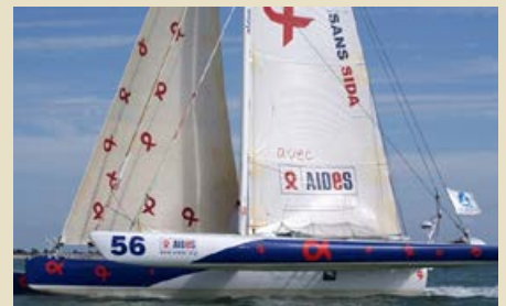
TRIBULATION Multi 50 Racing Trimaran 15.24 m 1987/2012 Location: West France 160,000 €