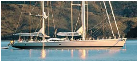
MARI-CHA III is regarded as one of the fastest 'super sailors' afloat and still turns heads at any anchorage.