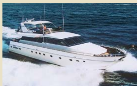
AIGUE MARINE Canados 70 22.05 m 1992 Location: South France 250,000 €