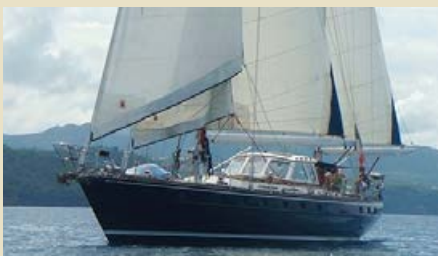
OKIO Nordia 62 ketch 19.79 m 1982/2014 Location: Caribbean 340,000 €