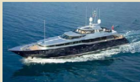
POLLY 41.15 m 9/7 Bahamas 89,000 USD/week