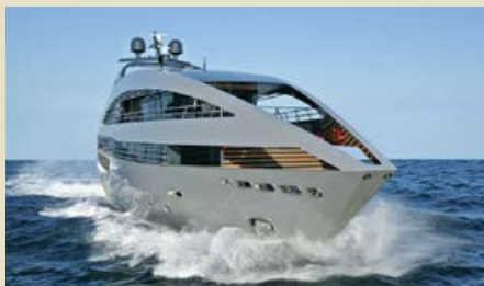
OCEAN SAPPHIRE 41.00 m 12/7 West & East Mediterranean 130,000/115,000 €/week