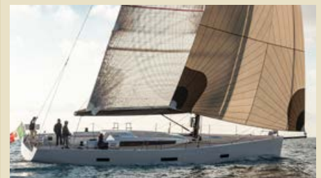
DEMO BOAT ICE 62 with 2 years warranty 18.82 m 2015 Location: Italy 1,650,000 €