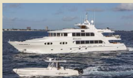
EXCELLENCE 45.72 m 10/9 Winter: Bahamas, Florida 145,000 USD/week