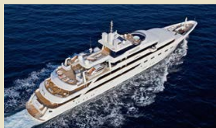
Name: O'MEGA Length: 82.50 m Guest/Crew: 30/30 Area: East/West Mediterranean Winter rate (high/low): 525,000 €/week