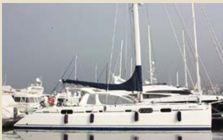
RODEO Catana 582 17.50 m 2005 Location: Turkey 750,000 €