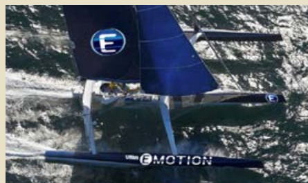
ULTIM EMOTION 23.38 m 12/3 West Mediterranean 57,000/50,000 €/week