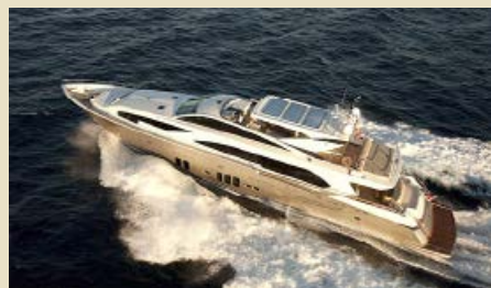
MAYAMA 37.00 m 10/6 West Mediterranean - Riviera/Corsica/Sardinia 99,000/85,000 €/week