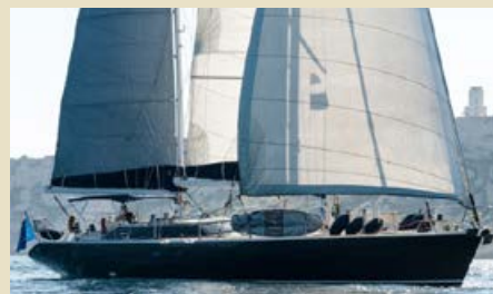
ENTHALPIA 21.60 m 8/3 East/West Mediterranean 17,500/15,000 €/week