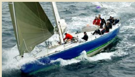
ESPRIT D'EQUIPE II Aluminium cruiser/racer 18.28 m 1982 Location: South France 150,000 €