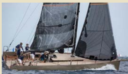
BLACK LEGEND II Code 1 12.00 m 2014 Location: South France 550,000 €