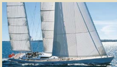
MARI-CHA III 147' Luxury Ketch 44.72 m 1997 Location: Palma, Spain Exhibited at the Palma Superyacht show 2016 US$ 8,950,000