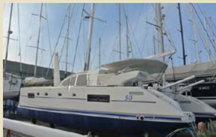
NOW Catana 50 16.00 m 2009 Location: Italy 660,000 €