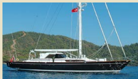
SOUTHERN CROSS Maxi 88 Sloop 29.70 m 1991/2004 Location: Turkey 990,000 €