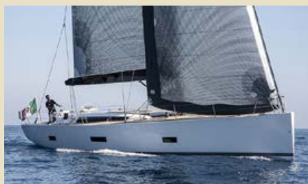
CANTELOUP VIII 18.82 m 6/2 West Mediterranean 21,000/19,000 €/week