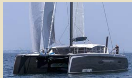
NO LIMIT 18.46 m 6-8/2 Wint.: Caribbean, Sum.: West Mediterranean 17,500/15,000 €/week