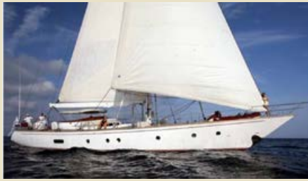
MALIZIA Perini Navi 24.22 m 1989 Location: Sardinia, Italy 950,000 €