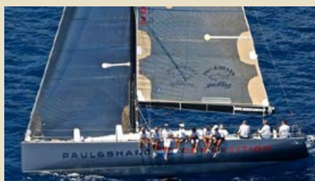
SEAWONDER 46ft Racing Sailing Yacht 14.00 m 2006 Location: Italy 260,000 €