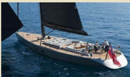
DARK SHADOW 30.45 m 6/5 Wint.: Caribbean, Sum.: West Mediterranean 45,000/40,000 €/week