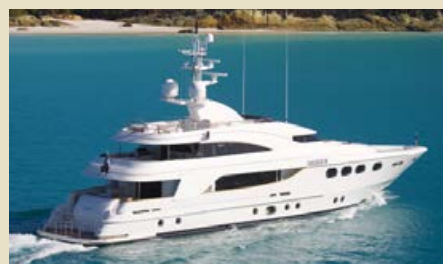
DE LISLE III 42.00 m 9/7 Australia, Fiji 125,000 USD/week