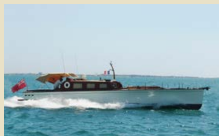
ALLEGIANCE Réplique C&N 1925 15.00 m 2004 Location: South France 195,000 €