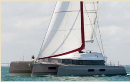
STERGANN II Neel 65 19.80 m 2015 Location: South France 2,200,000 €