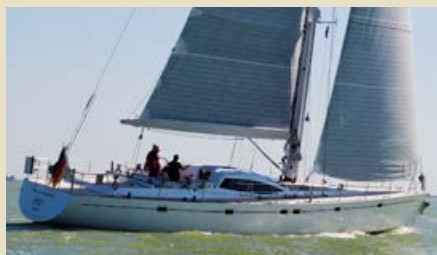
SPOCK FARR 585 CC Fast Cruiser 18.10 m 2009 Location: Palma, Spain Present at the Palma Superyacht show 2016 865,000 €