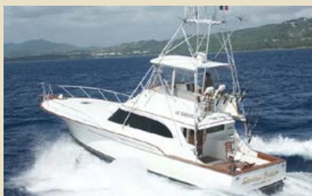
LIMITED EDITION Davis 47' Fly SF0 14.30 m 1989/2009 Location: Caribbean 220,000 €