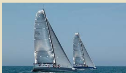
AQUARELLE 1 & 2 Frers 44 13.70 m 2005 Location: South France 140,000 €