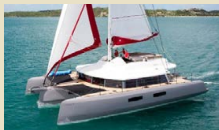
STERGANN II 19.80 m 8/3 West Mediterranean 35,000/30,000 €/week