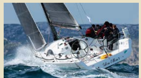
GLEN ELLEN V A 40 11.98 m 2008 Location: South France 120,000 €