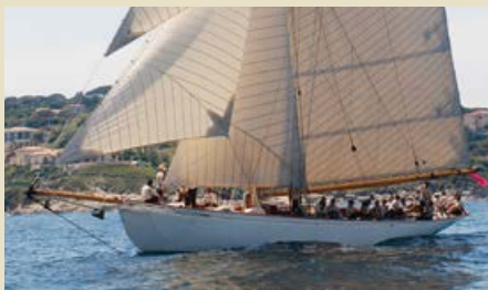
MOONBEAM III 31.00 m 6-12/2 West Mediterranean 35,000 €/week