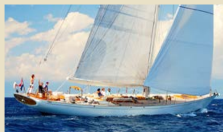
WHITEFIN 27.43 m 8/4 West & East Mediterranean 28,500/25,500 €/week