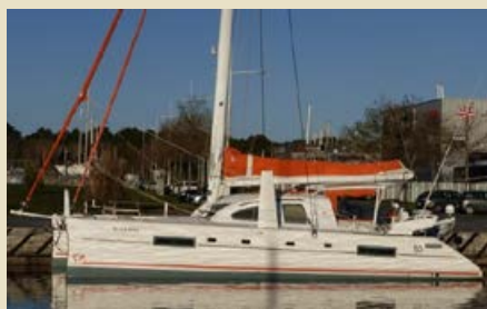
MARANA IV Catana 50 15.20 m 2010 Location: South France 788,000 €