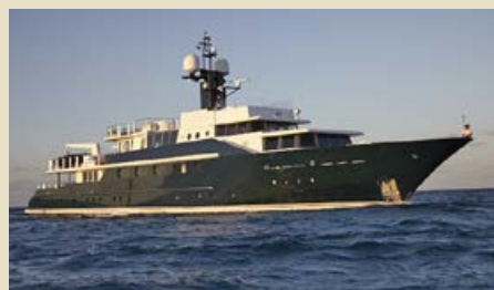
HIGHLANDER 49.45 m 12/11 East/West Mediterranean 195,000/150,000 USD/week