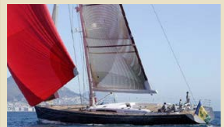
MRS SEVEN 30.20 m 8/4 East Mediterranean 52,000/46,000 €/week