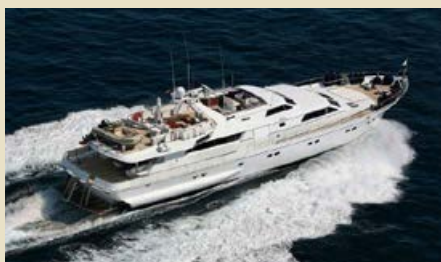
ANTISAN 33.00 m 11/6 West Mediterranean 56,000/49,000 €/week