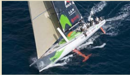
GREEN DRAGON Volvo 70 21.50 m 2007 Location: Caribbean 390,000 €