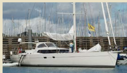
BENIGUET Garcia 86 QR 26.33 m 2005 Location: South France Exhibited at the Palma Superyacht show 2016 1,950,000 €