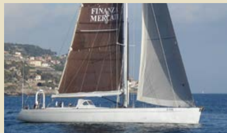
QUINTA SANTA MARIA 27.42 m 8/4 West Mediterranean 26,000/24,000 €/week