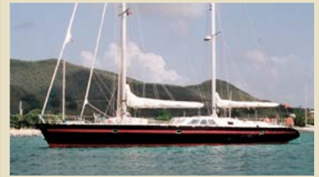
JAIPUR Ketch Dérive moderne 21.00 m 1991 Location: South France 720,000 €