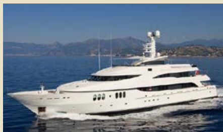
DIAMOND A 57.28 m 12/15 Please Enquire 300,000/270,000 €/week