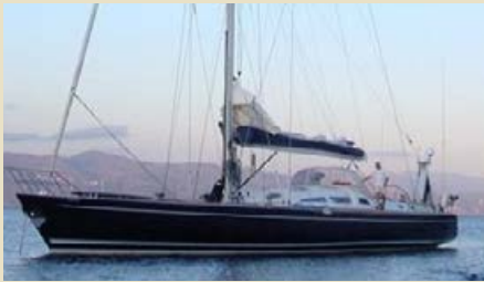
L'ILE NUE Techni Marine Sloop 23.66m 1988 Location: South France 590,000 €