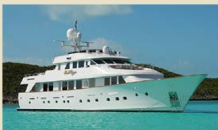
SWEET ESCAPE 39.62 m 10/8 Bahamas/New England 95,000 USD/week