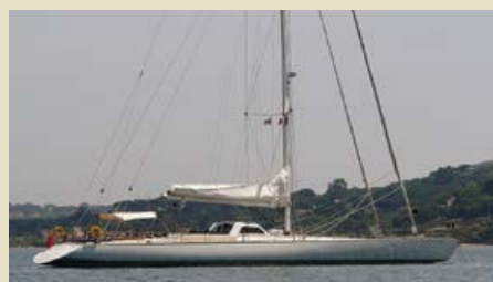
AMAALTA Pleasure Yacht 26.10 m 1981 Location: South France 290,000 €