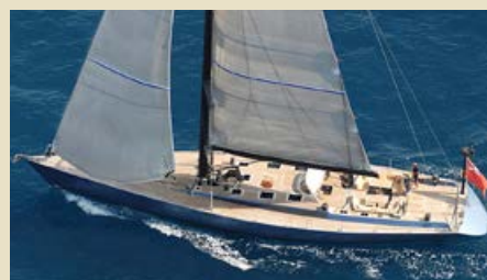
WALLY ONE Wally 83 25.30 m 1991 Location: Portugal 1,350,000 €