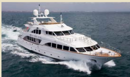
KAI 36.58 m 12/7 West Mediterranean - Riviera/Corsica/Sardinia 110,000/100,000 €/week