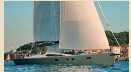
ICHTUS Futuna 70 21.75 m 2010 Location: South France 690,000 €