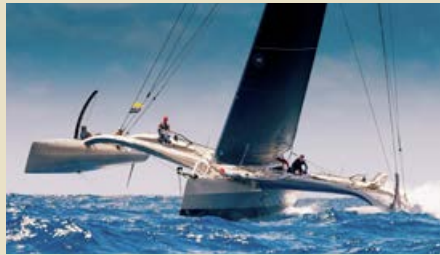
PARADOX 2.0 Fast racing/cruising Trimaran 18.90 m 2010 Location: Mediterranean Sea 1.190,000 €