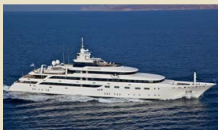
TITANIA 73.00 m 12/20 East/West Mediterranean 600,000/490,000 €/week