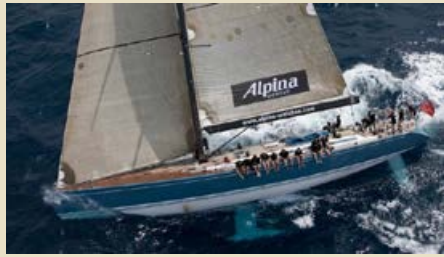
ALPINA Swan 82 24.89m 2001 Location: South France 1,700,000 €