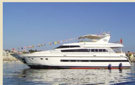
ABOU MAYA Monte Fino 83 25.29 m 1994 Location: Morocco 500,000 €