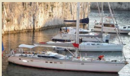
ARLEQUIN Dynamique 62 19.20 m 1997 Location: South France 300,000 €