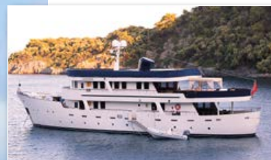
Dona del Mare, p. 6