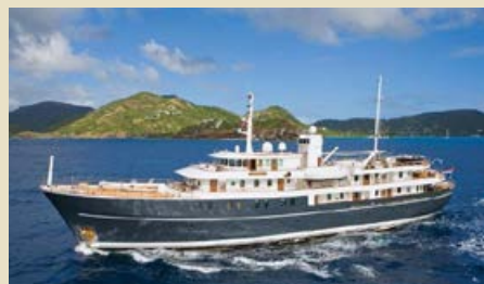
SHERAKHAN 69.65 m 26-28/19 East/West Mediterranean 425,000/385,000 €/week