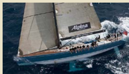
ALPINA Swan 82 24.89m 2001/2011 Location: South France 1,700,000 €