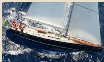
SOUTHERN STAR 23.95 m 6/3 West Mediterranean 25,000 €/week