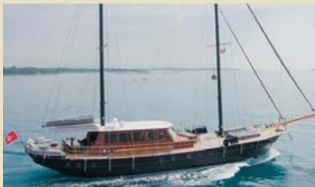
VITA DOLCE 32.00 m 10/4 West Mediterranean 23,500/19,800 €/week