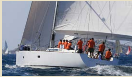
KORENOC VISMARA 78' Carbon 24.00 m 2003 Location: South France 980,000 €