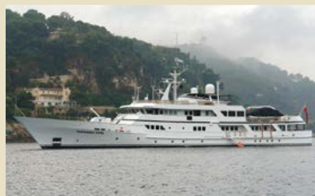
SANSSOUICI STAR Steel/Aluminium Large Motor Yacht 53.53 m 1982 Location: Baltic Sea 5,900,000 €