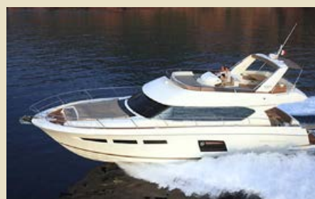
DEJA VU Prestige 620 19.50 m 2013 Location: South France 895,000 €