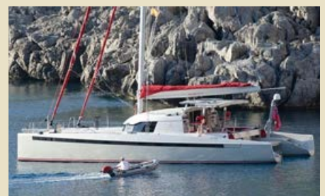
AUF DER FREIHEIT Swiss Cat 50 18.00 m 2010 Location: South France 930,000 €