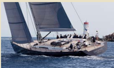
CAPE ARROW 30.20 m 8/4 Wint.: Caribbean, Sum.: West Mediterranean 52,000/47,000 €/week