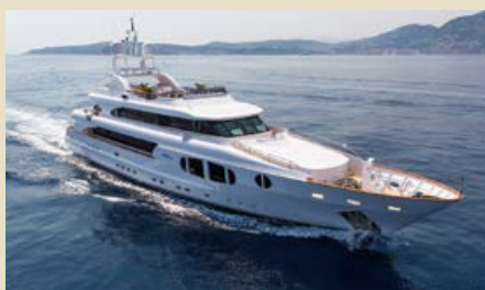
BINA 42.65 m 12/9 West Mediterranean - Riviera/Corsica/Sardinia 175,000/150,000 €/week