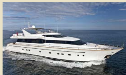
SYNERGY 30.70 m 11/5 West Mediterranean 52,500/45,500 €/week