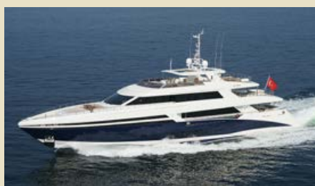
TATIANA 44.88 m 12/9 West & East Mediterranean 165,000/150,000 €/week