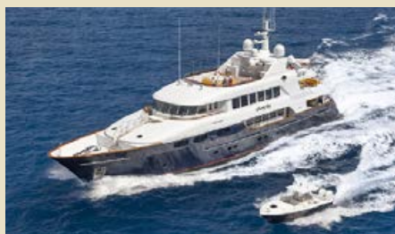
COCKTAILS 47.85 m 11/9 Caribbean, Bahamas, Florida, New England 150,000 USD/week