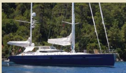
ROSINANTE OF NOTIKA Mega Sailing Yacht 32.60 m 1998/2013 Location: Turkey US$ 1,395,000