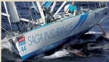
SAGA - EX FILA 60 Open IMOCA 18,28 m 1997 450 000 € 260 000 €