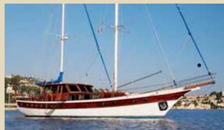
GARANCE Steel Ketch 28,00 m 1996-2008 10 guests 890 000 € 590 000 €