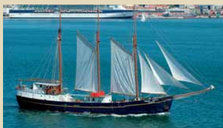
PRINCIPE PERFEITO 3 mast Schooner 41,52 m 1943 200 guests 1 650 000 €