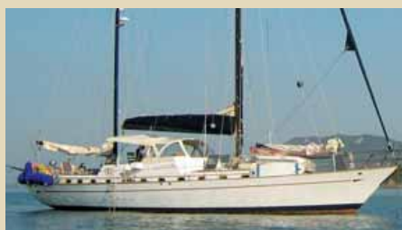
SAINT AUBERT 3 Huntingford, centre board ketch 21,30 m 1985 8 guests 450 000 € 300 000 €