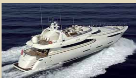
MY MABRUK III 35.00 m 10-12/6-7 French riviera 70 000 - 77 000 €/week