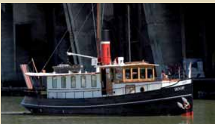
HOOP Classic Tug 17,50 m 1907 4 guests 495 000 €