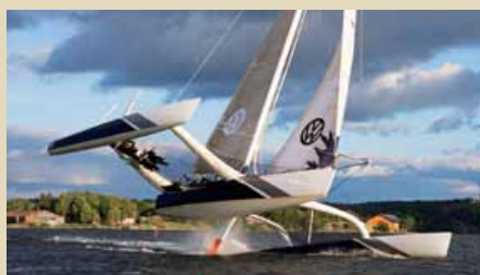
HIQ Trimaran ORMA 60ft 18,28 m 1988 300 000 € 300 000 €