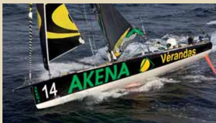
AKENA 60 Open IMOCA 18,28 m 1998 490 000 €