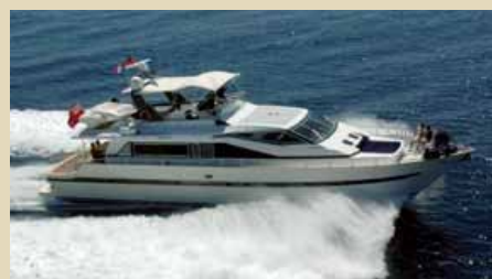
APPASSIONATA Azimut 76 23,16 m 1989 8 guests 700 000 € 550 000 €