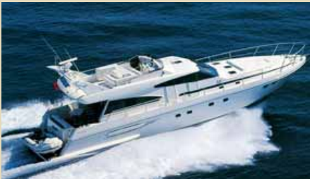
FIDJI III Guy Couach 1850 18,55 m 2000 4 guests 720 000 €