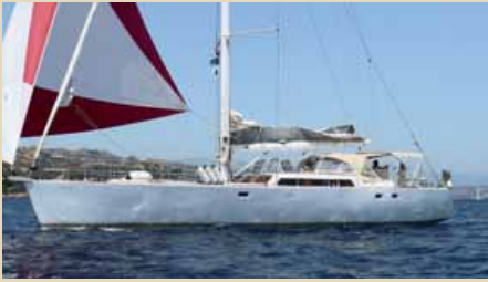
NAUSICAA Sloop aluminium 66ft 20,00 m 2006 10 guests 770 000 €