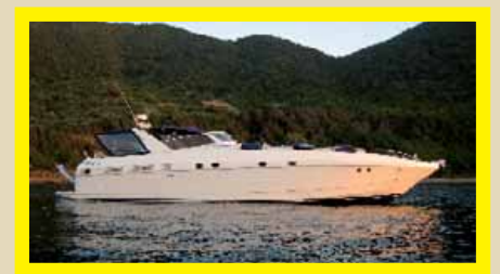
THEO Technomarine 55 15,00 m 1988/2000 4 guests 220 000 €