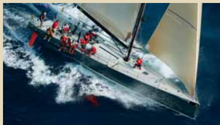
SOLUNE 60 Open 18,28 m 2003 500 000 € 300 000 €