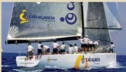
EX CAIXA GALICIA B&C 52 15,50 m 2001 270 000 € 225 000 €