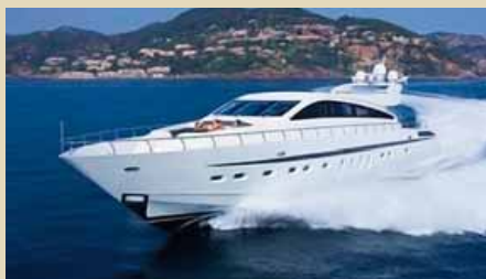
FRIDAY Leopard 102 31,00 m 2007 8 guests Price on Application