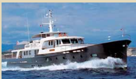
MY LEPANTE 33.00 m 10/4 West Mediterranean 45 000 - 50 000 US$/week