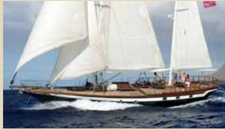
BLACK JACK Van de Stadt ketch 20,00 m 1987 12 guests 790 000 €