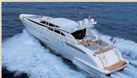
PURE WHITE Leopard 34 34,00 m 2007 8 guests ? ??? ??? €