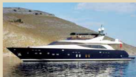
BJORG II Guy Couach 2800 LR 28,00 m 2002 8 guests - UNDER OFFER - 3 150 000 € 2 500 000 €