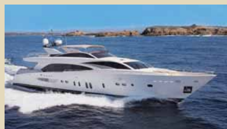
MY LADY EMMA 34.00m 8/4 South of France 70 000 - 84 000 €/Week