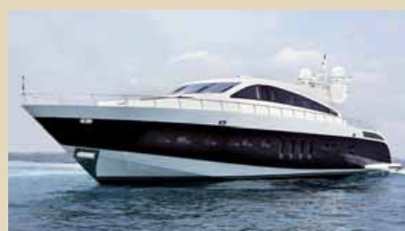
FRIDAY 31.00 m 8/22 222222 35 500 - 44 000 €/Week