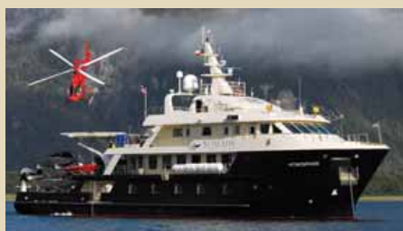
MY ATMOSPHERE 45.70 m 10/9-10 Patagonia 209 000 - 250 800 US$/week