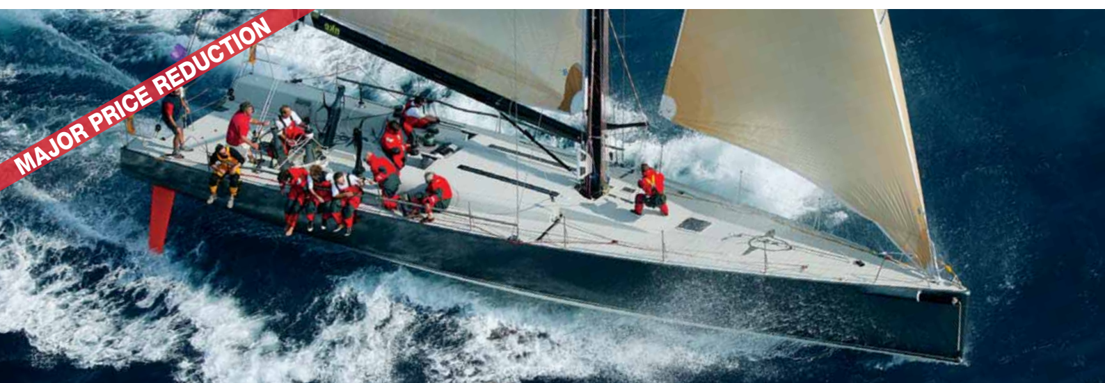
RORC Yacht Of The Year - 60ft "SOLUNE" 2003 2006 saw an incredible campaign once again: 1st RORC Allan Paul and Stradivarius Season Trophies – 2nd RORC all classes.