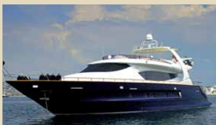
MY MABRUK II 27.00 m 8/2-4 French Riviera 42 000 €/week