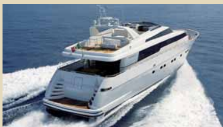
EX DANCING MILLY San Lorenzo 88 26,75 m 2002 7 guests 3 500 000 € 3 000 000 €