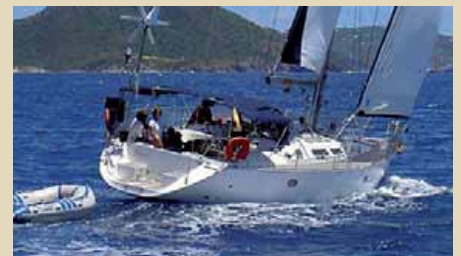
SAHONA Sun Odyssey 51 15,35 m 1996 8 guests 165 000 €