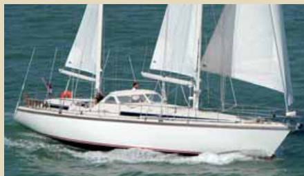
SILFRANIA Super Maramu 15,97 m 1991 6 guests 235 000 € 200 000 €