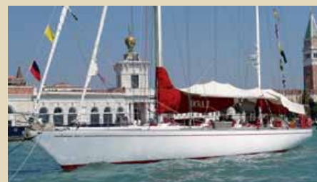
IKRA II Presle 72 21,95 m 1980 6 guests 575 000 €