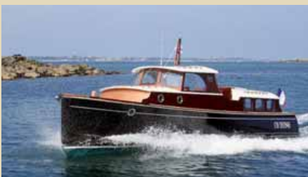
LOCH LOMOND Classic Tender 9,98 m 2007 12 passengers 200 000 €