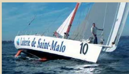
SPIRIT OF RACE 50 ft Open 15,24 m 1999 120 000 € 110 000 €