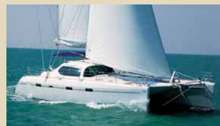
Catamaran OCEAN'S SEVEN 17.82 m 8/2 Mediterranean 17 000 - 20 000 €/week