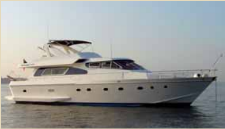
CELESTIAL Navarcantieri P 21 S 22,60 m 1997 8 guests 850 000 € 750 000 €