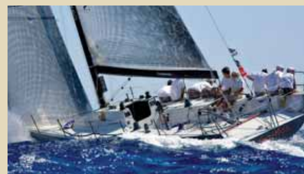
NEAR MISS GP 42 12,80 m 2008 500 000 €