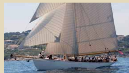
SY MOONBEAM OF FIFE 31.00 m 6/6 French Riviera 35 000 - 35 000 €/week