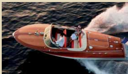
CAPSULE II Riva Ariston n° 805 6,80 m 1967-2005 5 guests 110 000 € 80 000 €