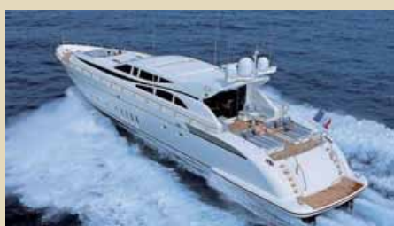
PURE WHITE 34.00 m 8/22 222222 35 500 - 44 000 €/Week