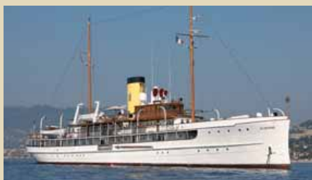
SS DELPHINE 78.65 m 26-28/24-27 South of France 40 000 - 60 000 €/day