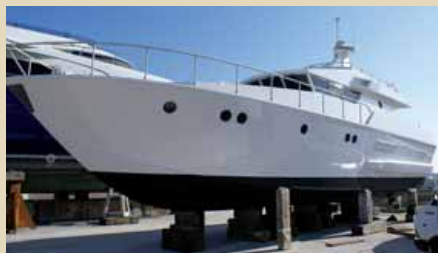
MISTAKE I San Lorenzo 16 16,20 m 1976-2006 6 guests - UNDER OFFER - 110 000 €