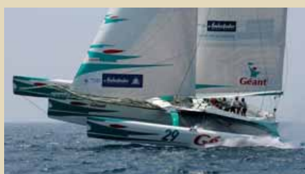
GEANT Trimaran ORMA 18,28 m 2002 - UNDER OFFER - 800 000 €