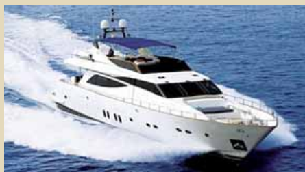
YIALOUSA Guy Couach 2800 28,00 m 2001 8 guests 2 000 000 €