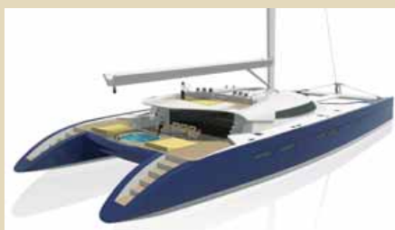
NAHEMA 120ft Catamaran 35,00 m Under construction 8 guests Price On Application