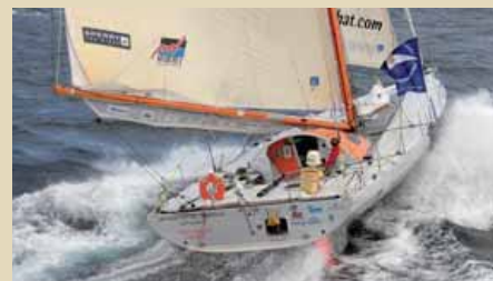
ETOILE AUSTRALE 50 ft Open 15,24 m 1996 240 000 € 190 000 €