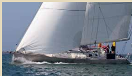
NORA Albatros 50 15,20 m 2006 4 guests 150 000 €