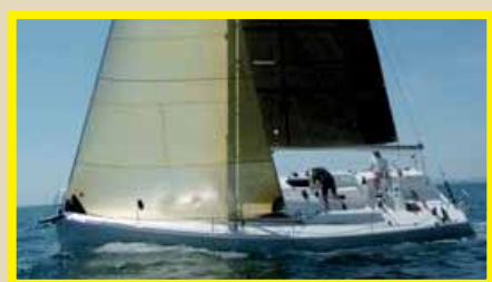
MISTER SWING A 40 11,90 m 2004 99 500 € 95 000 €