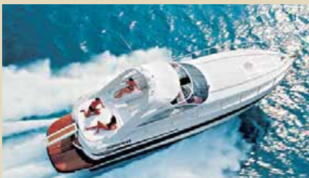
SUANE Pershing 45 14,20 m 1999 4 guests 330 000 € 220 000 €