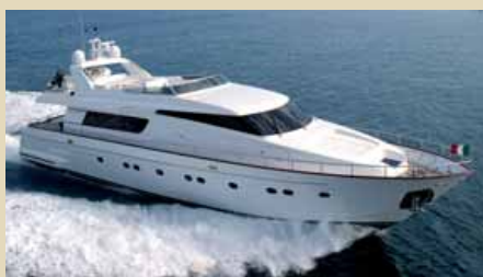
SL 82 San Lorenzo 82 23,98 m 2003 8 guests 2 350 000 € 2 200 000 €