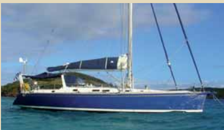
BAKEA Alliage 50 15,25 m 2005 8 guests 450 000 € 300 000 €