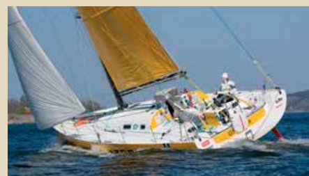
LA DAME DU VEILLON Pogo 40 12,18 m 2005/2006 190 000 € 170 000 €