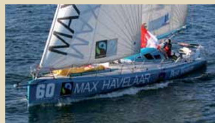
MAX HAVELAAR 60 Open IMOCA 18,28 m 1992 175 000 €