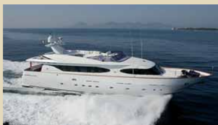
MY TALILA 29.00 m 8/4 Based in Monaco all year 35 500 - 44 000 €/Week