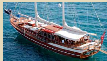
SAGAFO A Turkish Ketch 30,00 m 2008 12 guests 1 500 000 €