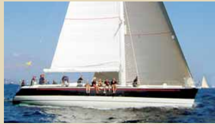
FARTWO II X 562 17,23 m 2001 6 guests 880 000 € 575 000 €