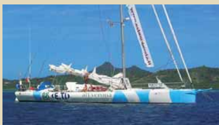
MOANA 60 Open 18,28 m 1992 200 000 € 100 000 €