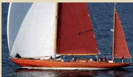
AGNETA Classic Yawl 25,03 m 1950 6 guests 1 700 000 €