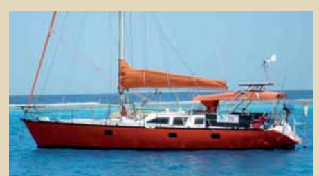
PAPAYA Garcia 47 Passoa 14,60 m 1990 8 guests 250 000 €