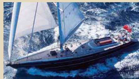
BUZZY B Sloop 27,50 m 1982/2000 6 guests 1 665 000 €