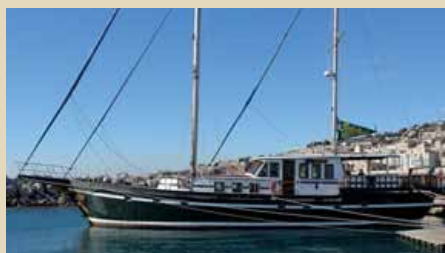
BOJAROS Steel Ketch 27,00 m 2000 10 guests 800 000 € 650 000 €