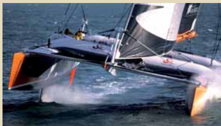
ORANGE II Maxi Catamaran 36,80 m 2003 Price on Application