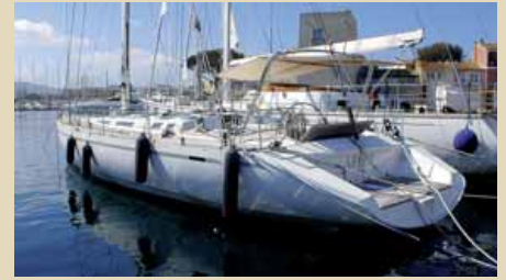
AEGIR Levrier 18 18,00 m 1995 8 guests 590 000 € 420 000 €