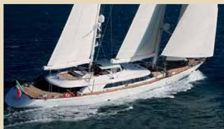
SY ROSEHEARTY 56.00 m 10/9 West Medit. - Caribbean 220 000 €/week