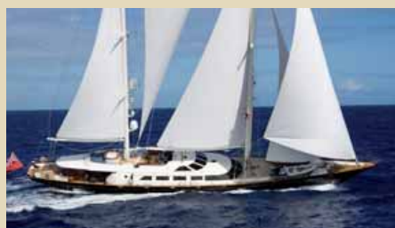
SY ANTARA 46.00 m by courtesy of Perini Navi 8/8 West Medit - Caribbean 120 000 - 150 000 US$/week