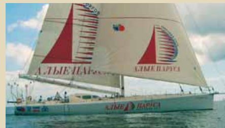
ALYE PARUSA Maxi Open monohull 27,00 m 2000 1 000 000 €