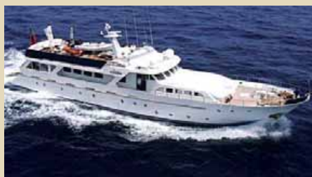
LADY ROXANNE Displacement Motor Yacht 30,00 m 1975 10 guests 1 200 000 € 950 000 €