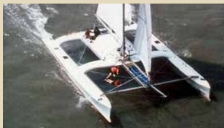
ATMOSPHERE Racing catamaran 15,28 m 1987 140 000 US$