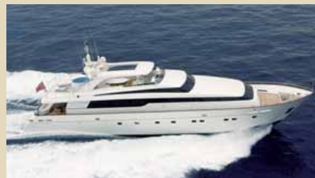
FX San Lorenzo 108 32,90 m 2004 8 guests 6 500 000 € 6 000 000 €