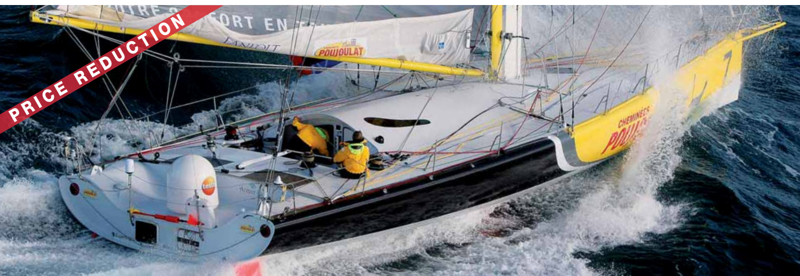
60ft Imoca "CHEMINEES POUJOULAT I" 2000. Rebuilt in 2005. The best boat available on the market. Winner of the last Velux race in 2006/2007 (all legs and overall) and of the Around Alone in 2002/2003 (all legs but one, and overall).