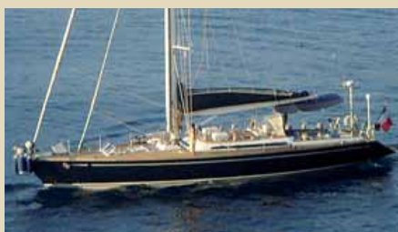
BILLY BAKER Stanfast Yachts - Holland 20,50 m 1993 8 guests 890 000 € 690 000 €