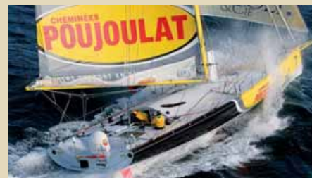
CHEMINEES POUJOULAT I 60 Open IMOCA 18,28 m 2000 500 000 € 450 000 €