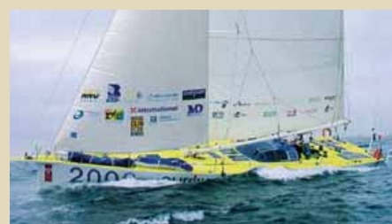
GLOBE - EX BAGAGES SUPERIOR 60 Open IMOCA 18,28 m 1992 260 000 € 220 000 €