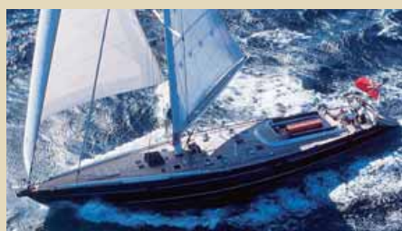
SY BUZZY B 27.50 m 8/4 South of France 24 000 - 30 000 €/Week