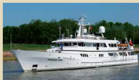
MY SANSSOUCI STAR 47.48 m 12/8 Mediterranean 42 000 - 60 000 €/week