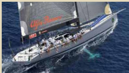
ALFA ROMEO 2 Super Maxi 30,00 m 2005 3 900 000 € 3 495 000 €