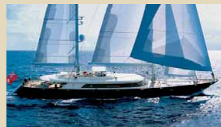
SY PERSEUS 49.80 m by courtesy of Perini Navi 10/9 West Mediterranean - Caribbean 175 000 US$/week