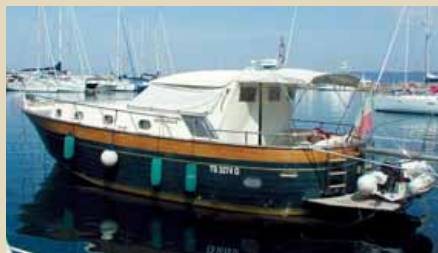
TIPITINA Apreamar 12 12,00 m 2003 4 guests 300 000 €