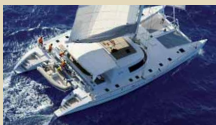
Catamaran LONE STAR 25.92 m 12/4 Caribbean 42 000 US$/week