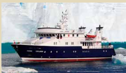
MY HANSE EXPLORER 47.76 m 12/14 Antarctic & Chilean Fjords 95 000 €/week