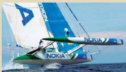
NOKIA Trimaran ORMA 60ft 18,28 m 1988 300 000 €