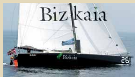
PAKEA BISKAIK 60 Open IMOCA 18,28 m 2005 600 000 €