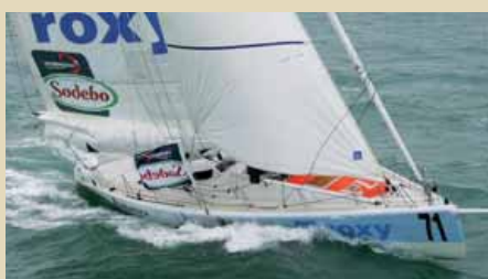
EX ROXY 60 Open IMOCA 18,28 m 1989 278 000 € 200 000 €