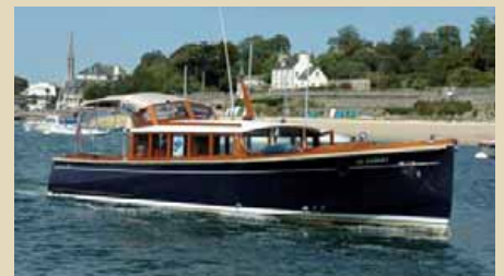
L'ARMELLE Andreyale 33 10,00 m 2006 12 passengers 160 000 € 150 000 €