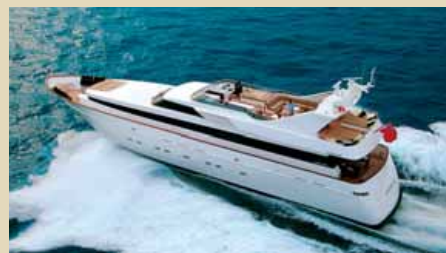
MACALULU Cantieri di Pisa - AKHIR 100 30,10 m 2004 8 guests 5 900 000 € 4 500 000 €