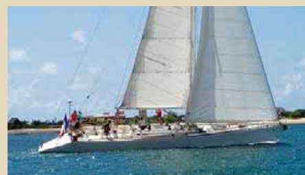
KRIISS Sloop aluminium, G. Vaton 20,30 m 1985 6 guests 389 000 €