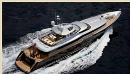
COMO Alloy Yachts 134ft 41,40 m 2006 10 guests Price on Application