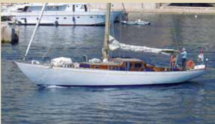
LE LYS San Germani 16,70 m 1955 6 guests 300 000 €