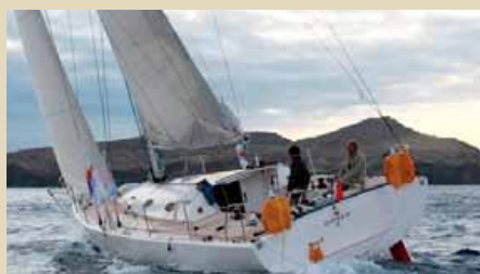
AZAWAKH III Jumbo 40 12,18 m 2006 190 000 € 165 000 €