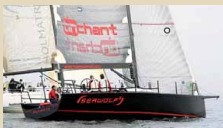
SEAWOLF 2 GP 42 12,80 m 2008 500 000 €