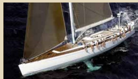
LUPA OF LONDON Baltic 78 Custom 23,95 m 2000 8 guests 2 500 000 €