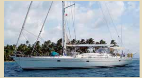
ETEL Feeling 546v 16,91 m 1992 10 guests 200 000 €