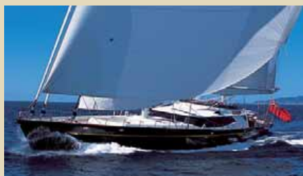
SY DRUMBEAT 53.00 m 10/9-10 Mediterranea 170 000 €/week