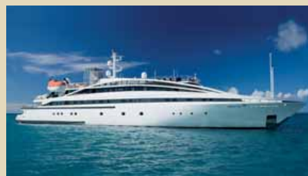
RM ELEGANT 72.48 m 30/31 Mediterranean / Caribbean 65 000 €/day