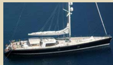
SY VAIMITI 39.20 m 8-10/5 Caribbean & Mediterranean 63 000 - 68 000 US$/week