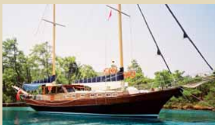
KAVIRA Gulet Ketch 22,42 m 1986/2007 6 guests 420 000 € 320 000 €