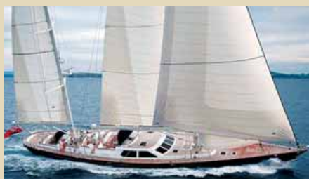
SY CHARLATAN 33.94 m 6/5 West Medit - Caribbean 58 000 - 60 000 US$/week