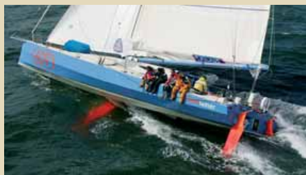
ARTECH 60 60 Open IMOCA 18,28 m 2002 420 000 €