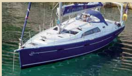
FLUNEME Allures 44 13,60 m 2005 6 guests 295 000 €