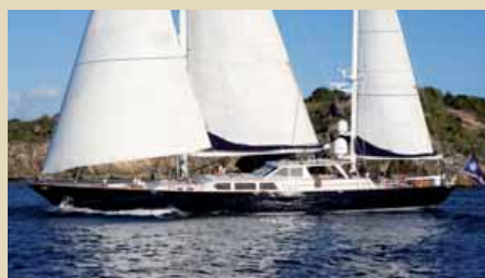
SY AXIA 37.50 m 8/5 West Mediterranean - Caribbean 65 000 - 70 000 US$/week