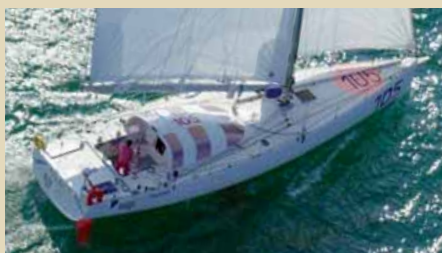
IAPLUKA, ex Brannec Open 50 - Futura 50 15,24 m 1993 95 000 €