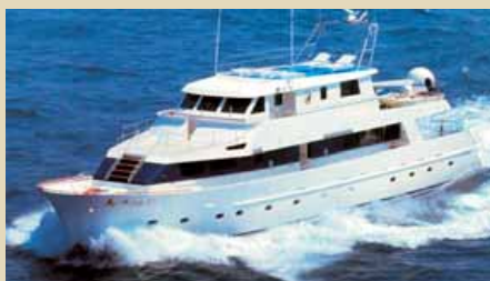
ATTILA V Displacement Motor Yacht 29,55 m 1989 10 guests 790 000 €