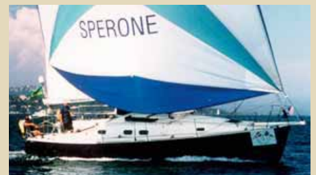
BLUE SHADOW Pinta, JNP 12 11,98 m 1998 4 guests 150 000 €