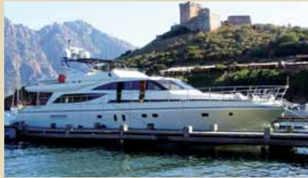
CARPE DIEM Guy Couach 2200 21,85 m 2003 8 guests 1 670 000 € 1 550 000 €