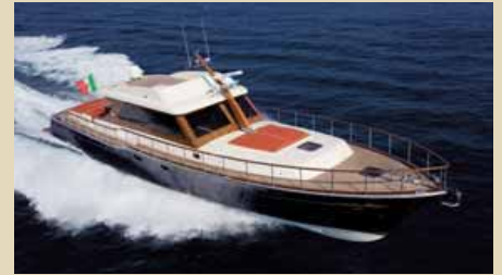
MATHIGO II Morgan 70 21,24 m 2007 7 guests 1 950 000 € 1 350 000 €