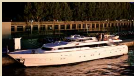
PERSEUS STAR Benetti 105 32,00 m 1985 Refit 2000-2007 8 guests 1 990 000 € 1 500 000 €