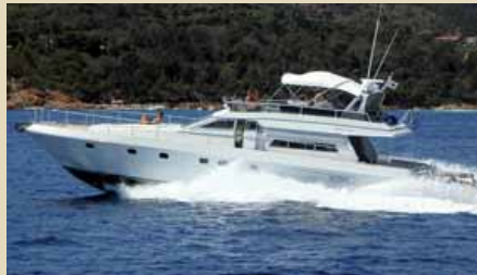
FELICITY II Ferretti 58 18,50 m 1991/2003 8 guests 395 000 € 290 000 €