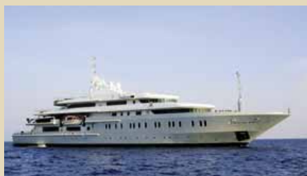
Name: MY ALYSIA Length: 85.30 m Guest/Crew: 36/32 Area: Indian Ocean-Maldives Rate: 696 500 €/week