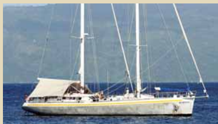
ANTSIVA Centre board schooner, aluminium 28,00 m 2004 10 guests 1 450 000 €