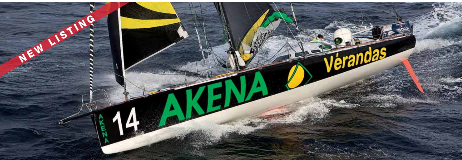
60ft Imoca "AKENA" 1998. One of the 2 best boats available on the market. She has just completed the 2009 Vendee Globe, finishing 7th overall. High pedigree and remarkably well built having finished the last 3 editions of the race : 6th, 4th and 7th.