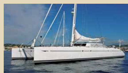
Catamaran MAGIC CAT 25.00 m 8/4 Mediterranean 37 500 €/Week