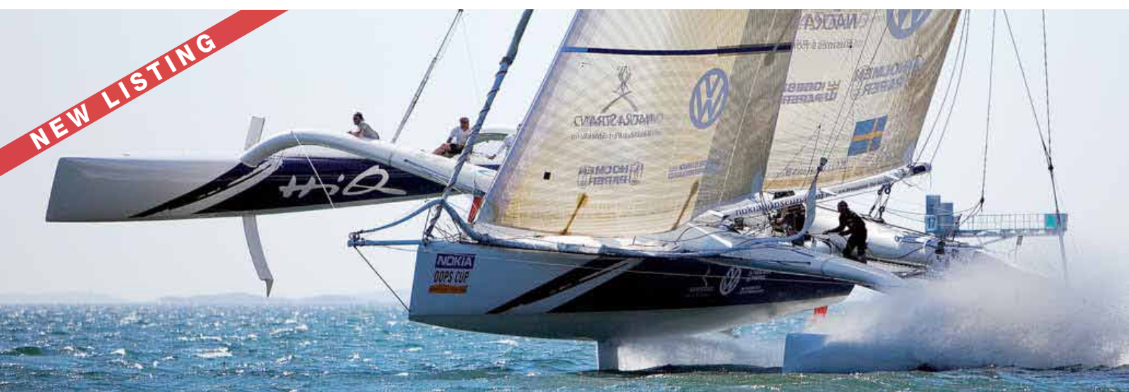
60ft Trimaran "HIQ" One of the fastest sailing boats in the world. In good conditions the boat can sail faster than 40 knots – last year's speed record was 41,6 knots. The sail area is very large compared with the size of the boat, making the vessel quick and light on the rudder, but an advanced craft to sail – the Formula 1 of sailing. The new trimaran HIQ has successfully sailed in competitions such as the ORMA, Jaques Vabre and Route du Rhum.