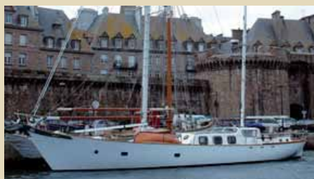
ZIA Ketch, wooden 22,75 m 1958 8 guests 450 000 €