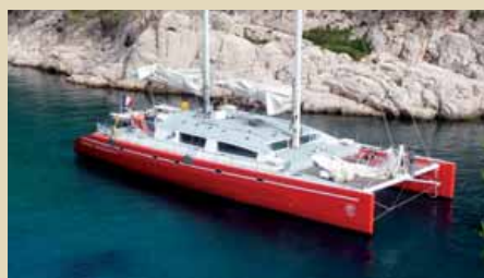
Catamaran ETOILE MAGIQUE 24.60 m 16-24/3 Caribbean & Mediterranean 15 536 €/week