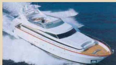
AKHIR ONE Cantieri di Pisa - Akhir 85 26,10 m 2008 8 guests - UNDER OFFER - 4 300 000 € 3 750 000 €