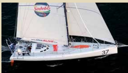
GREAT AMERICAN III 60 Open IMOCA 18,28 m 1999 250 000 €