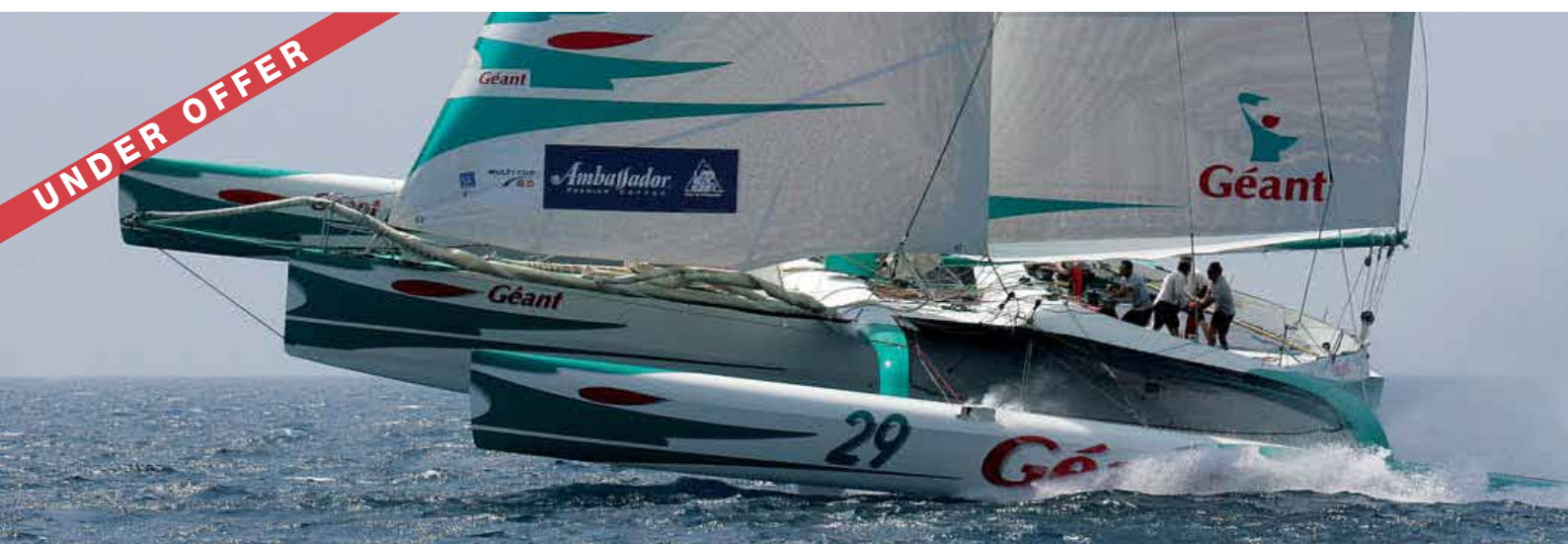
60ft ORMA Trimaran "GEANT" 2002 - Winner of THE TRANSAT 2004 and ROUTE DU RHUM 2002. A great potential winner !