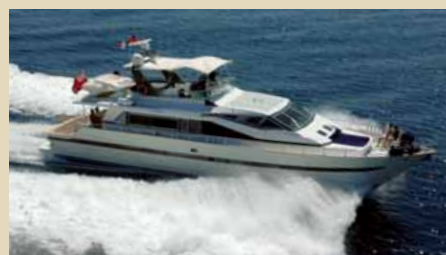
MY APPASSIONATA 23.16 m 8/3 Based in Cap d'Ail or Monaco 22 000 - 24 000 €/week