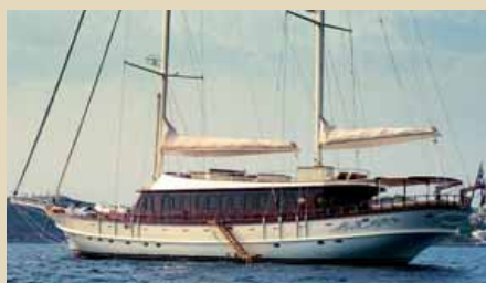
QUEEN OF ANDAMAN 41.00 m 10/7 Southeast Asia 45 000 - 50 000 €/week