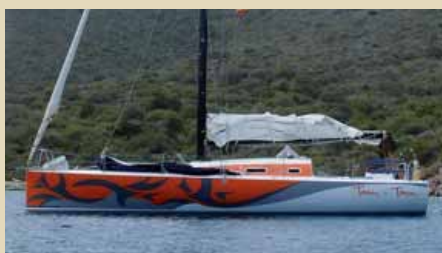
TAM TAM Pogo 40 12,18 m 2008 230 000 €