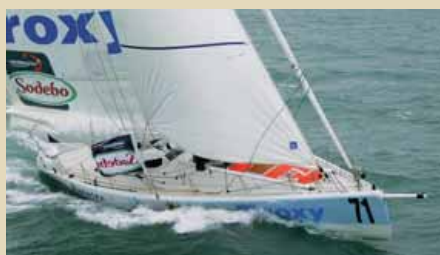
60 OPEN EX ROXY 18.28 m N/A / N/A Monaco Mediterranean Upon request