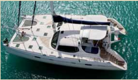
OCEAN'S SEVEN Privilege 585, Catamaran 17,82 m 2004/2007 8 guests 950 000 €