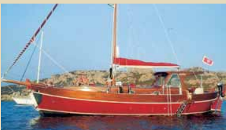
LA RAILLEUSE Cutter 14,50 m 2003 4 guests 215 000 €