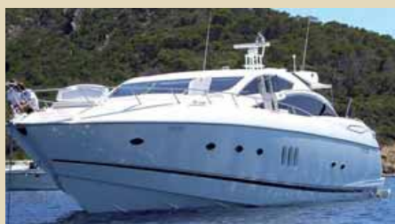
TENEO Sunseeker Predator 82 24,97 m 2006 8 guests 2 590 000 €