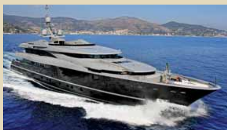
MY SEA FORCE ONE 53.80 m 10/8 Mediterranean 280 000 - 300 000 €/week