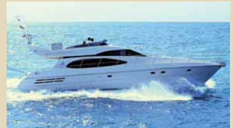
VOGUE III Azimut 58 17,64 m 2000 6 guests 670 000 €