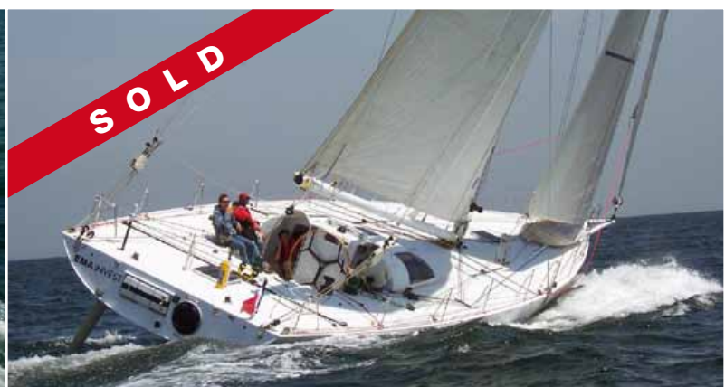
60ft IMOCA "GLOBE" 1992. Ex Bagages Superior