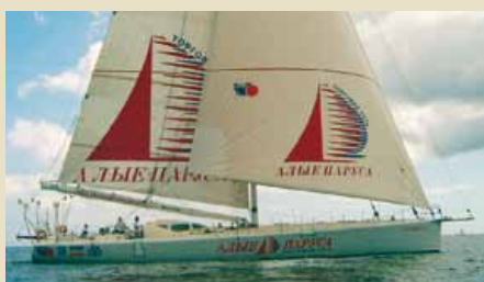
ALYE PARUSA Maxi Open monohull 27.00 m 2000 1,000,000 € 750,000 €