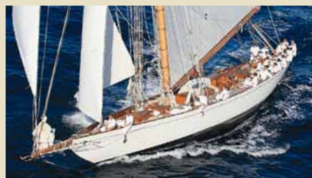
MOONBEAM IV 27.40 m 7/6 West Mediterranean 45,000 €/week