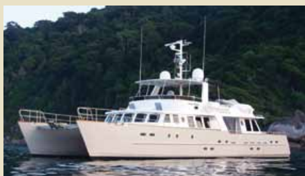
SONG SAIGON Displacement Motor Yacht 24.00 m 2008 8 guests Displayed at the AYS 2,200,000 € 1,780,000 €