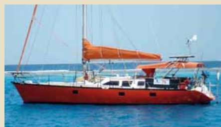
PAPAYA Garcia 47, Passoa 14.60 m 1990 8 guests 185,000 €