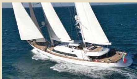
ROSEHEARTY 56.00 m 12/9 West Mediterranean-Caribbean 147,000 €/week