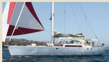
NAUSICAA Sloop aluminium 66ft 20.00 m 2006 10 guests 770,000 € 480,000 €