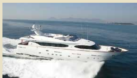
TALILA 29.00 m 8-12/4 West Mediterranean 46,000 €/week