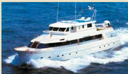
ATTILA V Displacement Motor Yacht 29.55 m 1989 10 guests 790,000 € 480,000 €