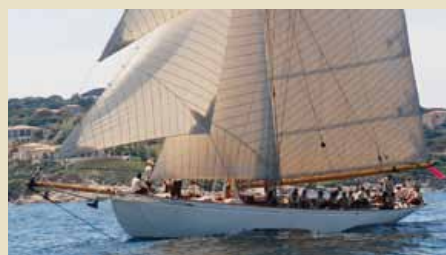
MOONBEAM III 31.00 m 6-12/2 West Mediterranean 35,000 €/week