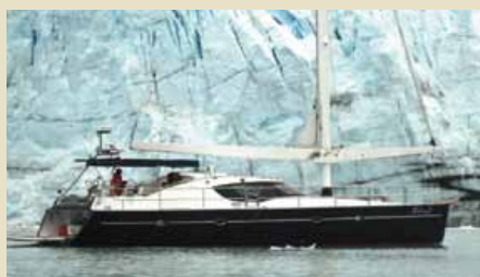
MELINA I Ocean Passage Cruising Sloop 17.10 m 2004 6 guests 450,000 €