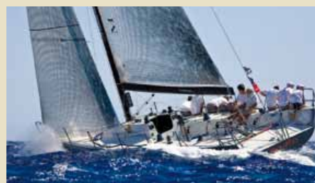
NEAR MISS GP 42 12.80 m 2008 500,000 € 250,000 €