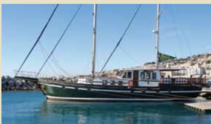
BOJAROS Steel Ketch 27.00 m 2000 10 guests 800,000 € 490,000 €