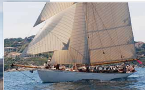
Moon Beam of Fife, p.8