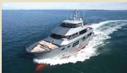
Vvs1 34.00 m 12/6 Pacific Ocean 35,000 €/week