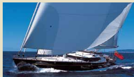
DRUMBEAT 53.00 m 11/10 West Mediterranean 170,000 €/week