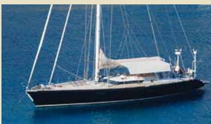
TEBA Pouvreau 72 21.60 m 1986 8 guests 650,000 €