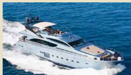
MAKARENA 30.00 m 10/5 Other destinations 48,000 €/week