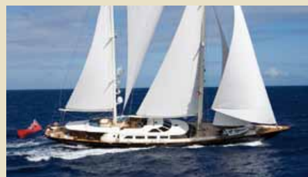
ANTARA 46.00 m 12/8 West Mediterranean 150,000 €/week