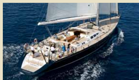
OCEAN'S SEVEN² (ex KALIKOBASS II) 31.70 m 8/4 West Mediterranean 50,000 €/week