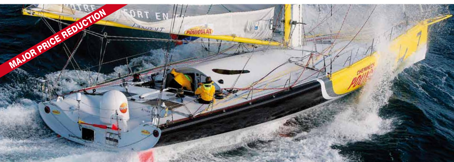
60ft Imoca "CHEMINEES POUJOULAT I" 2000. Rebuilt in 2005. The best boat available on the market. Winner of the Velux race in 2006/2007 (all legs and overall) and of the Around Alone in 2002/2003 (all legs but one, and overall).