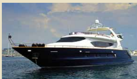
MABRUK II 27.00 m 8-12/4 West Mediterranean 34,800 €/week