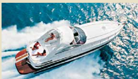
SUANE Pershing 45 14.20 m 1999 4 guests 330,000 € 220,000 €