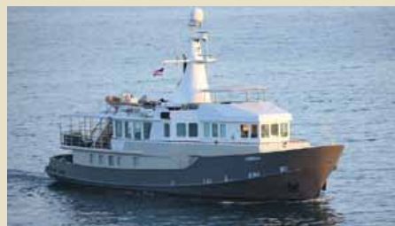
AMNESIA Veb J Warnke, Germany 33.53 m 1990/1999 6 guests 3,200,000 US$