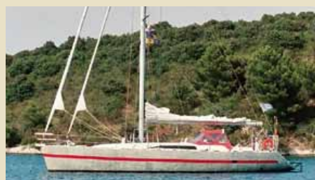
SARANAIA Saranaia 50 15.00 m 2005 6 guests 260,000 €