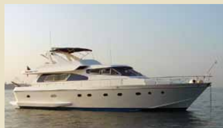
CELESTIAL Navarcantieri P 21 S 22.60 m 1997 8 guests 750,000 € 490,000 €