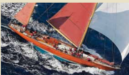
AGNETA Classic Yawl 25.03 m 1950 6 guests 1,700,000 € 1,200,000 €