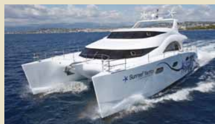
JAMBO 24.00 m 8/2 Pacific Ocean 32,000 €/week