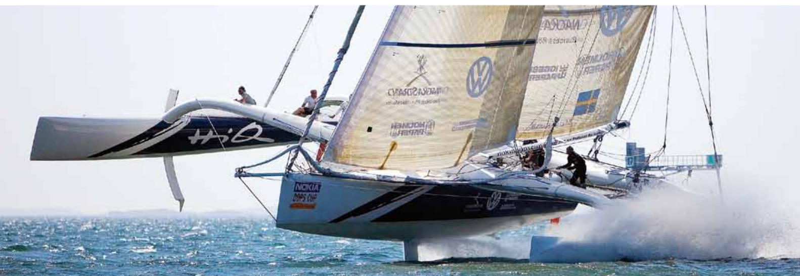
60ft Trimaran "HIQ" 1998. One of the fastest sailing boats in the world. In good conditions, the boat can sail faster than 40 knots – last year's record speed was 41,6 knots. The sail area is very large compared with the size of the boat, making the vessel quick and light on the rudder. An advanced craft to sail – the Formula 1 of sailing. The new trimaran HIQ has successfully sailed in competitions such as the ORMA, Jaques Vabre and Route du Rhum.