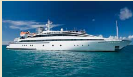
RM ELEGANT 72.48 m 30/31 Caribbean - West Mediterranean 455,000 €/week