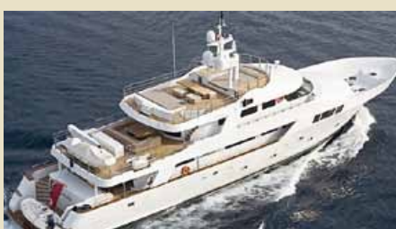
SENSEI 39.98 m 10/7 West Mediterranean 98,000 €/week