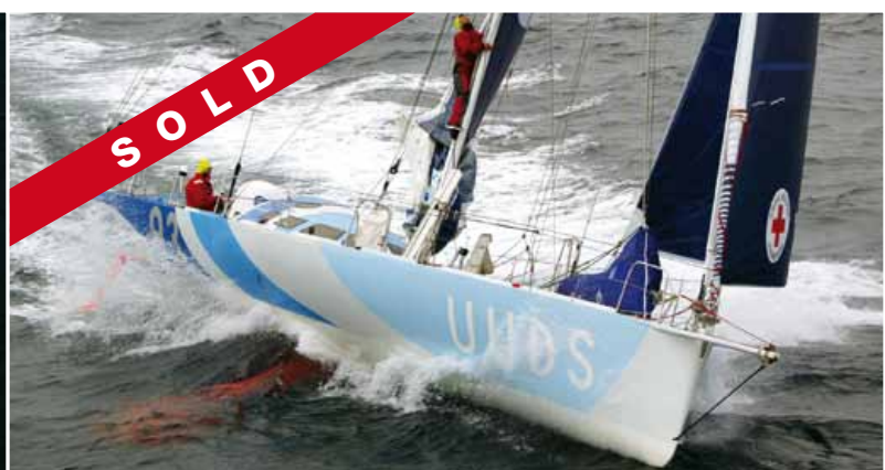
60ft IMOCA "UUDS" 1994/2004.