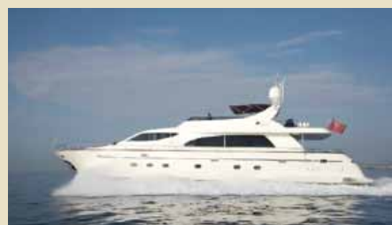
ANTALEX 26.00 m 8/4 West Mediterranean 40,000 €/week