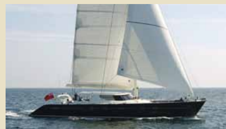
SUN TENAREZE Catamaran-JFA 25.75 m 2004 8 guests 3,500,000 €