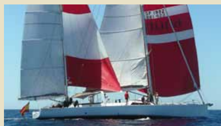
FORTUNA Ex Maxi IOR 25.40 m 1989 8 guests 1,500,000 €