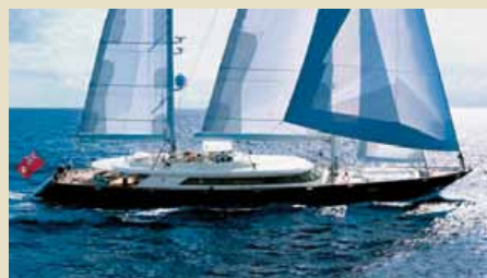
PERSEUS 49.80 m 12 Pacific Ocean 130,000 €/week