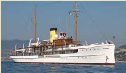
SS DELPHINE 78.65 m 26-28/24-27 East Mediterranean 350,000 €/week