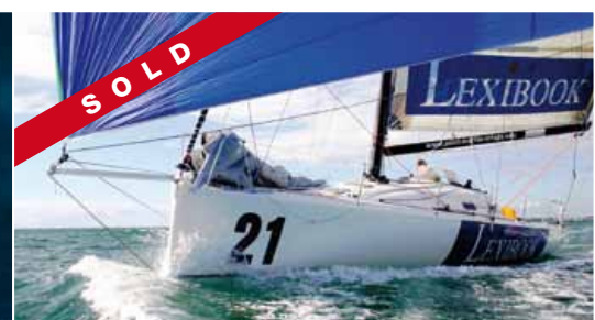
Pogo 40 2006.