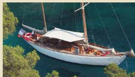
HYGIE 24.00 m 8 West Mediterranean 15,000 €/week