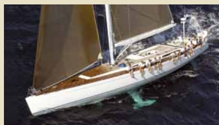
LUPA OF LONDON 23.95 m 6/3 West Mediterranean 27,000 €/week