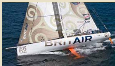
BRIT AIR 60ft Open IMOCA 18.28 m 2007 1,700,000 €