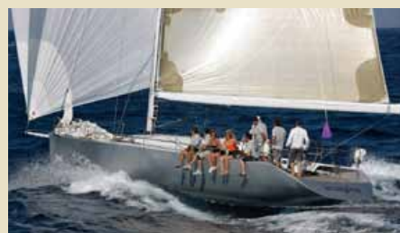
IMAGINE Brenta 55 17.10 m 2003 550,000 €