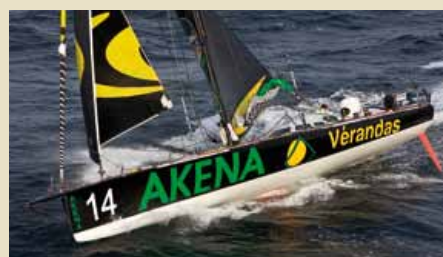
AKENA 60ft Open IMOCA 18.28 m 1998 490,000 € 390,000 €