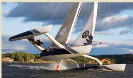
HIQ 60ft ORMA Trimaran 18.28 m 1998 Major price reduction 600,000 €