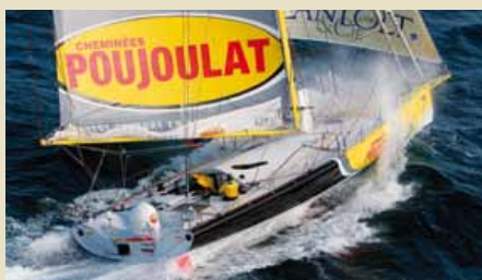
CHEMINEES POUJOULAT I 60ft Open IMOCA 18.28 m 2000 450,000 € 350,000 €