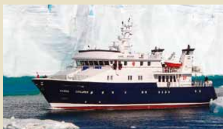
HANSE EXPLORER 47.76 m 12/14 Other destinations 100,000 €/week