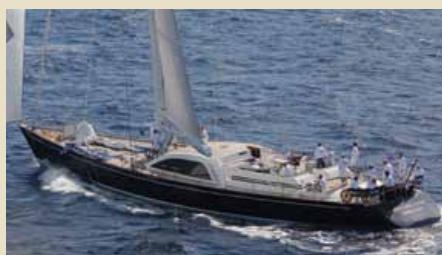
HIGHLAND BREEZE 34.34 m 8/5 West Mediterranean 52,000 €/week