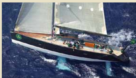
KALAO Maxi Dolphin 65 20.01 m 2003 6 guests 1,300,000 € 1,111,000 €