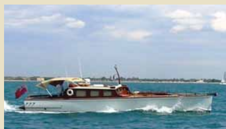
ALLEGIANCE Réplique C&N 1925 14.40 m 2004 6 guests 390,000 €