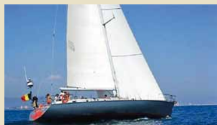
BUCANEER 23.00 m 10 West Mediterranean 12,000 €/week