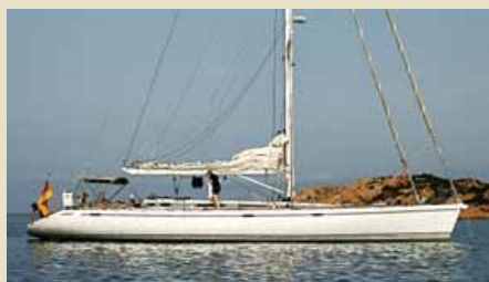
AEGIR Levrier 18 18.28 m 1995 8 guests 590,000 € 420,000 €