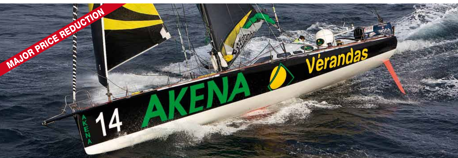
60ft Imoca "AKENA" 1998. One of the 2 best boats available on the market. She has completed the 2009 Vendee Globe, finishing 7th overall. High pedigree and remarkably well built having finished the last 3 editions of the race : 6th, 4th and 7th respectively.