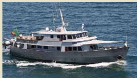
LA FENICE 33.00 m 8/5 West Mediterranean 30,000 €/week