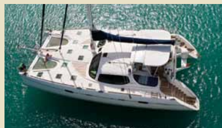
OCEAN'S SEVEN Privilege 585, Catamaran 17.82 m 2004/2007 8 guests 836,000 €