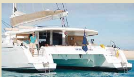
Catamaran WORLD'S END 19.67 m 10-12/3 West Mediterranean 25,000 €/week