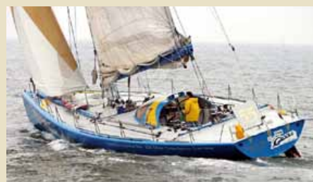
CORRE CAMINO ex Margaret Anna 60ft Open Eco Class 18.28 m 1989 169,000 US$