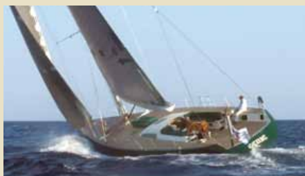
GENIE 24.00 m 6/3 West Mediterranean 30,000 €/week