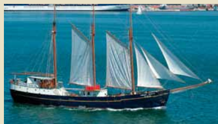
PRINCIPE PERFEITO 3 mast Schooner 41.52 m 1943 200 guests 1,650,000 €