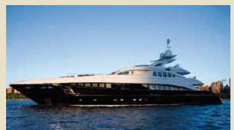
BLISS 44.17 m 10/9 West Mediterranean 160,000 €/week