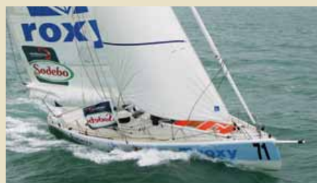
EX ROXY 60 Open IMOCA 18.28 m 1989 Major price reduction 278,000 € 200,000 €