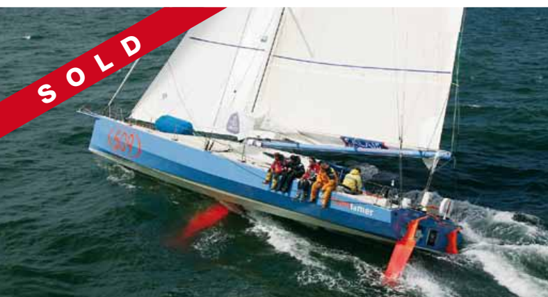
60ft IMOCA "ARTECH" 2002.