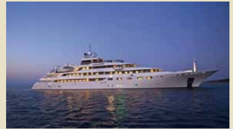
O'MEGA 82 m 30 West/East Mediterranean 450,000 €/week