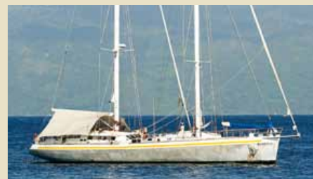
ANTSIVA Centre board schooner, aluminium 28.00 m 2004 10 guests 1,450,000 €