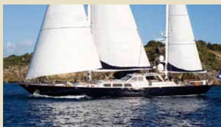
AXIA 38.00 m 8/6 Other destinations 48,000 €/week