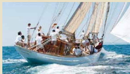
ORIANDA 26.00 m 8-12/3 West Mediterranean 21,000 €/week