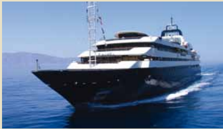
Name: TURAMA Length: 117.35 m Guest/Crew: 70/60 Area: West Mediterranean Rate: 90,000 €/day