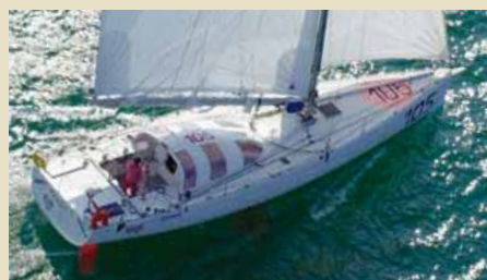
IAPUKA, EX BRANNEC 50 ft Open 15.24 m 1993 95,000 €