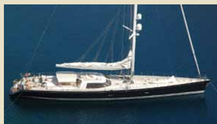
VAIMITI 39.20 m 10/5 East Mediterranean 52,500 €/week