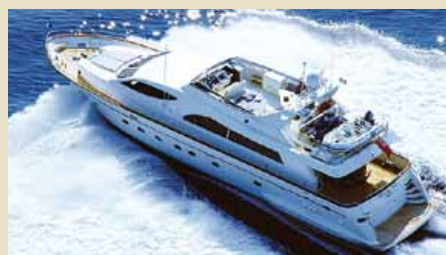
LAMPQUICK 26.00 m 9/4 West Mediterranean 35,000 €/week