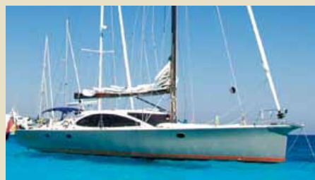
EUPHONY Sydney 60 converted 18.20 m 1998/2005 4 guests 320,000 €