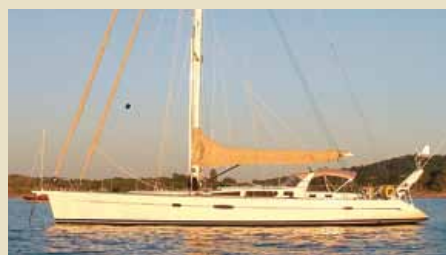
KANANA Centre Board Sloop 22.20 m 2002 8 guests 1,150,000 €