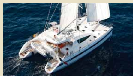
Catamaran ELYSIUM 18.90 m 8/2 Mediterranean-Caribbean 20,000 -24,000 €/week