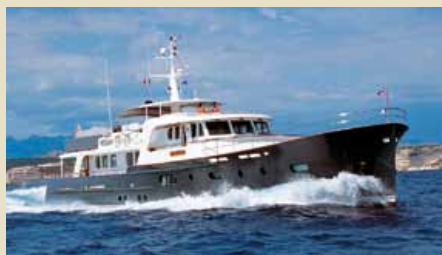
LEPANTE 33.00 m 10/4 West Mediterranean 35,000 €/week