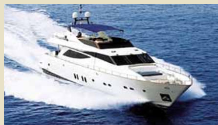
YIALOUSA Guy Couach 2800 28.00 m 2001 8 guests 2,000,000 € 1,400,000 €