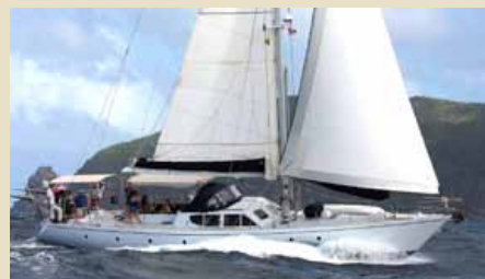
MAKAYABELLA Sailing Yacht 18.90 m 1986 8 guests 250,000 £