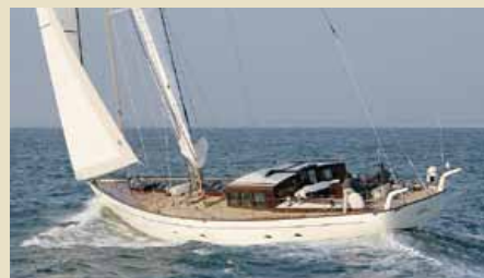
ATAO 24.90 m 6-10/3 West Mediterranean 30,000 €/week