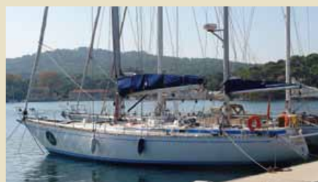
SCARAMOUCHE Swan 57 17.37 m 1978 6 guests 225,000 €