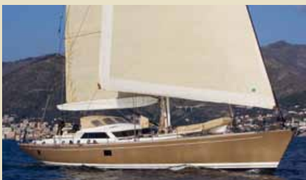
DHARMA Southern Wind Shipyard 29.00 m 2005 8 guests 3,900,000 €