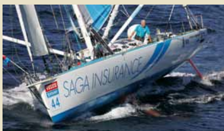
SAGA - EX FILA 60 Open IMOCA 18.28 m 1997 450,000 € 260,000 €