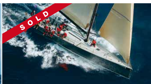
60ft "SOLUNE" 2003. 60ft open