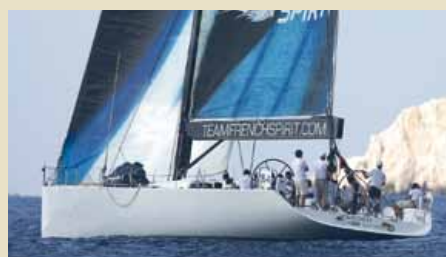
MED SPIRIT Super Maxi Yacht 29.70 m 2003 800,000 €