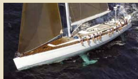
LUPA OF LONDON Baltic 78 Custom 23.95 m 2000 8 guests 2,500,000 € 1,950,000 €