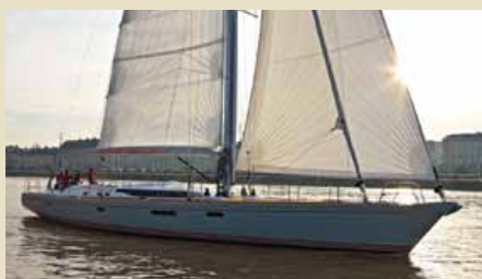
SWALLOW & AMAZONE 23.70 m 8/2 Mediterranean-Caribbean 23,000-25,000 €/week