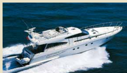
FIDJI III Guy Couach 1850 18.55 m 2000 4 guests 720,000 € 590,000 €