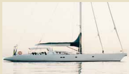
SUSANNE AF STOCKHOLM Aluminium sloop 30.16 m 1990/2008 8 guests 3,500,000 €