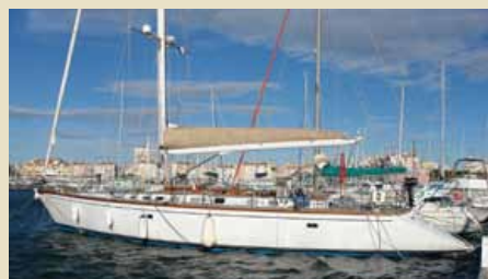
EQUINOX Selestra 64, aluminium 20.54 m 1996/2010 8 guests 490,000 €