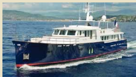
PAOLYRE 32.70 m 10 West Mediterranean 52,000 €/week