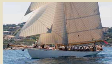
MOONBEAM III Gaff Cutter 31.00 m 1903 10 guests 2,500,000 €