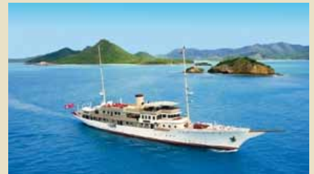
HAIDA G 71.10 m 12/16 Other dest. - West Mediterranean 189,000 €/week