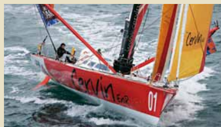
ENERGIE AUTOUR DU MONDE 60ft Open IMOCA/Eco Class 18.28 m 1996 200,000 €