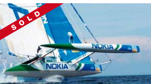
Trimaran "NOKIA" 1988.