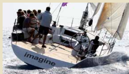
IMAGINE Brenta 55 17.10 m 2003 6/8 guests 550,000 €