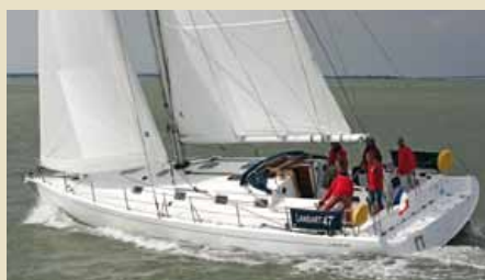
LANSART 47 Lansart 47 14.76 m 2007 6 guests 370,000 €