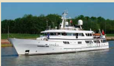
SANSSOUCI STAR 53.50 m 12/8 Mediterranean 65,000 €/week