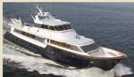
NYMPHAEA 33.00 m 6/3 Other destinations 30,000 €/week