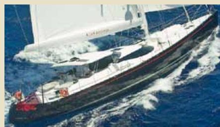
BLISS 37.00 m 10/4 Pacific Ocean 65,000 €/week