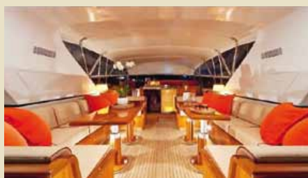
SILAOs 25.10 m 7-12/2 West Mediterranean 39,500 €/week