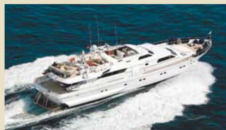
ANTISAN 33.00 m 11-40/5 West Mediterranean 63,000 €/week