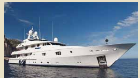
MOSAIQUE 50.01 m 12/12 West/East Mediterranean 200,000 €/week