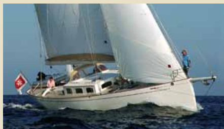
ALBE Sail / Gaff Cutter 19.20 m 2005 4 guests 490,000 €