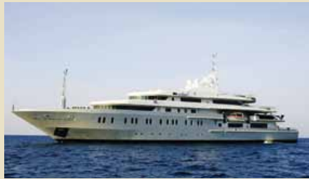
MOONLIGHT II (Ex Alysia) 85.30 m 36/32 West Medit/Indian Ocean 695,000 €/week