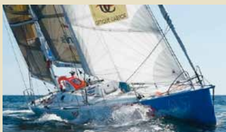
TOP 50 Open 50 15.24 m 1995 170,000 €