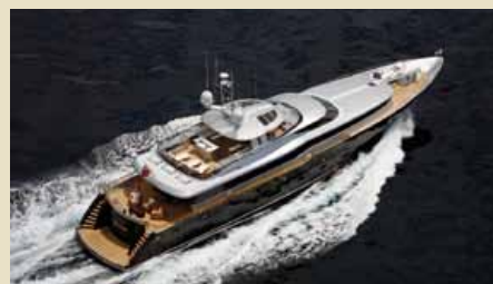
COMO Alloy Yachts 134ft 41.14 m 2007 10 guests 13,950,000 €