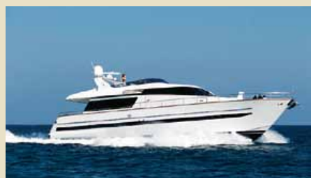
BST San Lorenzo 72 21.70 m 1999 6 guests 990,000 €