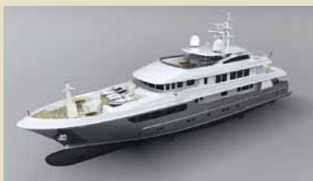
EP 148 Displacement Motor Yacht 45.00 m 2011 10 guests 19,100,000 €