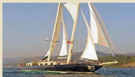
OFELIA 36.00 m 12/6 East Mediterranean 32,000 €/week