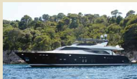
BJORG II Guy Couach 2800 LR 28.00 m 2002 8 guests 3,150,000 € 1,995,000 €