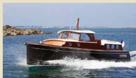
LOCH LOMOND Classic Tender 9.98 m 2007 12 passengers 200,000 €