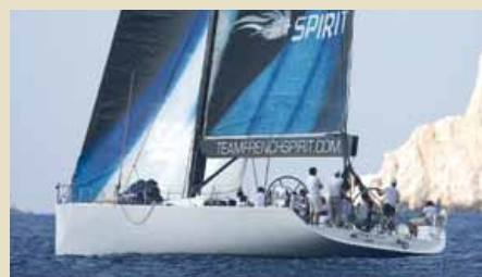
MED SPIRIT (ex BOLS) 29.70 m 12-16/8 West Mediterranean 42,000 €/week