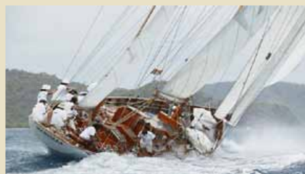
MARIELLA 24.08 m 6-12/3 Caribbean 24,000 €/week