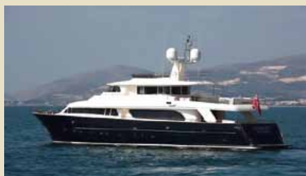
MARIA II OF LONDON 30.95 m 10/6 East Mediterranean 65,000 €/week