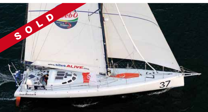
60ft Imoca "GREAT AMERICAN III" 1999.