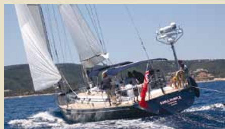
EARLY PURPLE Nautor Swan 65 19.82 m 2002 6 guests Displayed at the AYS 1,500,000 €