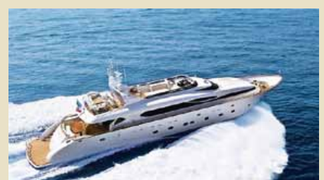
PARIS 35.00 m 12/6 East Mediterranean 90,000 €/week