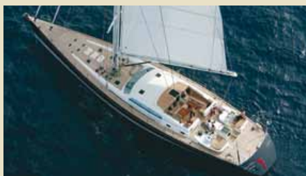
GRAND BLEU VINTAGE 29.00 m 8/4 West Mediterranean 45,000 €/week