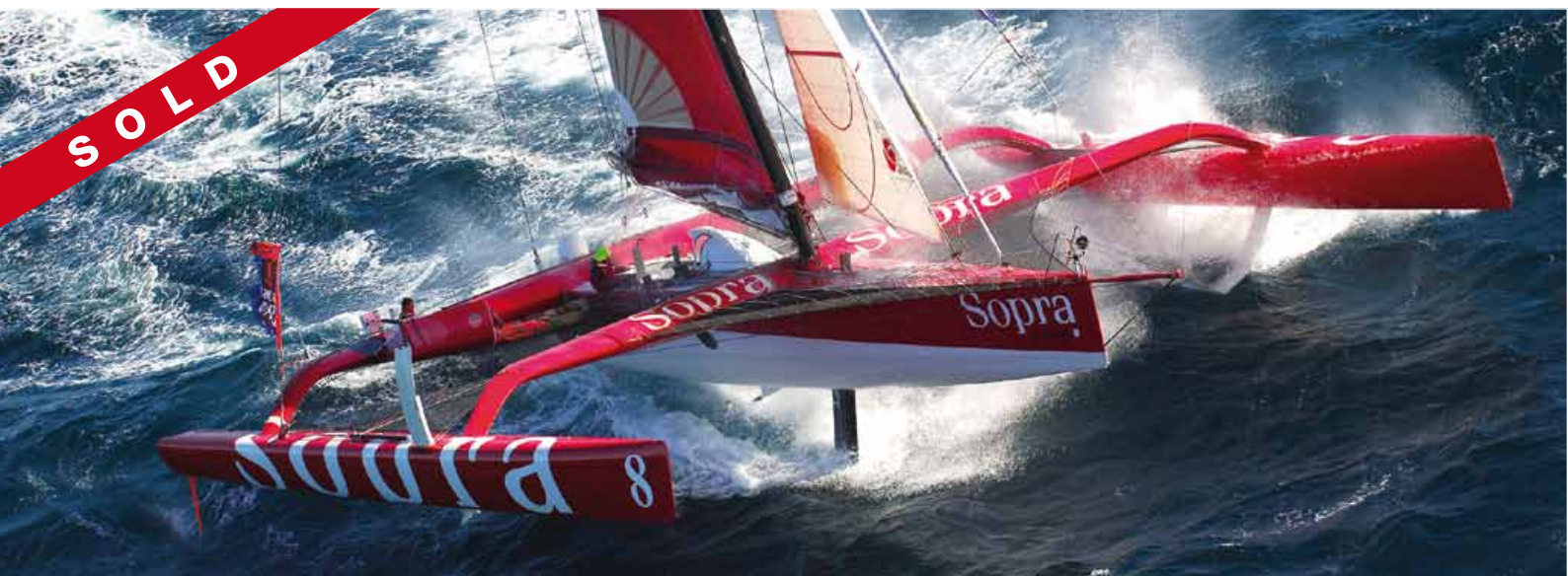
60ft Trimaran "Sopra" 2002.