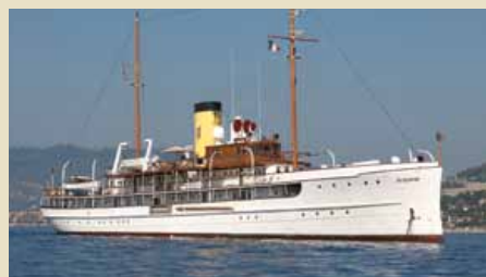
DELPHINE Steam Ship 258ft 78.50 m 1921/2003 26 guests 38,000,000 €