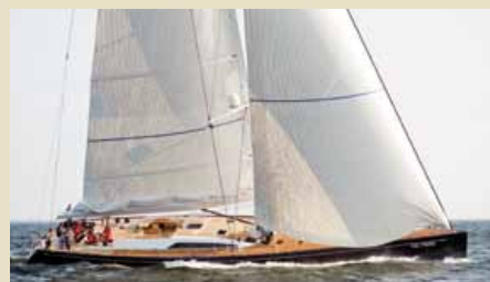
SOLLEONE 27.40 m 8/4 West Mediterranean 42,000 €/week