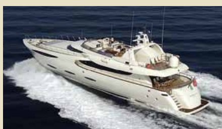
MABRUK III 35.00 m 10/5-7 West Mediterranean 70,000 €/week