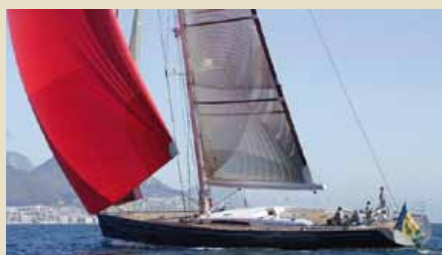
Mrs SEVEN 30.20 m 8/5 West Mediterranean 52,000 €/week