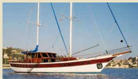
GARANCE Steel Ketch 28.00 m 1996-2008 10 guests 790,000 € 590,000 €