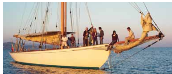
Moonbeam of Five III