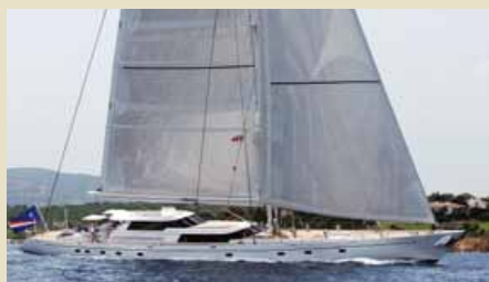
HYPERION 47.40 m 6/8 West Mediterranean 97,000 €/week