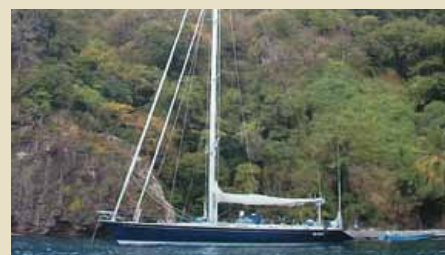
SILANDRA Nauta 72 21.33 m 1991 8 guests 730,000 €