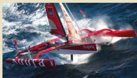
EMOTION (ex SOPRA) 21.00 m 9/3 West Mediterranean 48,000 €/week