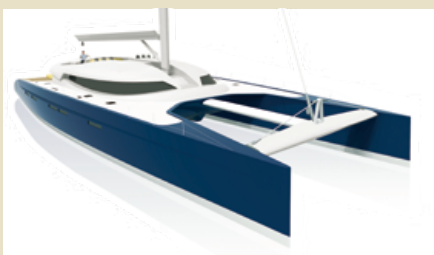
NAHEMA 120ft Catamaran 35.00 m Under construction 8 guests 14,000,000 €