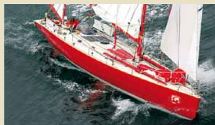
LE CIGARE ROUGE 60ft Open Yawl 18.28 m 1991 140,000 €