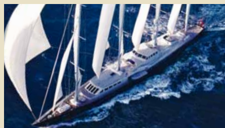
Name: PHOCEA Length: 78.15 m Guest/Crew: 12/15 Area: Mediterranean-Caribbean Rate: 160,000-180,000 €/week