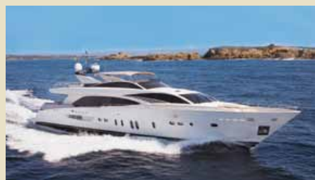
LADY EMMA 34.00m 8/4 West Mediterranean 79,000 €/week