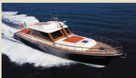
MATHIGO II Morgan 70 21.24 m 2007 7 guests Displayed at the AYS 1,950,000 € 1,350,000 €