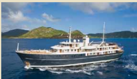
SHERAKAN 69.95 m 26-36/19 West Mediterranean - Caribbean 395,000 €/week