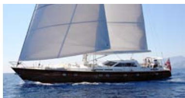
"NEPTUNE" 2004 – Length: 25.65 m