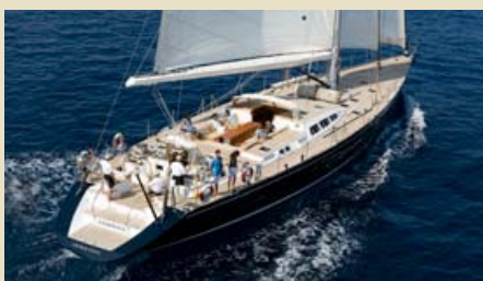
OCEAN'S SEVEN 2 (ex KALIKOBASS II) 31.70 m 8/4 West Mediterranean 50,000 €/week