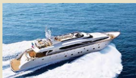
PARIS A 35.00 m 12/6 East Mediterranean 59,500 €/week