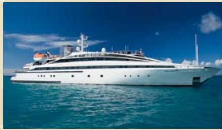
RM ELEGANT 72.48 m 30/31 Costa Rica 455,000 €/week