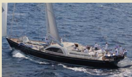
HIGHLAND BREEZE 34.34 m 8/5 West Mediterranean 46,000 €/week