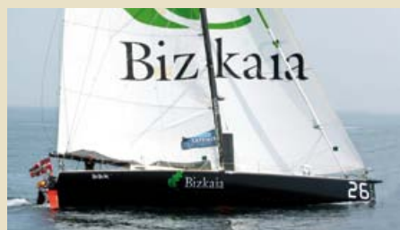
PAKEA BIZKAIA 60ft Open IMOCA 18.28 m 2005 600,000 €