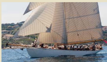
MOONBEAM III 31.00 m 6-12/2 West Mediterranean Available for Les Voiles de Saint-Tropez 10,000 €/day