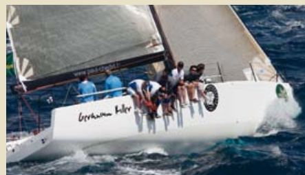
GERANIUM KILLER A40 RC 11.98 m 2008 230,000 €