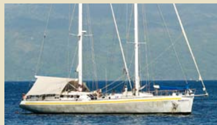
ANTSIVA Centre board schooner, aluminium 28.00 m 2004 10 guests 1,190,000 €