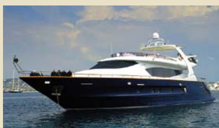
MABRUK II 27.00 m 8/4 West Mediterranean 34,800 €/week