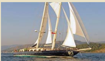
OFELIA 36.00 m 12/6 Western & Eastern Med 32,000 €/week