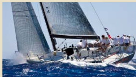
NEAR MISS GP 42 12.80 m 2008 220,000 €