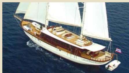
QUEEN OF ANDAMAN Modern Classic Motor Sailor 41.00 m 2007 8 guests 6,500,000 €