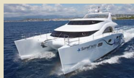
JAMBO 24.00 m 8/2 Pacific Ocean 28,000 €/week