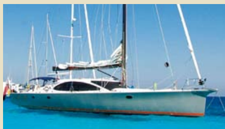
EUPHONIE Sydney 60 converted 18.20 m 1998/2005 4 guests 280,000 €