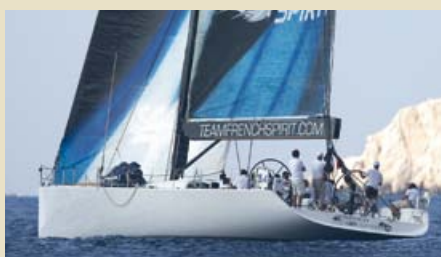
MED SPIRIT Super Maxi Yacht 29.70 m 2003 800,000 €