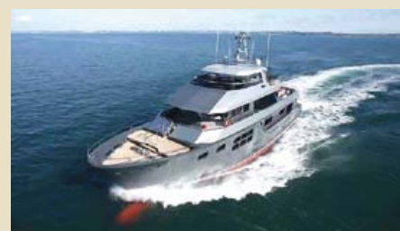
VvS1 34.00 m 12/6 South Pacific/New Zealand Available for the Rugby World Cup 58,000 €/week