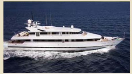
BELLA STELLA 45.00 m 14/9 West/East Mediterranean 105,000 €/week