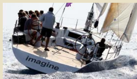
IMAGINE Brenta 55 17.10 m 2003 6/8 guests 450,000 €