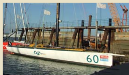
OZ 60ft Open IMOCA 18.28 m 1991 290,000 GBP