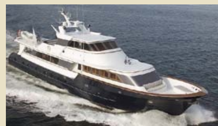
NYMPHAEA 33.00 m 6/3 South-East Asia, Indian Ocean 30,000 €/week