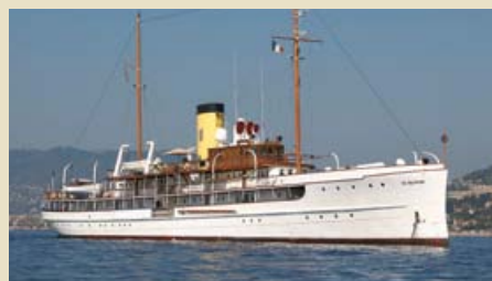
DELPHINE Steam Ship 258ft 78.50 m 1921/2003 26 guests 38,000,000 €