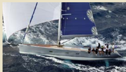
CHARIS Maxi Dolphin 65.3 20.01 m 2004 6 guests 1,270,000 €