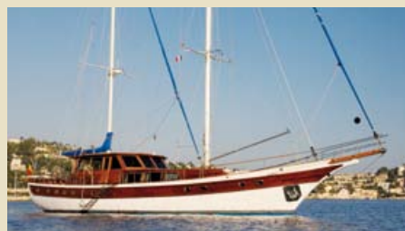
GARANCE Steel Ketch 28.00 m 1996-2008 10 guests 590,000 €