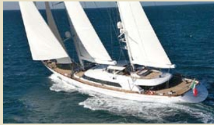
ROSEHEARTY 56.00 m 12/16 West Mediterranean-Caribbean 147,000 €/week