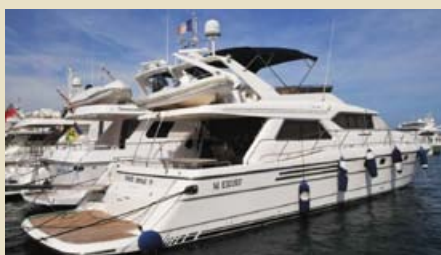
POINTE ROYALE III Princess 66 Fly 20.12 m 1995 8 guests 395,000 €