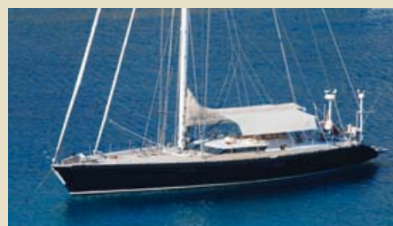
TEBA Pouvreau 72 21.60 m 1986 8 guests 600,000 €