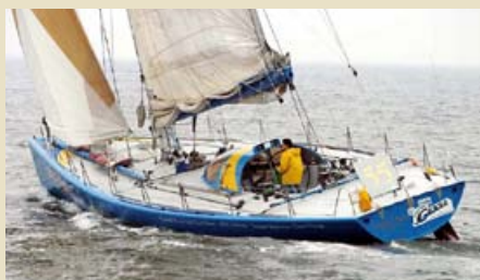
CORRE CAMINO ex Margaret Anna 60ft Open Eco Class 18.28 m 1989 169,000 US$