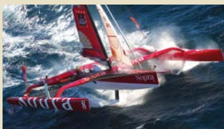
EMOTION (ex SOPRA) 21.00 m 9/3 West Mediterranean 48,000 €/week