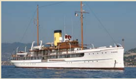
SS DELPHINE 78.65 m 26-28/24-27 East Mediterranean 350,000 €/week