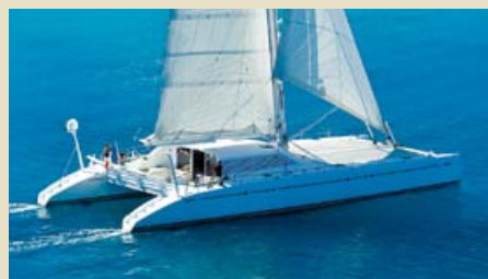
Catamaran MAGIC CAT 25.00 m 8/4 East Mediterranean 30,000 €/week