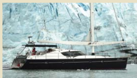
MELINA I Ocean Passage Cruising Sloop 17.10 m 2004 6 guests 450,000 €