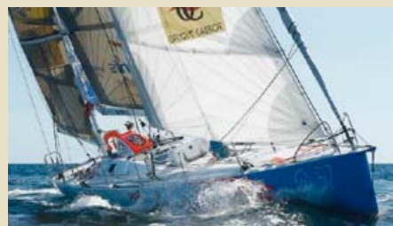
TOP 50 Open 50 15.24 m 1995 170,000 €