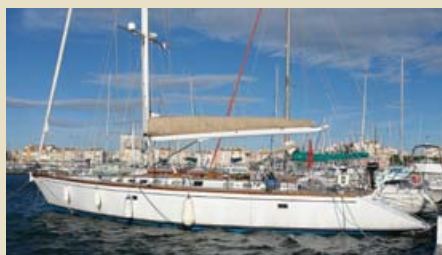
EQUINOX Selestra 64, aluminium 20.54 m 1996/2010 8 guests 450,000 €