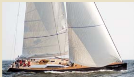
SOLLEONE 27.40 m 8/4 West Mediterranean 38,000 €/week