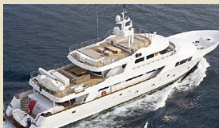
SENSEI 39.98 m 10/7 West Mediterranean 98,000 €/week