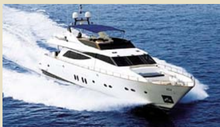
YIALOUSA Guy Couach 2800 28.00 m 2001 8 guests 1,400,000 €