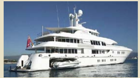
SOLEMATES 60.00 m 12/15 West Mediterranean - Caribbean 340,000 €/week