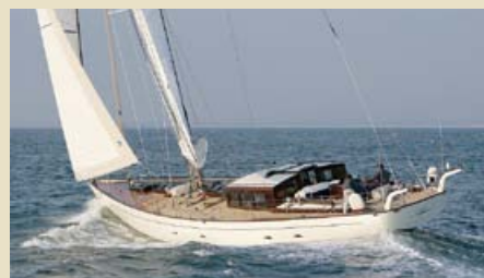
ATAO 24.90 m 6-10/3 West Mediterranean 30,000 €/week