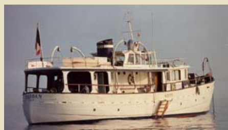
CHARLESTON Classic Motor Yacht 23.00 m 1939 8 guests 295,000 €