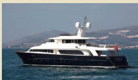
MARIA II OF LONDON 30.95 m 10/6 East Mediterranean 60,000 €/week