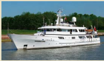
SANSSOUCI STAR 53.50 m 12/8 Mediterranean 65,000 €/week