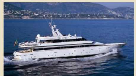
COSTA MAGNA 44.50 m 10/8 West Mediterranean 90,000 €/week