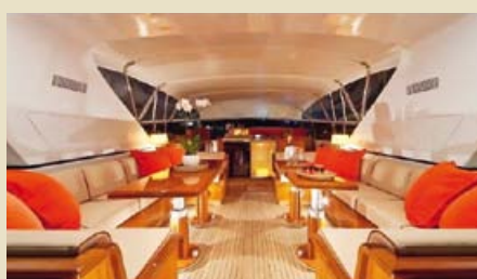
SILAOS 25.10 m 7-12/2 West Mediterranean 33,000 €/week