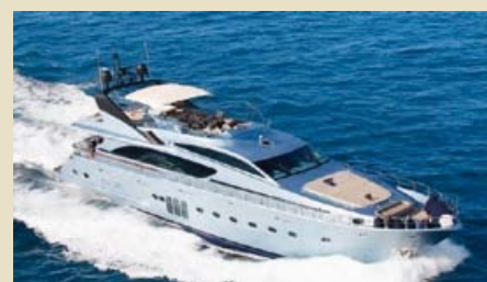
MAKARENA 30.00 m 10/5 Other destinations 35,000 €/week