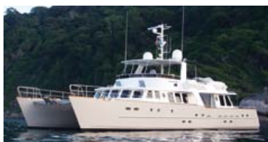
"SONG SAIGON" 2008 – Length: 24.00 m