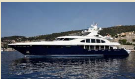
MAR 49.90 m 12/12 West Mediterranean 150,000 €/week