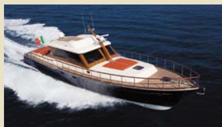
MATHIGO II Morgan 70 21.24 m 2007 7 guests 1,110,000 €