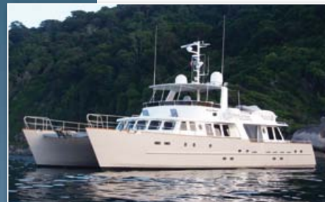
Song Saigon, p. 4