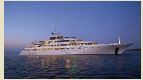
O'MEGA 82 m 32/30 Caribbean 450,000 €/week