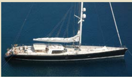
VAIMITI 39.20 m 10/5 East Mediterranean 52,500 €/week