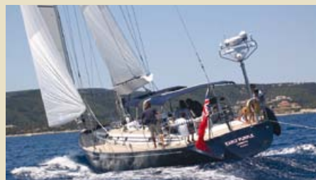
EARLY PURPLE Nautor Swan 65 19.82 m 2002 6 guests 1,295,000 €