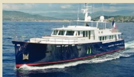
PAOLYRE 32.70 m 10/5 West Mediterranean 49,000 €/week