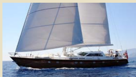
NEPTUNE Fitzroy Aluminium Sloop 25.65 m 2004 7 guests Cannes and Monaco YS 2011 3,700,000 €