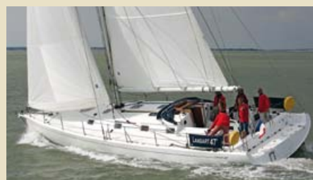
LANSART 47 Lansart 47 14.76 m 2007 6 guests 340,000 €