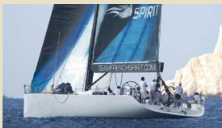
MED SPRIT (ex BOL) 29.70 m 12-16/8 West Mediterranean 35,000 €/week