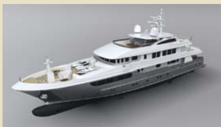
EP 148 Displacement Motor Yacht 45.00 m 2011 10 guests 19,100,000 €