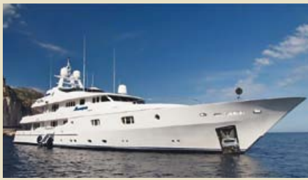
MOSAIQUE 50.01 m 12/12 West/East Mediterranean 200,000 €/week