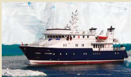
HANSE EXPLORER 47.76 m 12/14 South America/Northern Europe 115,000 €/week