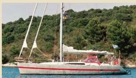
SARANAÏA Saranaïa 50 15.00 m 2005 6 guests 230,000 €