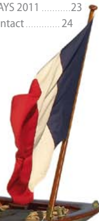
Moonbeam of Fife III, p. 3