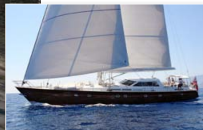
Neptune, p. 5