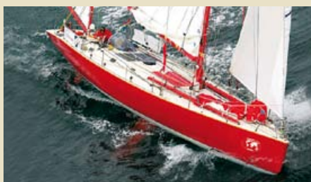
LE CIGARE ROUGE 60ft Open Yawl 18.28 m 1991 140,000 €