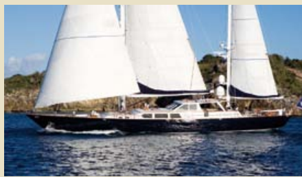
AXIA 37.49 m 6/6 Caribbean 48,000 €/week