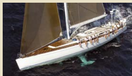
LUPA OF LONDON 23.95 m 6/3 West Mediterranean 27,000 €/week