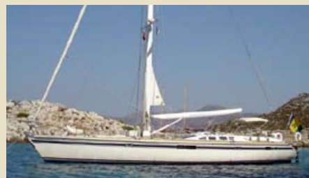
ZARIK Dynamique 62 18.73 m 1985 8 guests 300,000 €