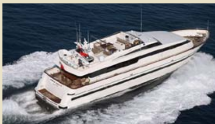
AFRICAN QUEEN San Lorenzo 30 30.48 m 1995 8 guests 1,350,000 €