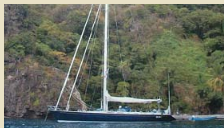
SILANDRA Nauta 72 21.33 m 1991 8 guests 995,000 US$