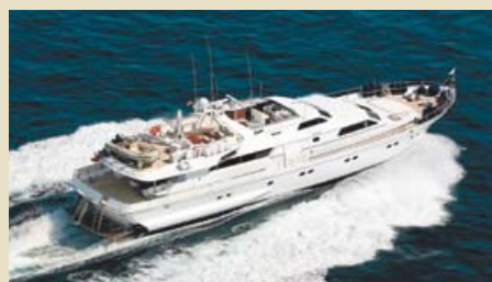
ANTISAN 33.00 m 11-40/6 West Mediterranean 56,000 €/week