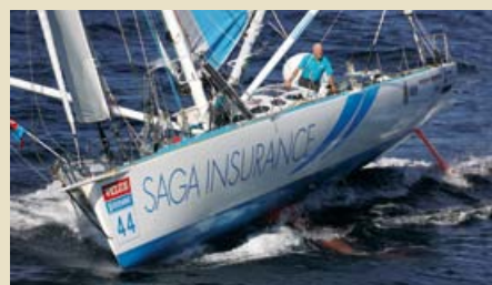
SPARTAN, ex SAGA 60ft Open IMOCA 18.28 m 1997 200,000 GBP