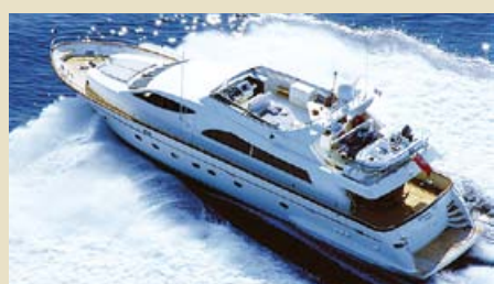
LAMPQUICK 26.00 m 9/4 West Mediterranean 35,000 €/week