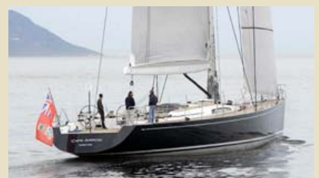
CAPE ARROW 30.20 m 8/4 West Mediterranean 45,000 €/week