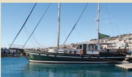
BOJAROS Steel Ketch 25.60 m 2000 10 guests 395,000 €