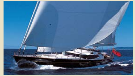
DRUMBEAT 53.00 m 11/10 West Mediterranean 170,000 €/week