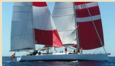
FORTUNA Ex Maxi IOR 25.40 m 1989 1,500,000 €