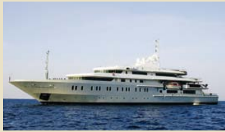
MOONLIGHT II (Ex Alysia) 85.30 m 36/27 Indian Ocean/Maldives 695,000 €/week