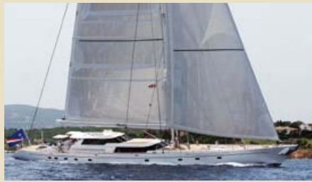
HYPERION 47.42 m 6/8 West Mediterranean 90,000 €/week