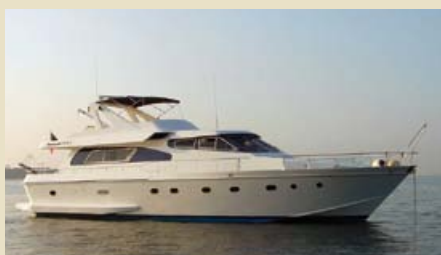
CELESTIAL Navarcantieri P 21 S 22.60 m 1997 8 guests 490,000 €