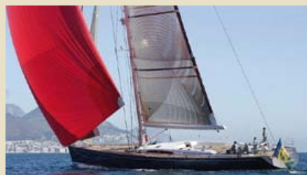
Mrs SEVEN 30.20 m 8/5 West Mediterranean/Caribbean 52,000 €/week