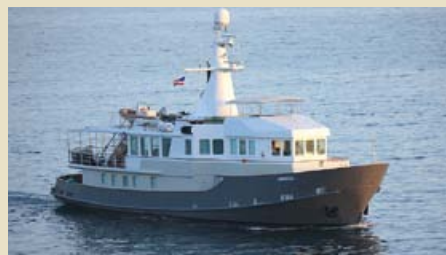
AMNESIA Veb J Warnke, Germany 33.53 m 1990/1999 6 guests 1,900,000 US$