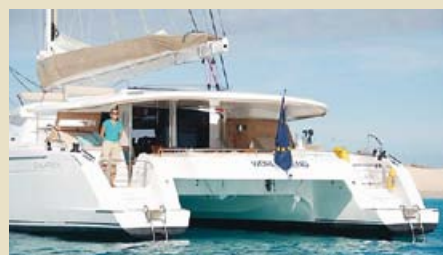
Catamaran WORLD'S END 19.67 m 10-12/3 West Mediterranean 25,000 €/week