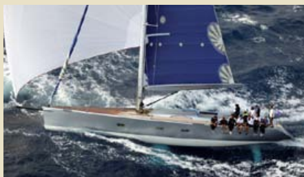
CHARIS Maxi Dolphin 65.3 20.01 m 2004 1,270,000 €