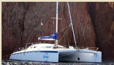
JEMAYKA Maia 180 19.50 m 2001 8 guests 659,000 €