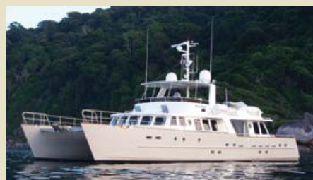
SONG SAIGON Displacement Motor Yacht 24.00 m 2008 8 guests Cannes and Monaco YS 2011 1,780,000 €