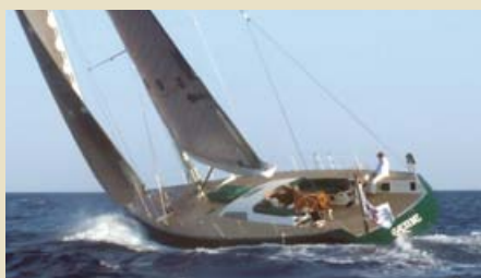
GENIE 24.00 m 6/3 West Mediterranean 30,000 €/week