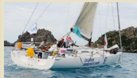
JUMPA LAGI Pogo 40 12.18 m 2009 220,000 €