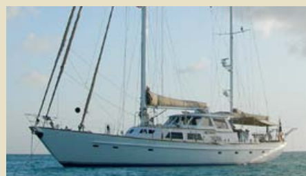
SCHEHERAZADE Palmer and Johnson Ketch 25.50 m 1983 6 guests 690,000 €