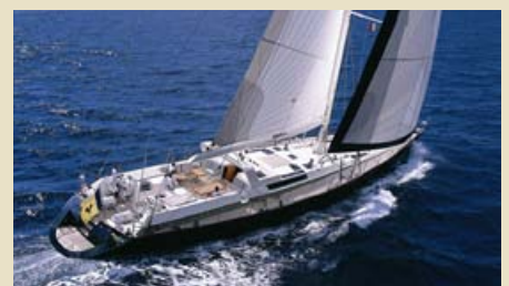
AMADEUS 33.50 m 12/5 East Mediterranean 40,000 €/week