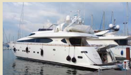
LADY KATANA II Maiores 30 DP 30.20 m 1997 8 guests 1,980,000 €