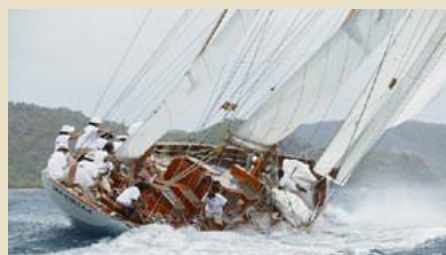
MARIELLA 24.08 m 6-12/3 Caribbean 24,000 €/week