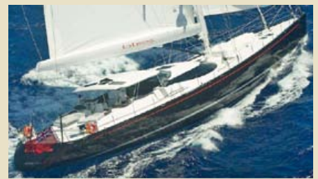
BLISS 37.00 m 10/4 Pacific Ocean 65,000 €/week