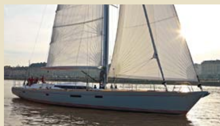
SWALLOW & AMAZONE 23.70 m 8/3 Mediterranean-Caribbean 23,000-25,000 €/week