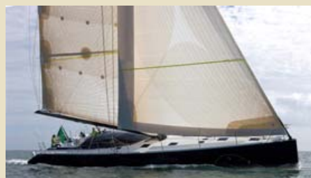
OURSON RAPIDE 60ft Multiplast 18.28 m 2009 ? guests Voiles de St-Tropez 2011 2,750,000 €