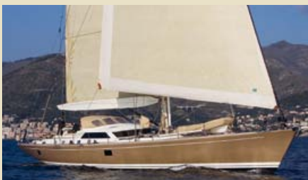
DHARMA Southern Wind Shipyard 29.00 m 2005 8 guests 3,700,000 €