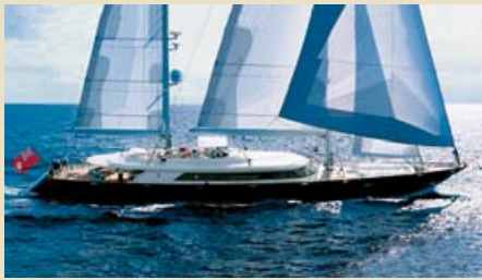
PERSEUS 49.80 m 10/9 Pacific Ocean 130,000 €/week