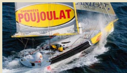
CHEMINEES POUJOULAT I 60ft Open IMOCA 18.28 m 2000 290,000 €