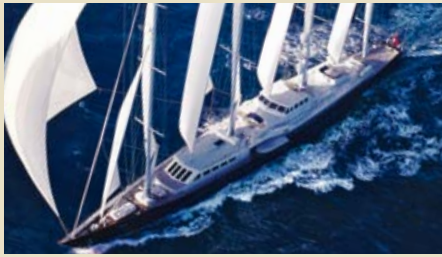
Name: PHOCEA Length: 75.15 m Guest/Crew: 12/16 Area: Mediterranean-Caribbean Rate: 160,000-180,000 €/week