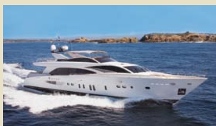
LADY EMMA 34.10m 8/4 West Mediterranean 72,000 €/week