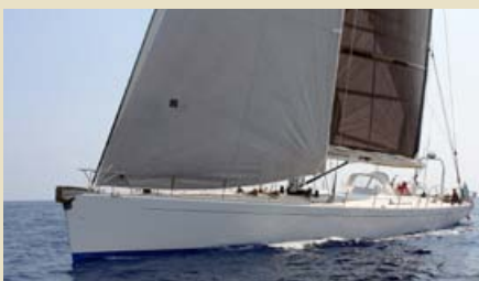
QUINTA SANTA MARIA Composite Cruising Sloop 27.42 m 2001 8 guests Cannes and Monaco YS 2011 2,500,000 €