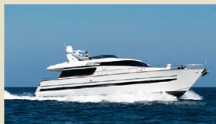
BST San Lorenzo 72 21.70 m 1999 8 guests 990,000 €