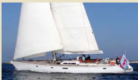
DJANGO TOO 25.00 m 8/4 West Mediterranean/Caribbean 25,000 €/week