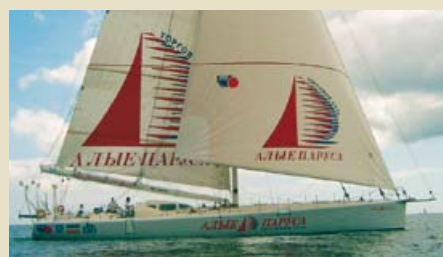
ALYE PARUSA Maxi Open monohull 27.00 m 2000 750,000 €