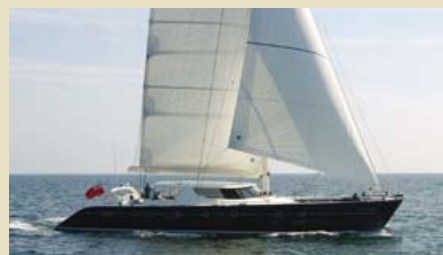
SUN TENAREZE Catamaran-JFA 25.75 m 2004 8 guests 2,500,000 €