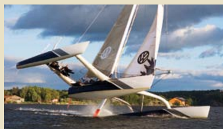
HIQ 60ft ORMA Trimaran 18.28 m 1998 Major price reduction 600,000 €