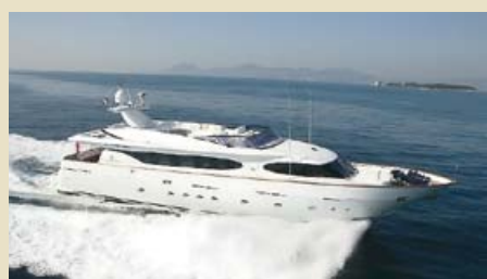
TALILA 29.00 m 8/4 West Mediterranean 40,000 €/week