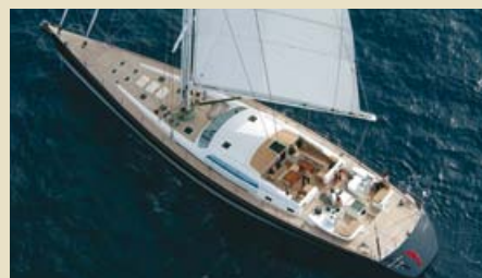
GRAND BLEU VINTAGE 29.00 m 8/4 West Mediterranean 45,000 €/week