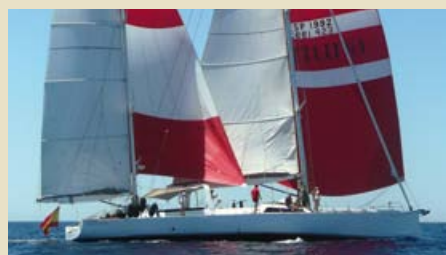
FORTUNA Ex Maxi IOR 25.40 m 1989 12 guests 900,000 €