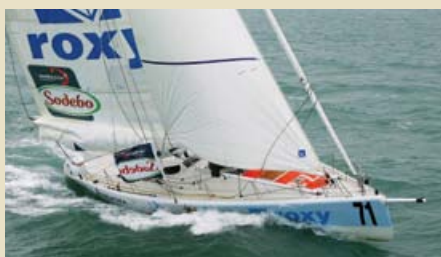
EX ROXY 60ft Open IMOCA 18.28 m 1989 Major price reduction 220,000 €