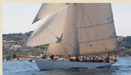
MOONBEAM III Circuit CIM 28.20 m 1903 2,500,000 €