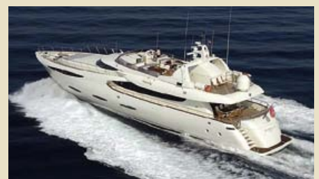
MABRUK III 35.00 m 10/6 West Mediterranean 70,000 €/week