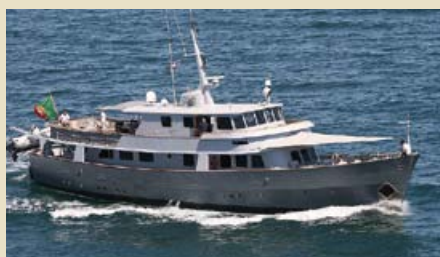
LA FENICE 33.00 m 8/5 West Mediterranean 30,000 €/week