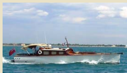
ALLEGIANCE Réplique C&N 1925 14.40 m 2004 6 guests 330,000 €