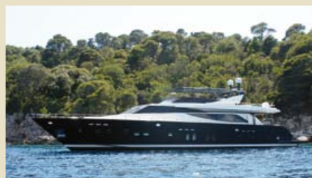
BJORG II Guy Couach 2800 LR 28.00 m 2002 8 guests 1,995,000 €