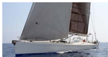
"QUINTA SANTA MARIA" 2001 – Length: 27.42 m