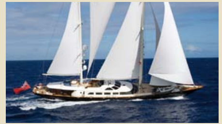
ANTARA 46.00 m 12/8 West Mediterranean/Caribbean 125,000 US$/week