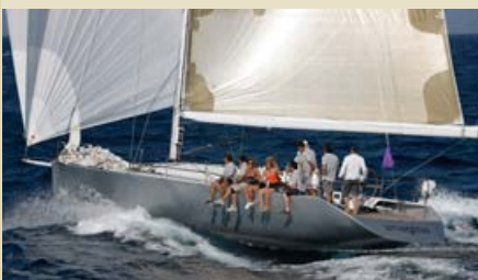
IMAGINE Brenta 55 17.10 m 2003 550,000 € 450,000 €