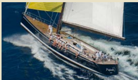
NEFERTITI 27.70 m 8/4 West Mediterranean/Caribbean 44,000 €/week