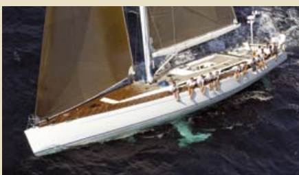
LUPA OF LONDON Baltic 78 Custom 23.95 m 2000 8 guests 1,950,000 €