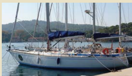
SCARAMOUCHE Swan 57 17.37 m 1978 6 guests 225,000 €