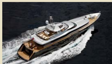
COMO Alloy Yachts 134ft 41.14 m 2007 10 guests 13,950,000 €