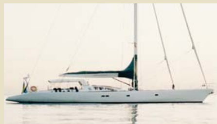
SUSANNE AF STOCKHOLM Aluminium sloop 30.16 m 1990/2008 8 guests 3,500,000 €