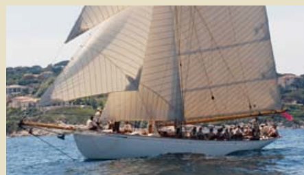
MOONBEAM OF FIFE III Gaff Cutter 31.00 m 1903 10 guests Voiles de Saint-Tropez 2011 2,500,000 €