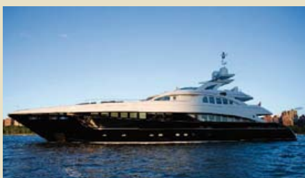
BLISS 44.17 m 10/9 West Mediterranean 160,000 €/week