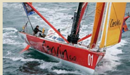
ENERGIE AUTOUR DU MONDE 60ft Open IMOCA/Eco Class 18.28 m 1996 200,000 €