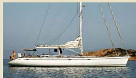
AEGIR Levrier 18 18.00 m 1995 8 guests 420,000 €