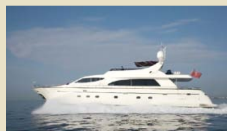
ANTALEX 26.00 m 8/4 West Mediterranean 36,000 €/week