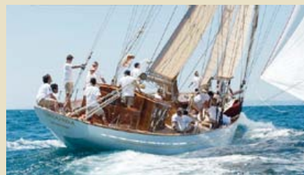
ORIANDA 26.00 m 8-12/3 West Mediterranean 16,000 €/week