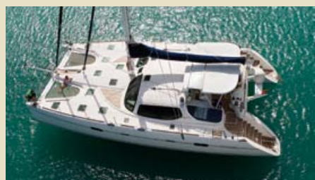
OCEAN'S SEVEN Privilege 585, Catamaran 17.82 m 2004/2007 8 guests 836,000 €