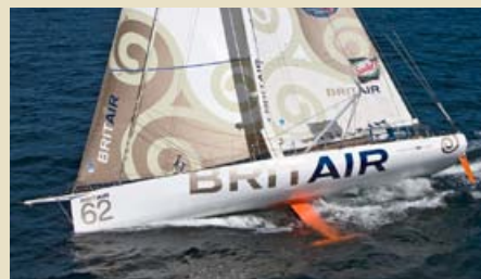
BRIT AIR 60ft Open IMOCA 18.28 m 2007 1,450,000 €