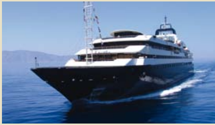
Name: TURAMA Length: 117.35 m Guest/Crew: 70/58 Area: East Mediterranean Rate: 90,000 €/day