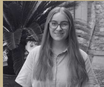
Emerald ROACH Charter Assistant +33 (0)4 67 66 39 93 charter@bernard-gallay.com